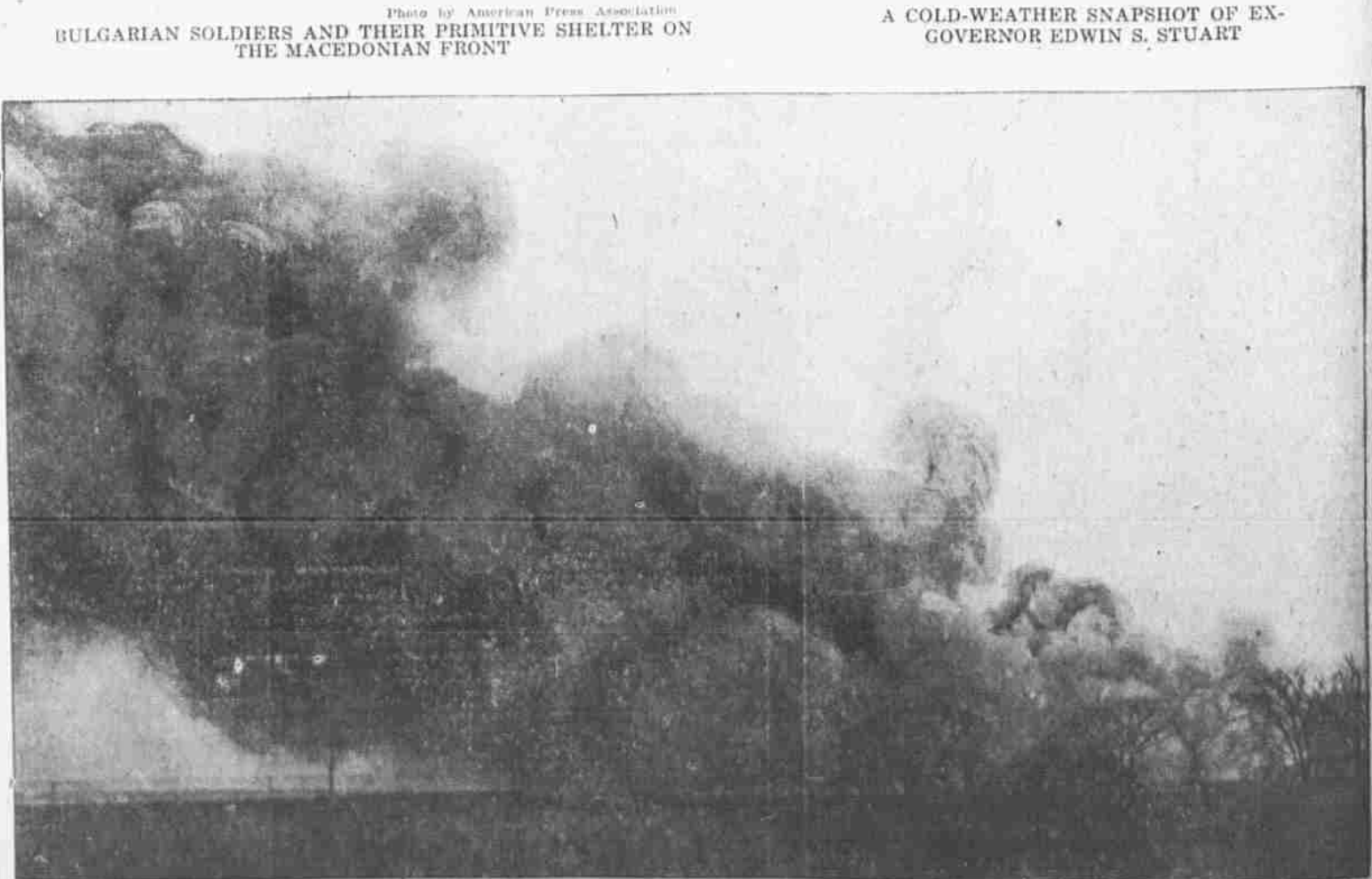
GREAT FIRE WHICH FOLLOWED EXPLOSION AT KINGSLAND, N. J., MUNITION PLANT, WHERE $12,000,000 WORTH OF PROPERTY WAS DESTROYED