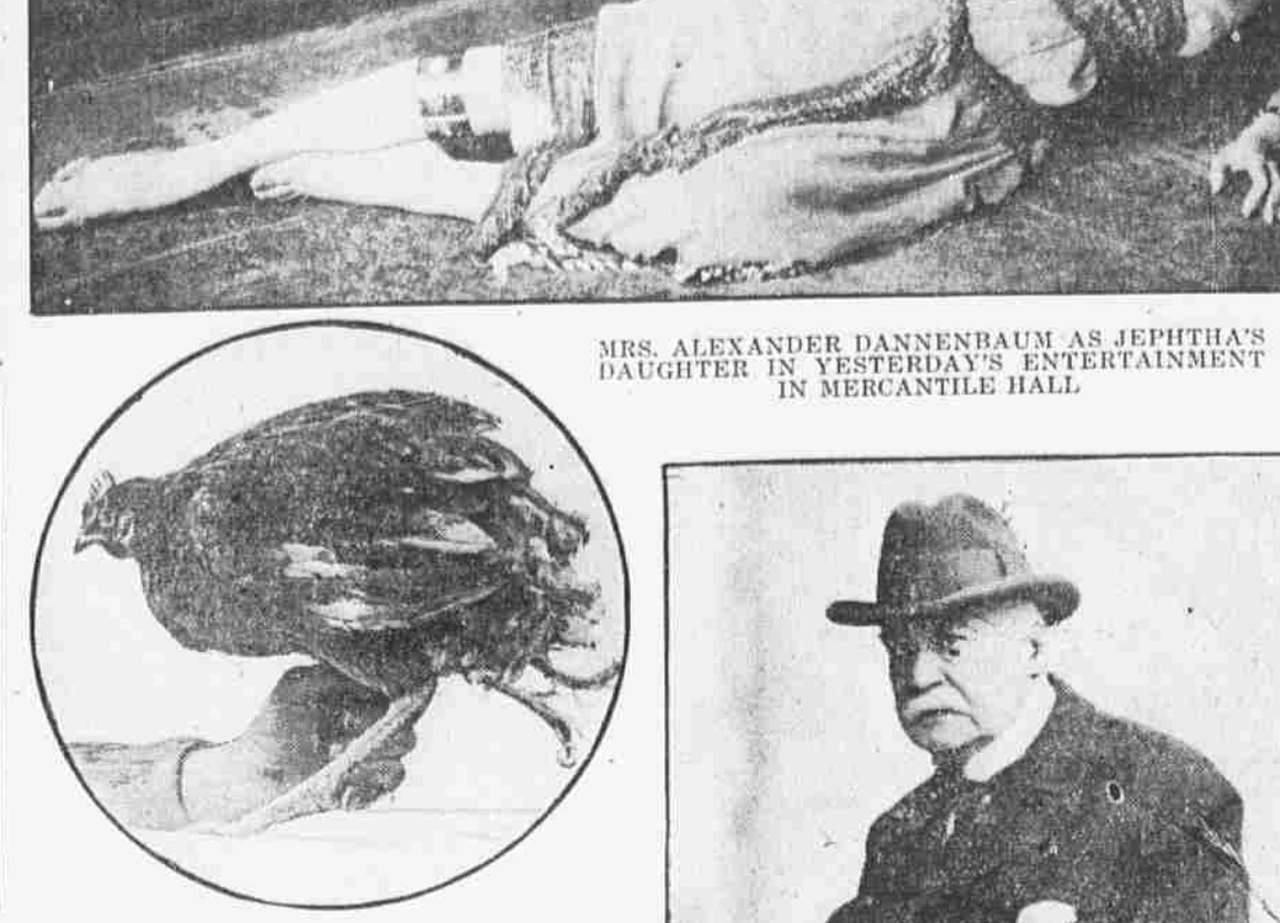
FOUR-LEGGED CHICKEN IS MAS-COT BROUGHT FROM SOUTH AMERICA BY FRUIT LINER