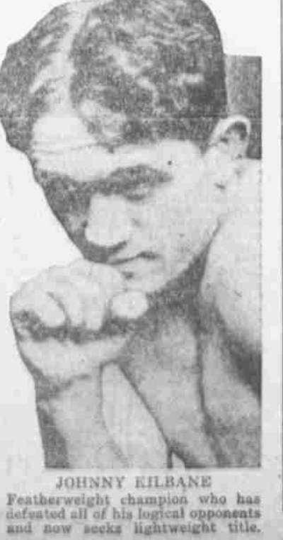
JOHNNY KILBANE Featherweight champion who has defeated all of his logical opponents and now seeks lightweight title.