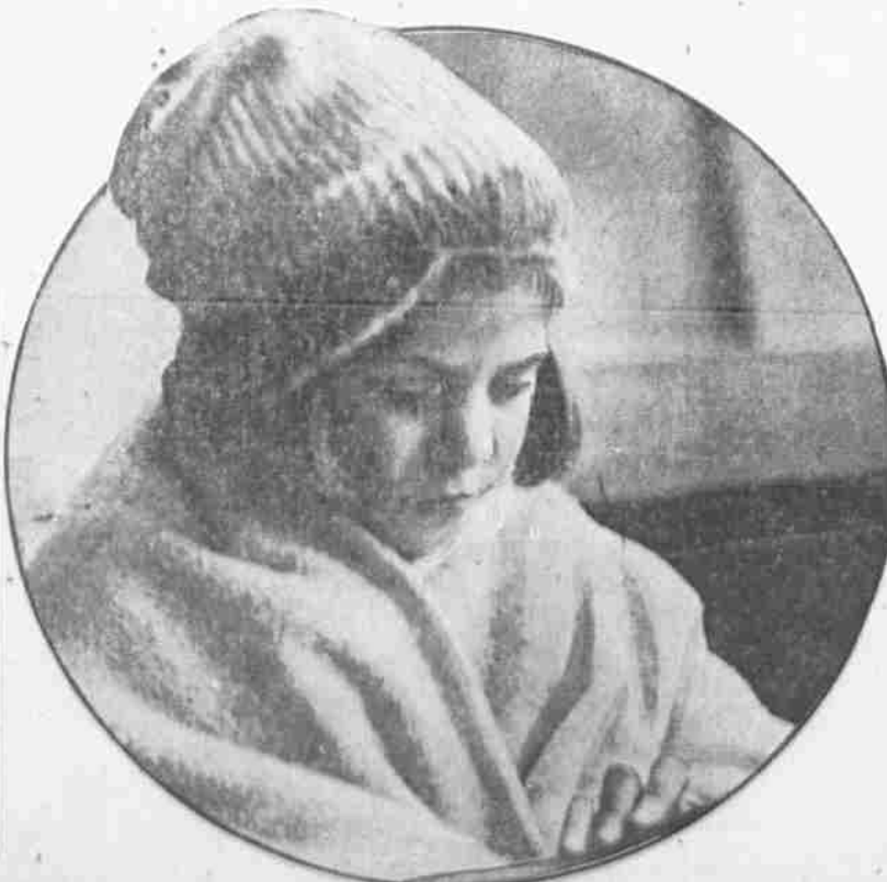
ONE OF THE HOODED AND BLANKETED PUPILS