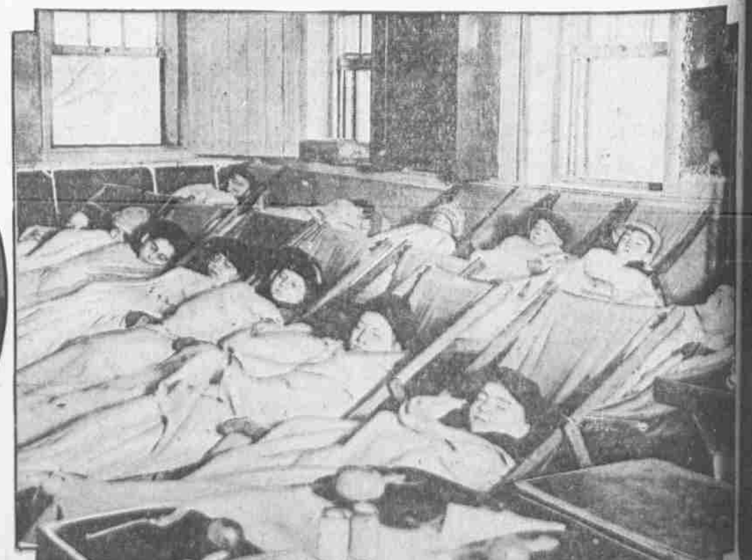
THE 1 O'CLOCK NAP IS AN ESSENTIAL PART OF THE DAY'S SCHEDULE