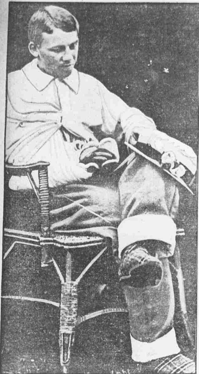
BRITISH SOLDIER SOLEMNLY TRIMMING A WOMAN'S HAT IN A PRIZE CONTEST IN WHICH PARTICIPANTS WERE CONVALESCENT WOUNDED MEN