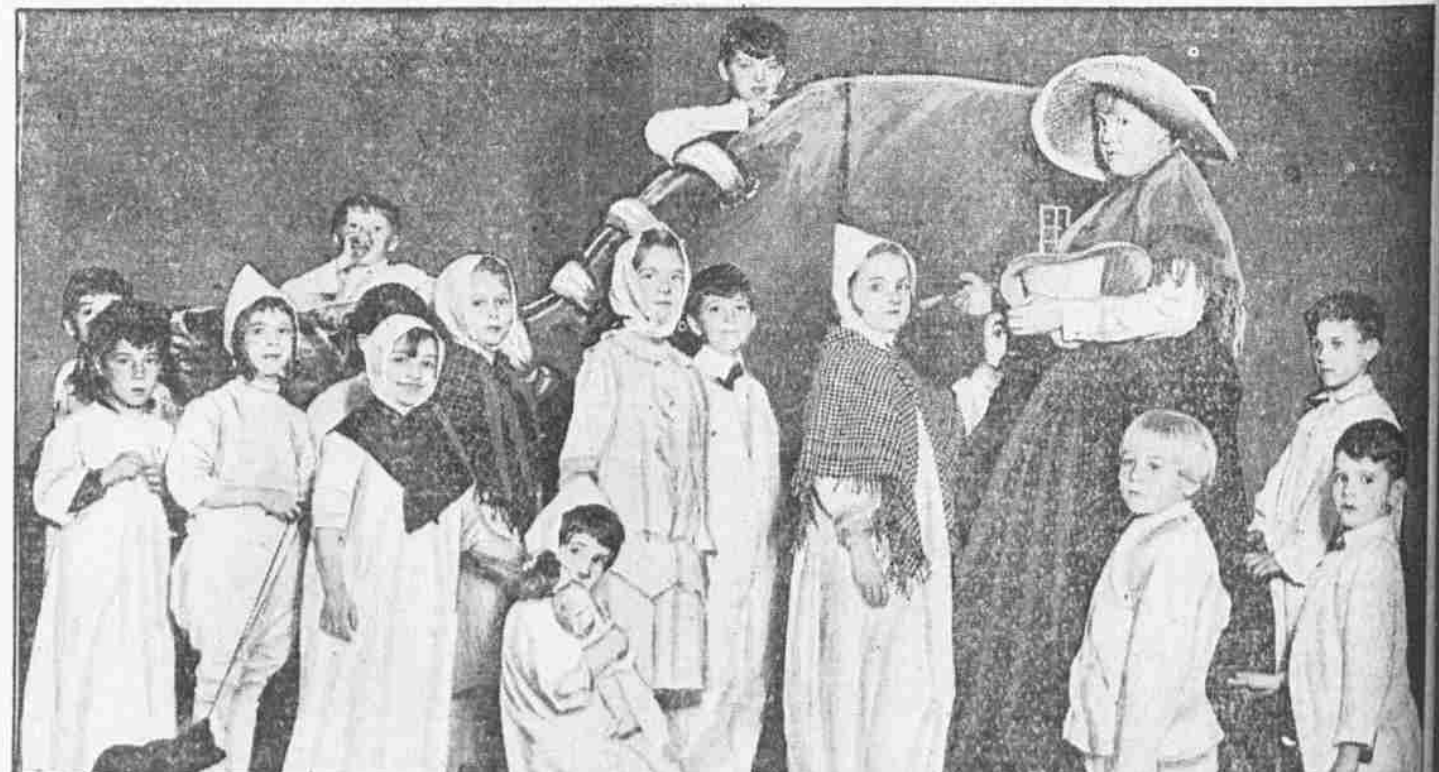
"THE OLD WOMAN WHO LIVED IN A SHOE" — ONE OF THE TABLEAUX GIVEN BY THE LLANERCH WOMAN'S CLUB