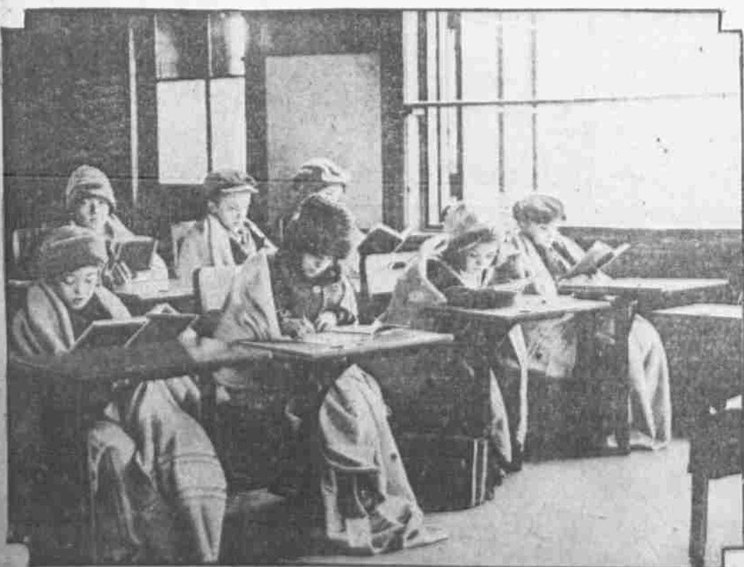
OPEN-AIR CLASSES HELD DAILY AT THE GIRARD SCHOOL, WHERE FRAIL CHILDREN ARE TAUGHT HOW TO OBTAIN HEALTH AND EDUCATION SIMULTANEOUSLY