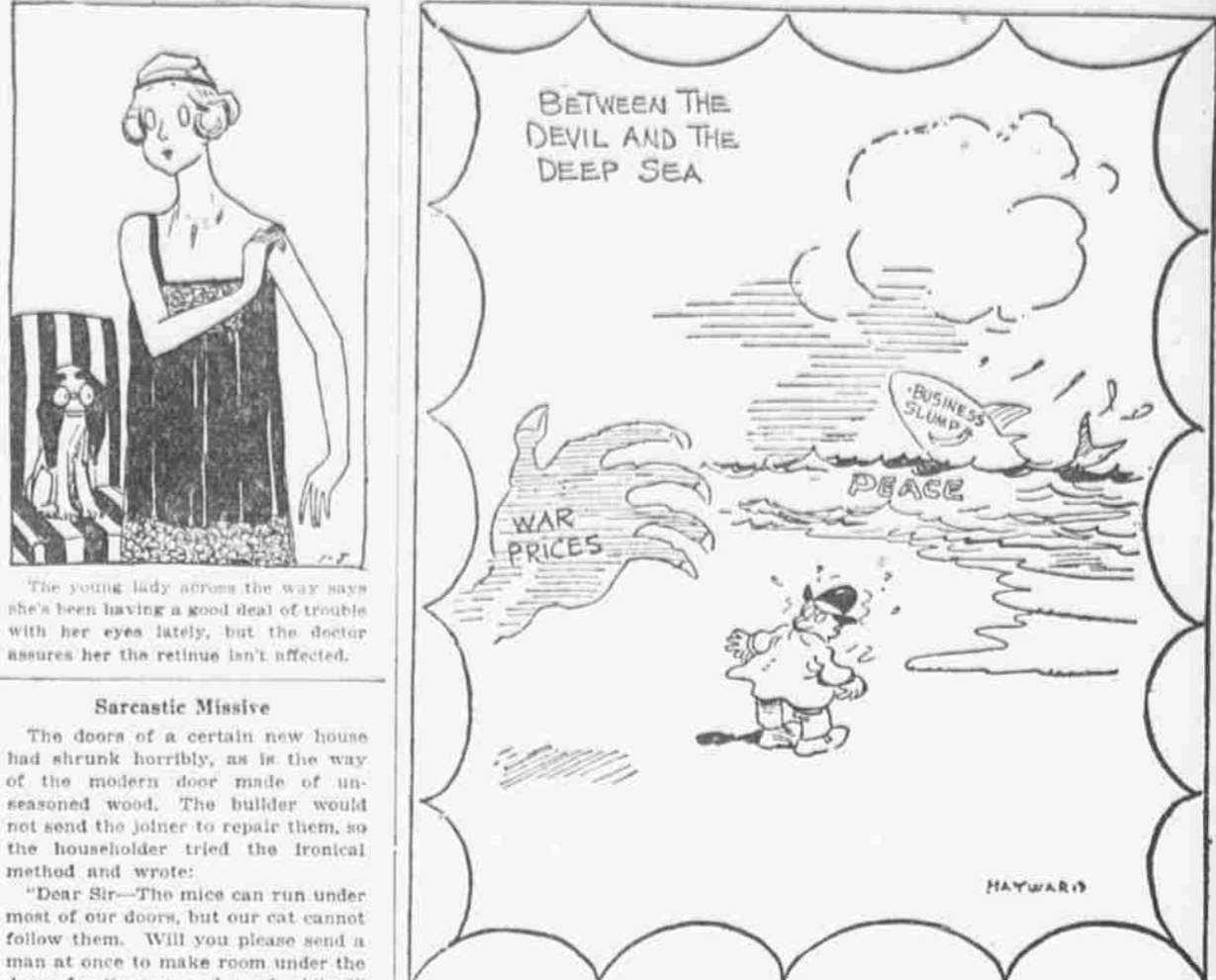
Between the Devil and the Deep Sea. The young lady across the way says she's been having a good deal of trouble with her eyes lately, but the doctor assures her the retina isn't affected.

The Young Lady Across the Way THE PADDED CELL