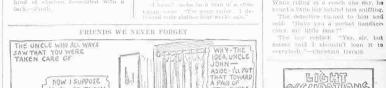
Friends We Never Forget