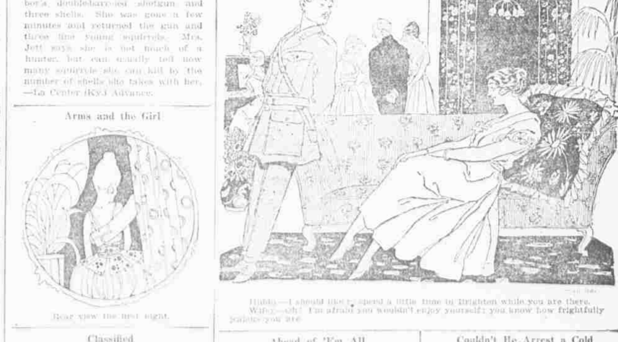
Arms and the Girl