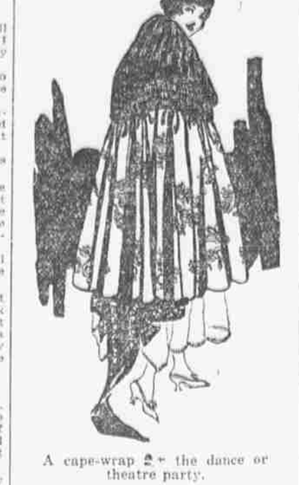
A cape-wrap—the dance or theatre party.