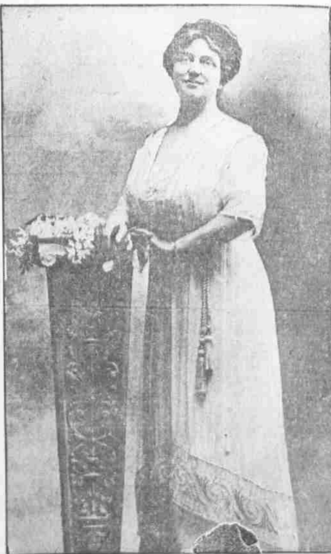
LOUISA OF SAXONY, DIVORCED WIFE OF THE PRESENT KING AND HEROINE OF TWO ELOPEMENTS, IS NOW REPORTED CONFINED IN AN ASYLUM IN DRESDEN