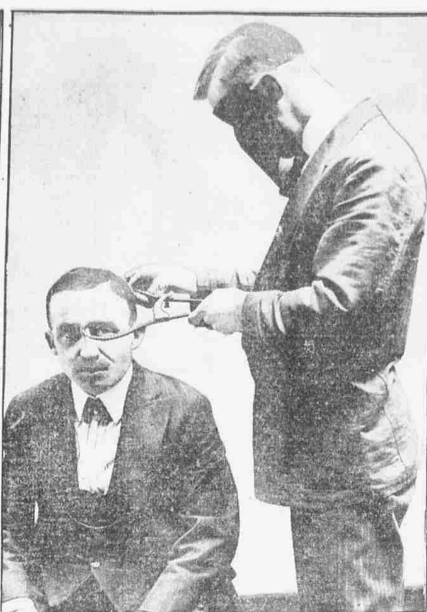
GETTING DATA ON A PRISONER FOR THE POLICE RECORDS Two of the most important measurements are those of his height and the depth of his head from forehead to back. The measure-taker is always masked. Note on the left how he presses his leg against the prisoner's knee to prevent the latter from "hunching up" to conceal his height.