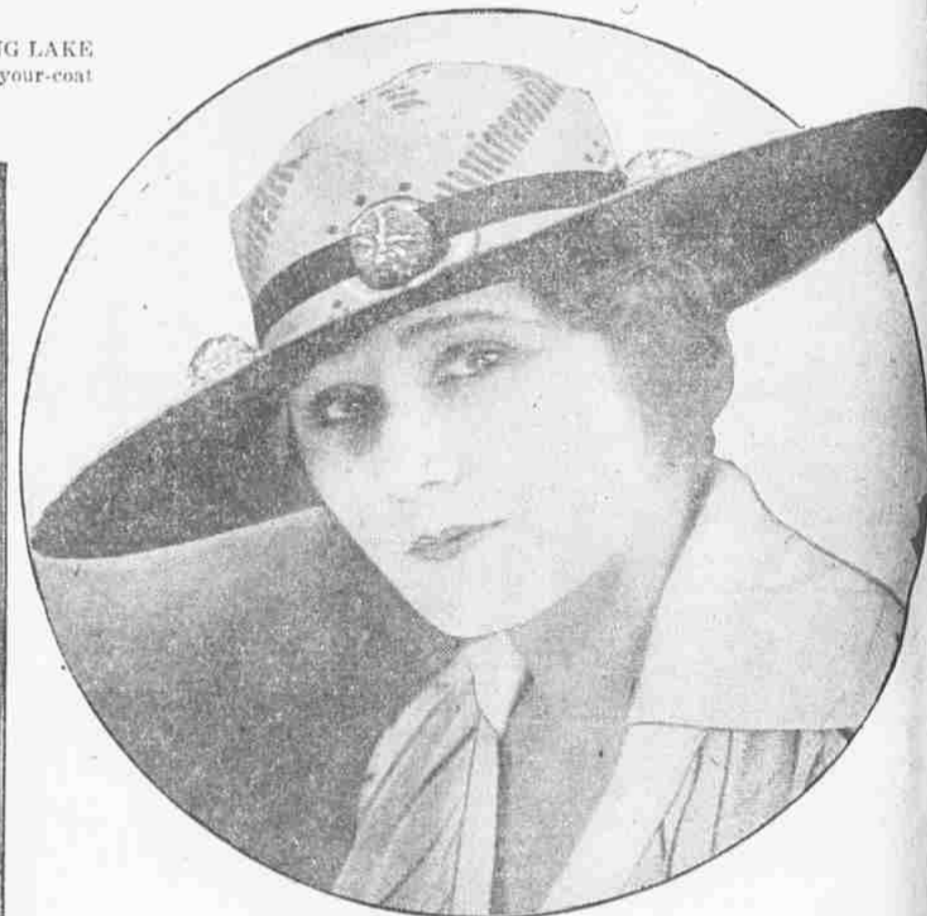
FOR SPRING—A FLOWERED YO SAN HAT, WITH BEADED BELLS AROUND THE CROWN, IS A NEW PRODUCTION