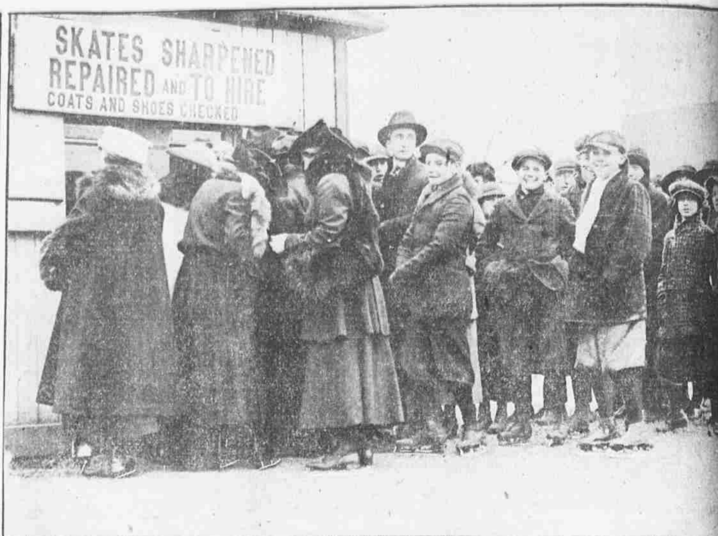
AFTER-SCHOOL RUSH TO THE SKATING LAKE First come is first served at the check-your-coat house on the park lakes.