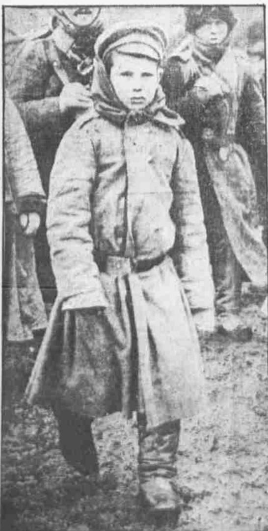
THIS RUSSIAN SOLDIER OF FOURTEEN WAS A RECENT GERMAN CAPTURE IN THE CARPATHIANS