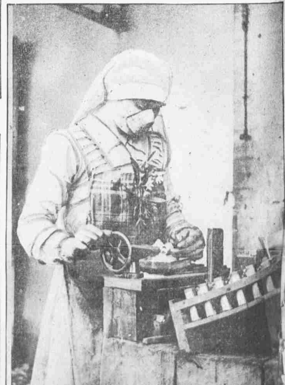
YOUNG WOMAN AT DANGEROUS OCCUPATION OF MAKING SHELLS. NOTE THE PROTECTION FROM DEATH-GIVING FUMES