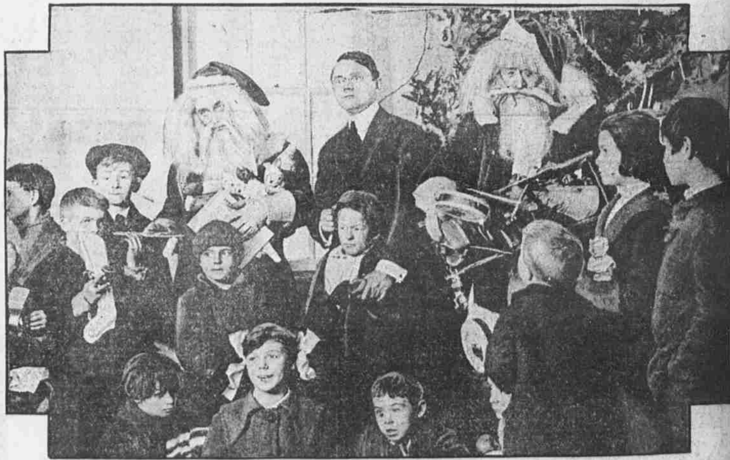
YOUNGSTERS WHO PROMISED TO BE GOOD GET CHRISTMAS TREE IN COURT Scenes of riotous joy took place in the new Municipal Court building yesterday when Judge Raymond MacNeill (center) presided over the distribution of gifts to young probationers.