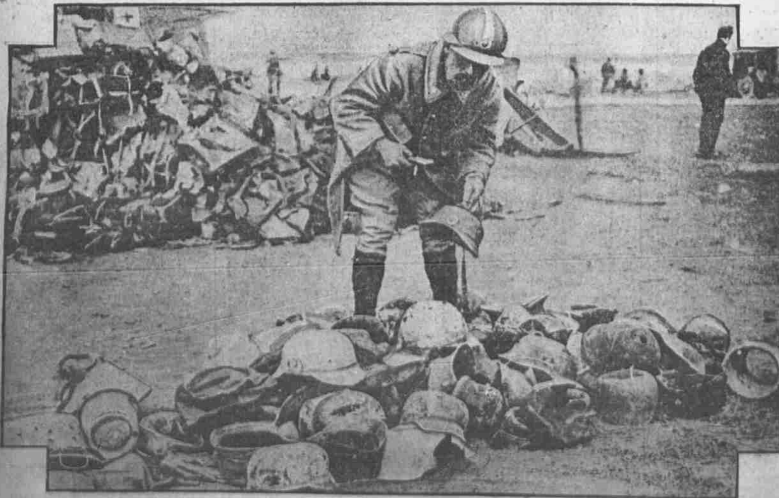
COLLECTING HARVEST OF GERMAN HELMETS AFTER A BATTLE These grim mementoes of men who were a short time before alive and active are being sorted by a French soldier for their metal and valuable trimmings.