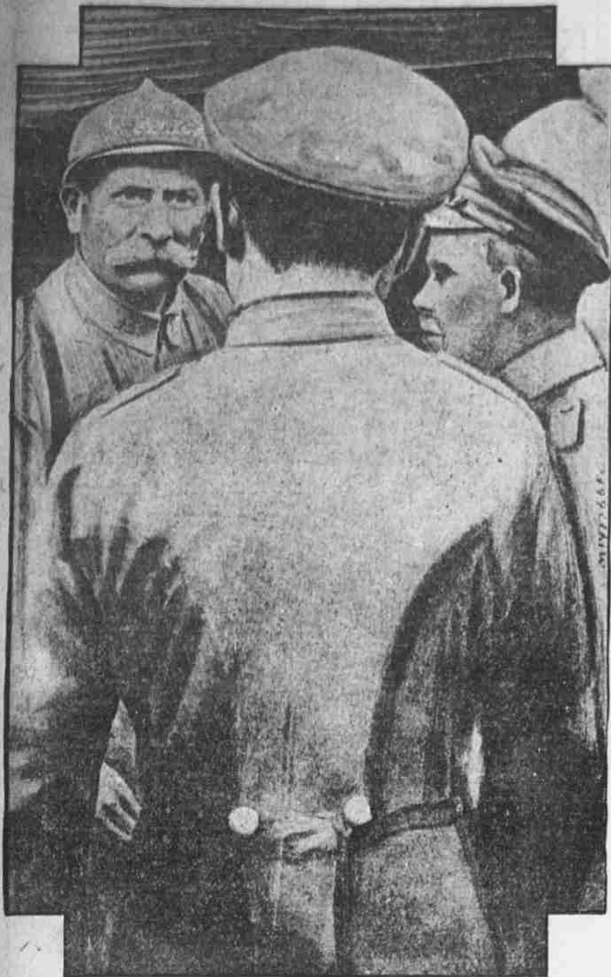
FRENCH COLONEL GIVES PRISONERS "THIRD DEGREE" The chief feature of this picture is the expression on the colonel's face as he seeks to extract every particle of information from the two Germans.