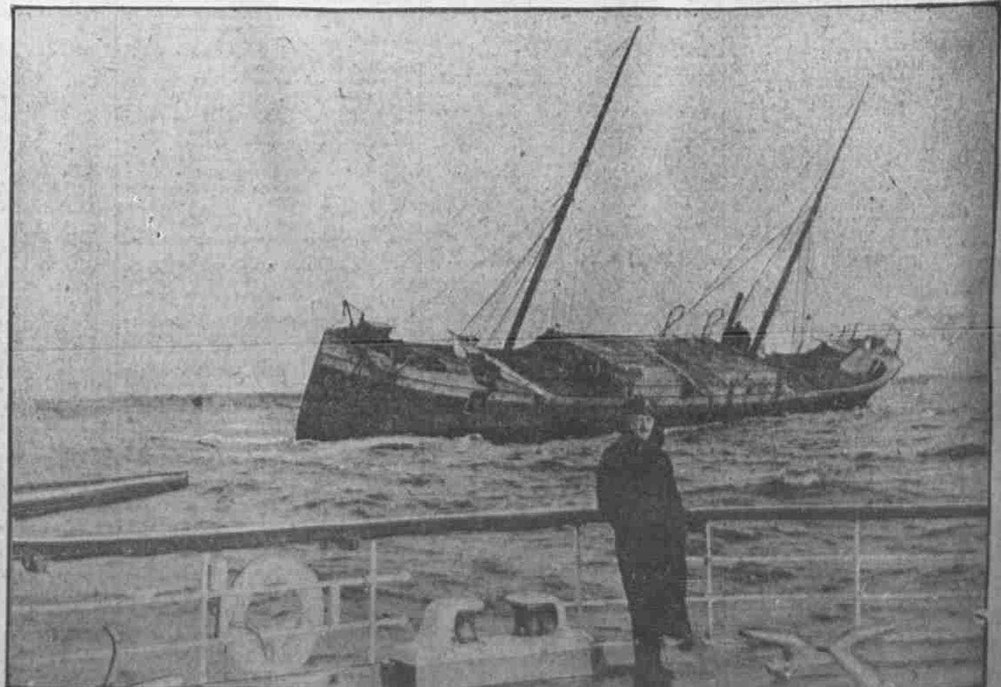
UNITED STATES CUTTER PULLS ABANDONED BRAZILIAN SHIP OUT OF STORM The Seneca is sending a line to the listing Nephthys, which the former found and towed into port through a storm that carried both 100 miles out at sea.