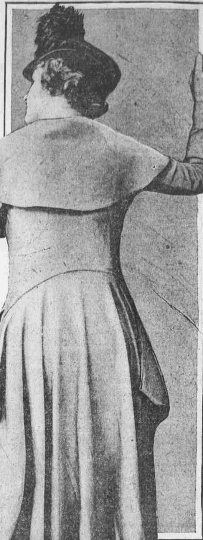
A HERALD OF FAR-OFF SPRING

Snappy spring model in tan kersey weave, military cuffs and two trench pockets, declared to be "absolutely new."