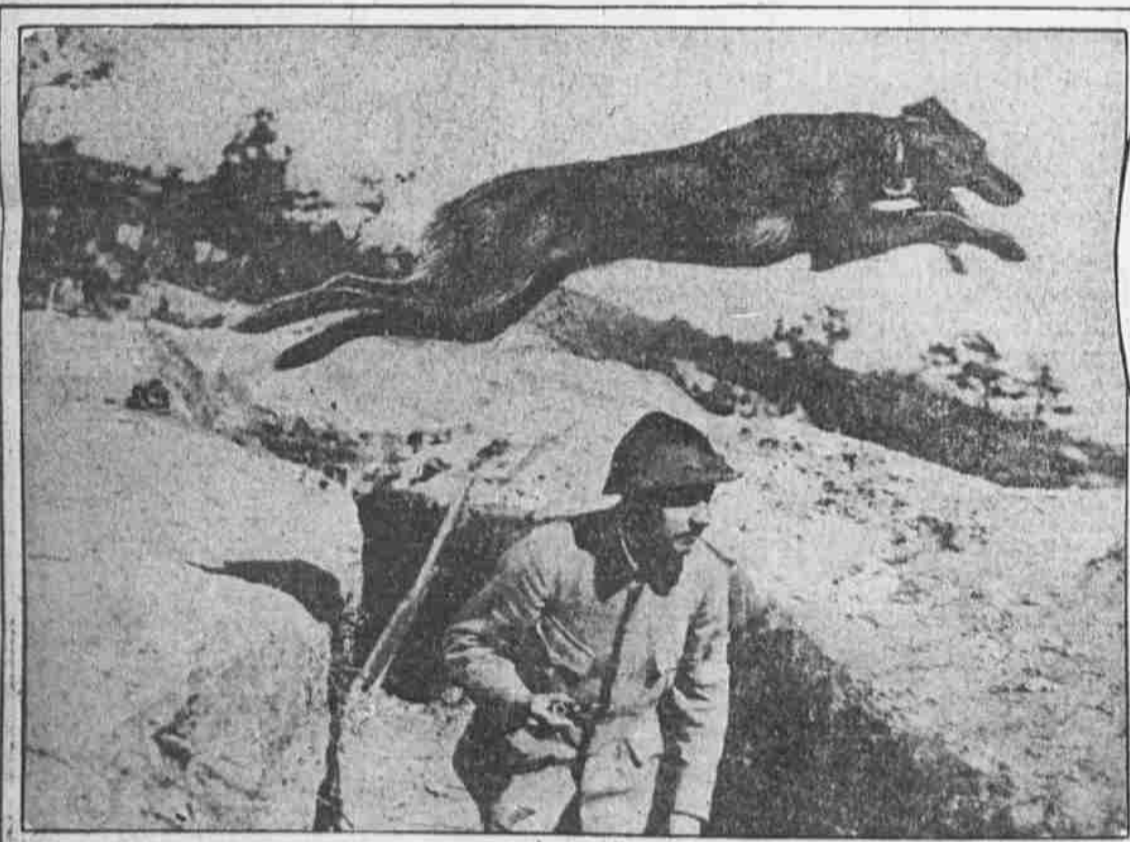
OFF ON A MISSION OF MERCY A remarkable picture of a French Red Cross dog clearing a trench at a bound in eagerness to rescue the wounded.