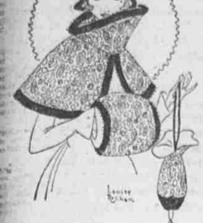
Adapting the old Paisley shawl of our grandmothers' time to present-day styles.

MODES VEER TO EMPIRE Genuine Hindu Product Worth Weight in Gold—Scotch Also Valuable