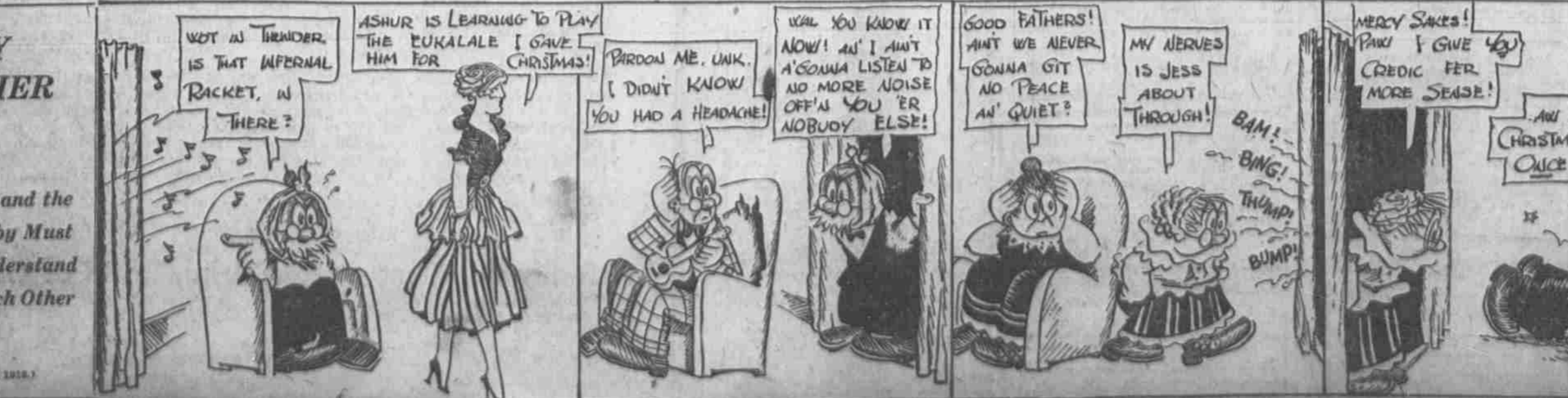
Pa and the Baby Must Understand Each Other