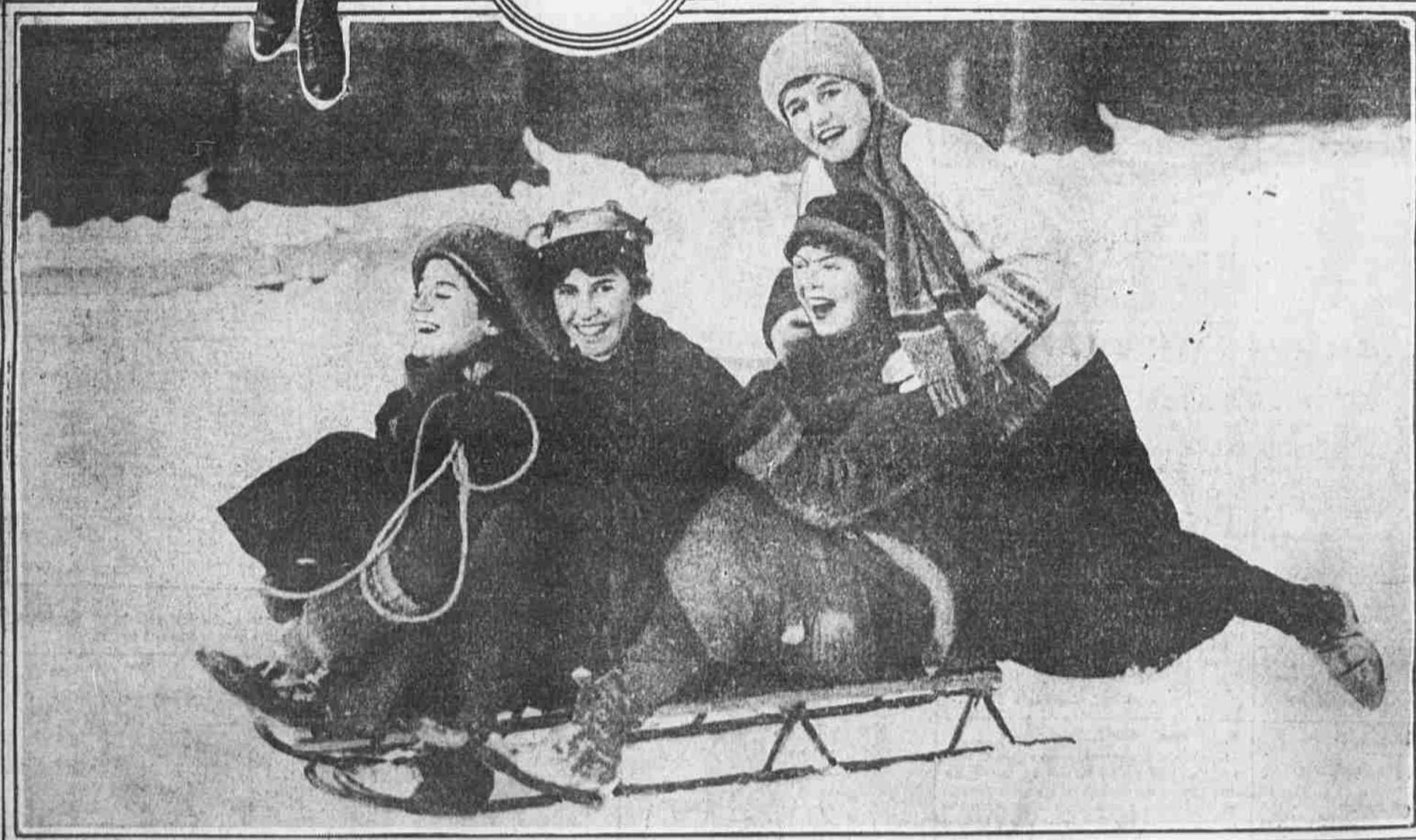
ONE CAN ALWAYS HAVE FUN WITH A BOBSLED AND PLENTY OF SNOW For the first time in several years Philadelphia has had a heavy snow before Christmas and every available hill in town and suburb has had its joyful patrons.