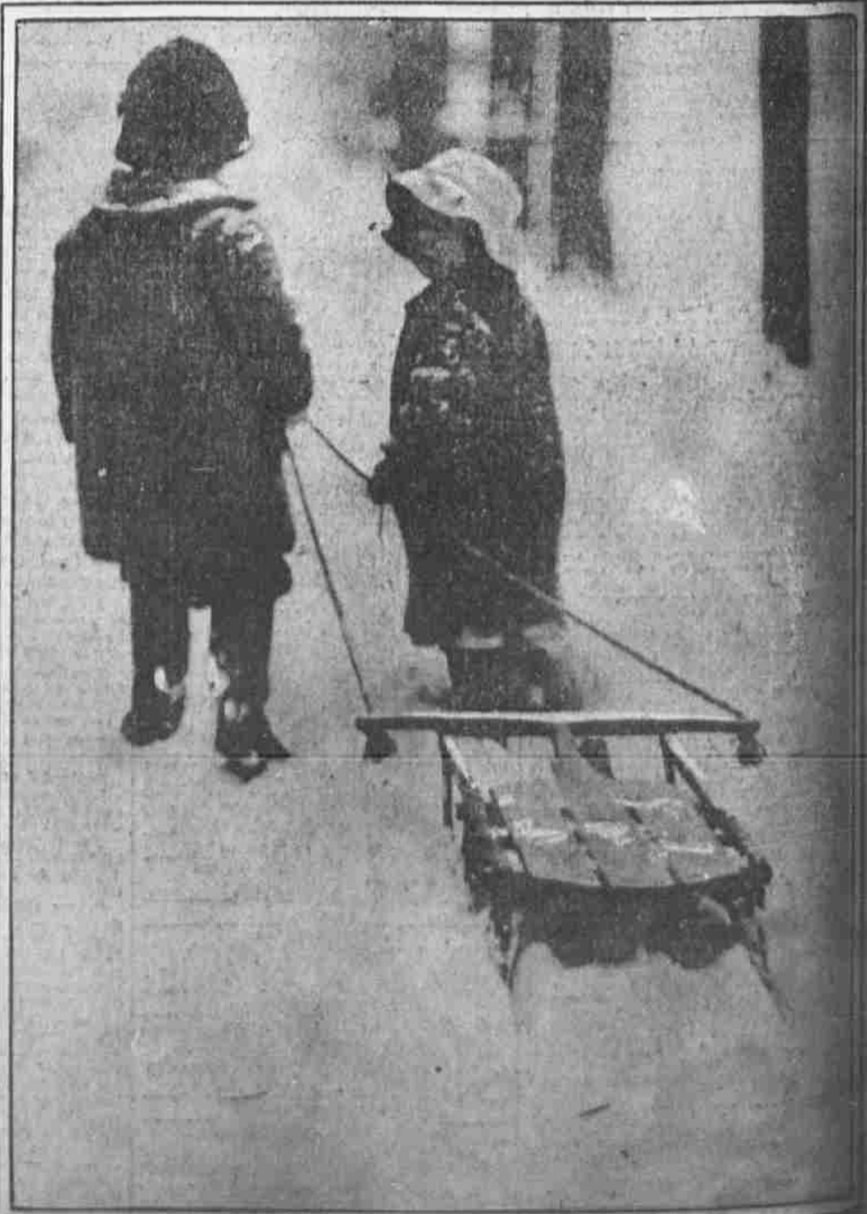
YOU MAY NOT CARE FOR SNOW-CLOGGED STREETS, BUT THERE ARE OTHER INHABITANTS THAT DO