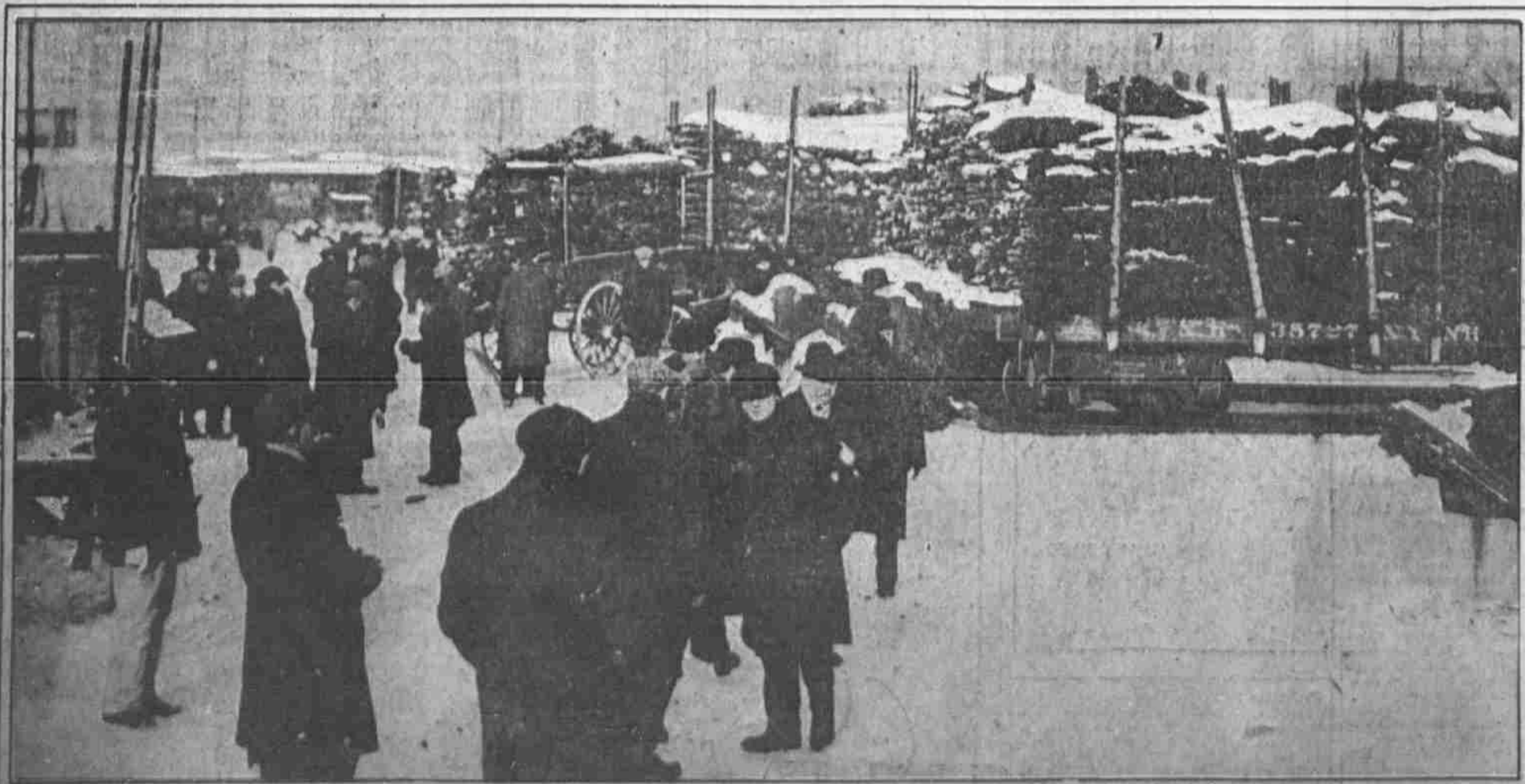
RETAIL DEALERS GATHER AS CHRISTMAS TREE CARS ARRIVE Perhaps 200 cars loaded with fir and spruce have arrived in the Indiana avenue yards of the Reading Railway. Clusters of buyers meet every shipment.