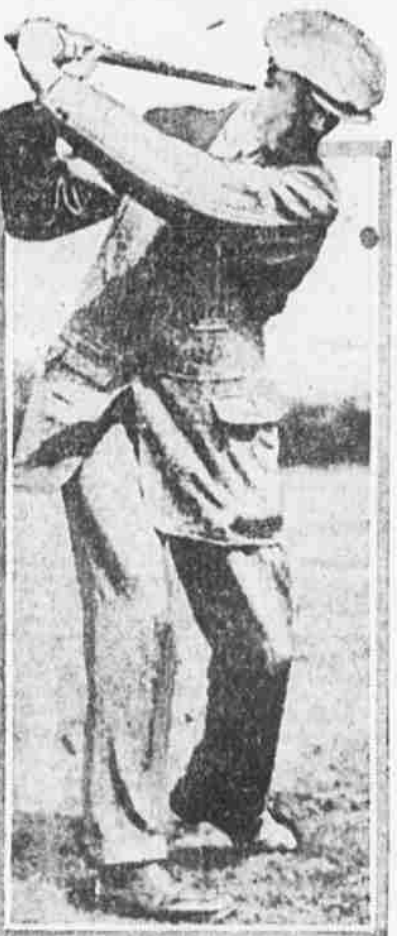
WORLD-WIDE FAME WAS HIS GOLFING lost one of its greatest stars when James Braid, the Scottish phenom and international player, lost his life when trying to board a moving train.

Braid's Resourcefulness Jerry Travers, who played against Braid at Walton Heath three years ago, was greatly impressed by the Scot's wonderful resourcefulness.