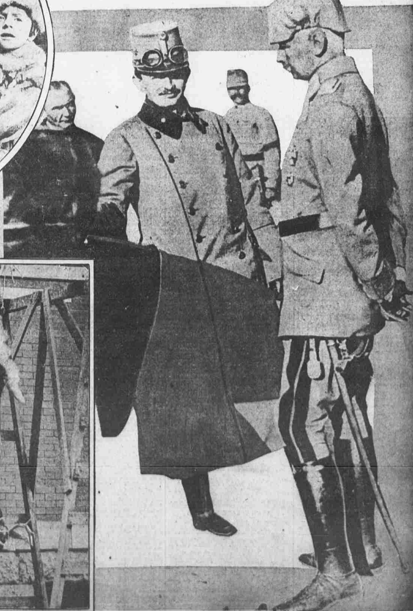
EMPEROR CHARLES FRANCIS AND GENERAL VON FALKENHAYN This meeting of Austria-Hungary's new monarch and one of Rumania's conquerors took place at Kronstadt just after the Rumanian flight.