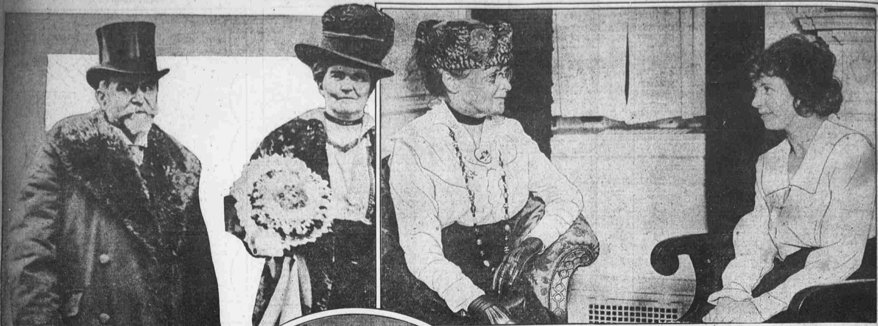
TWO WOMEN OF ACHIEVEMENT MEET FOR FIRST TIME Miss Annie Peck (left) the peak climber, and Ruth Law, the aviatrix, are pictured in the midst of their first conversation. Though both are of frail build, each has gained fame through feats requiring skill, muscle and brains.