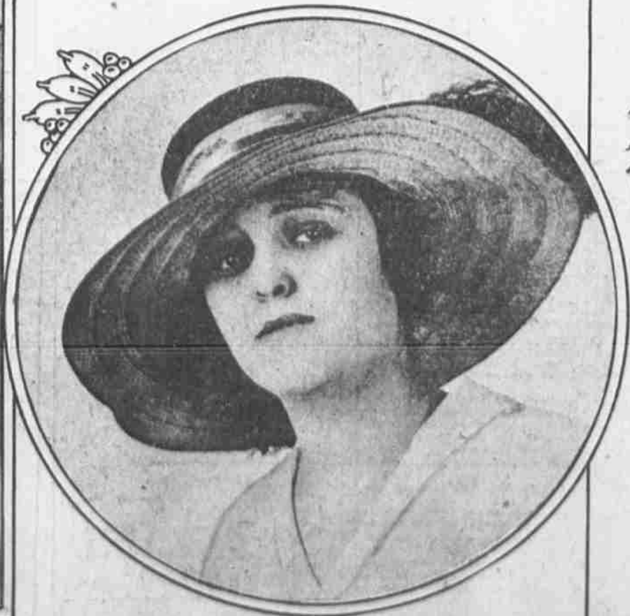
AN EARLY GLIMPSE OF WHAT'S NEW IN SPRING BONNETS A leghorn hat covered with gray chiffon faille and trimmed with two soft ostrich feathers.