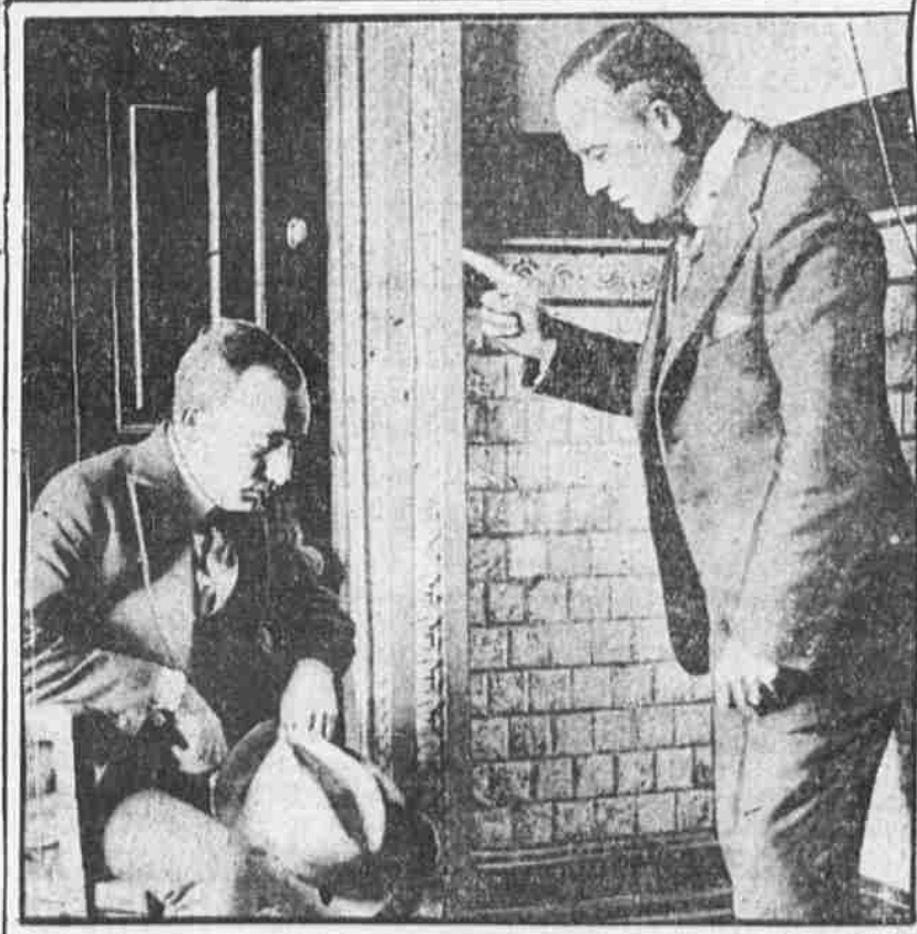
HIS "PEDIGREE" IS TAKEN BY CAPTAIN OF DETECTIVES TATE