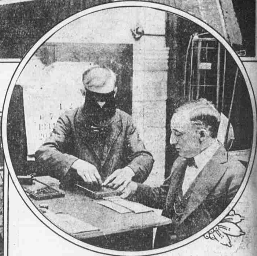
FINGER PRINTS ARE TAKEN TO SEE IF HE HAS BEEN "UP" BEFORE