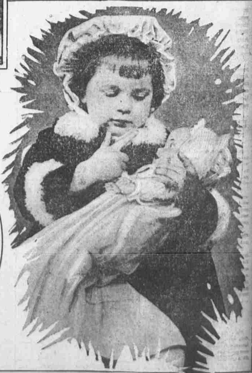
"SAY MAMA!" Being the picture of a small lady who was permitted to select her Christmas doll in advance.