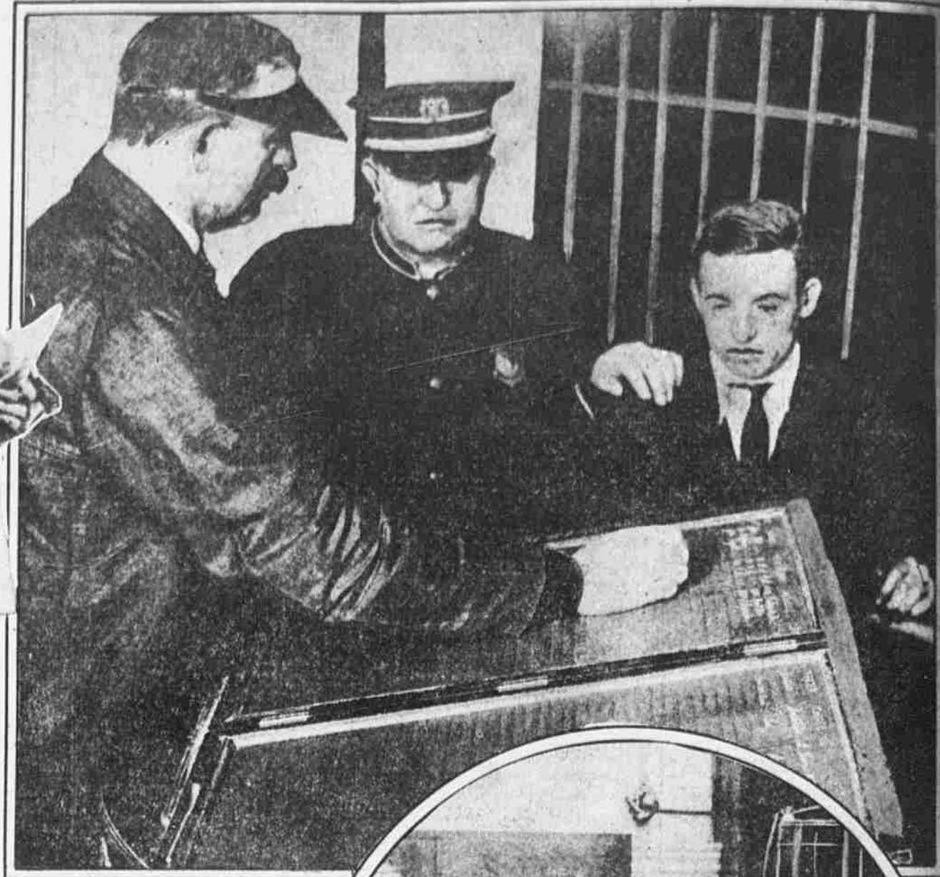
HE IS TAKEN TO THE POLICE STATION, WHERE HIS NAME AND OFFENSE ARE "SLATED"