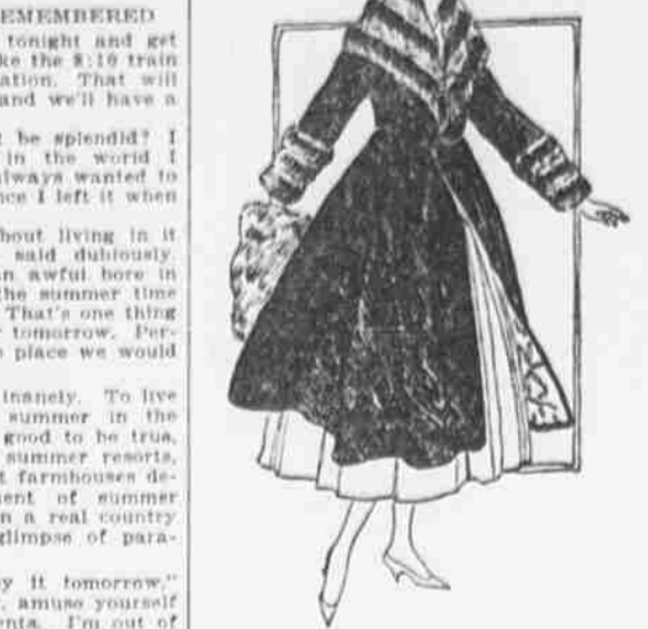
FUR coats are closely following the lines of the modish frocks. The bodices are tightly fitted and the skirts extremely full.

Coat of caracul trimmed with Hudson Bay sable.