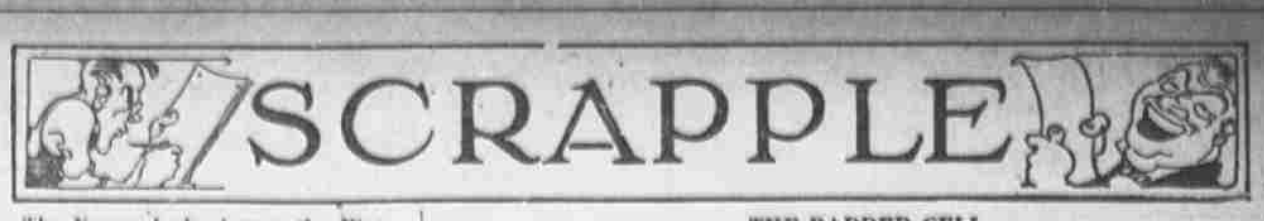
The Young Lady Across the Way THE PADDED CELL