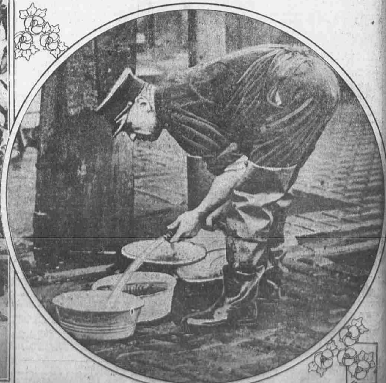
THE UNROMANTIC SIDE OF THE FIREMAN'S LIFE Persons who imagine he just loaf around when he isn't eating smoke should see him at his daily clean-up tasks. He doesn't object to such work, but would welcome a little more material appreciation of it.