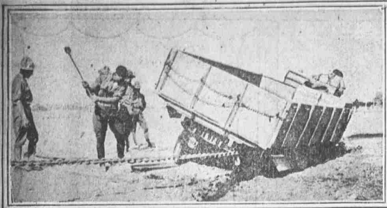
TROUBLES OF A PENNSYLVANIA ARTILLERY REGIMENT The Second Pennsylvania Field Artillery, formerly the Second Infantry, is still laboring with difficulties, animate and inanimate, down at Fort Bliss. Here they are digging a truck out of a sand bank thrown up by the storm of election day.