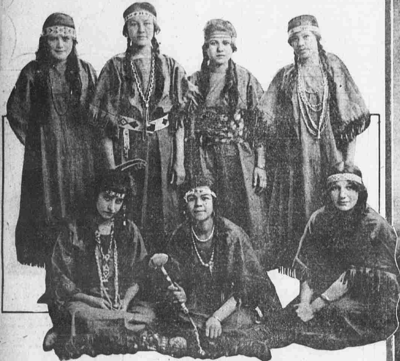
INDIAN MAIDENS ENACT "THE FEAST OF THE RED CORN" Girl students of the Carlisle School last week gave their own operetta, founded on an old tribal legend and filled with the strains of the oldest American music. They are Chippewa, Choctaw, Cherokee and Seneca girls.