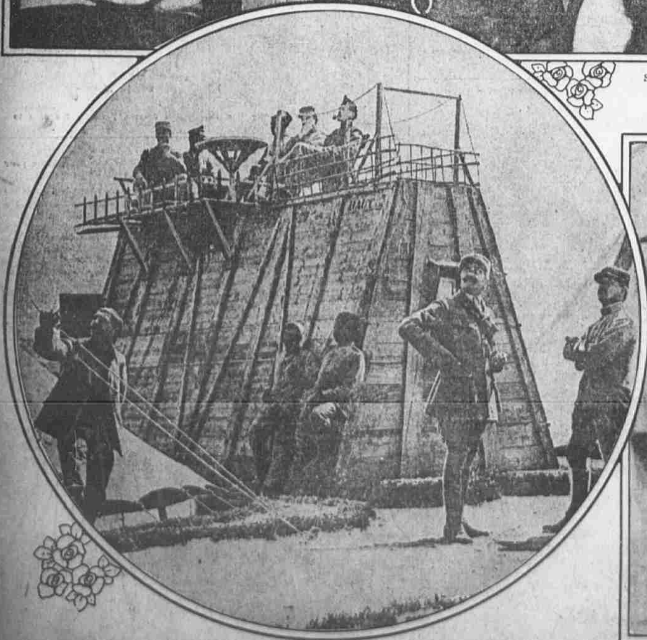
DRY GOODS BOX AS A WAR OFFICE A French officer on the Macedonian front has comfortably installed himself in this packing case, which he also uses as an observation post.