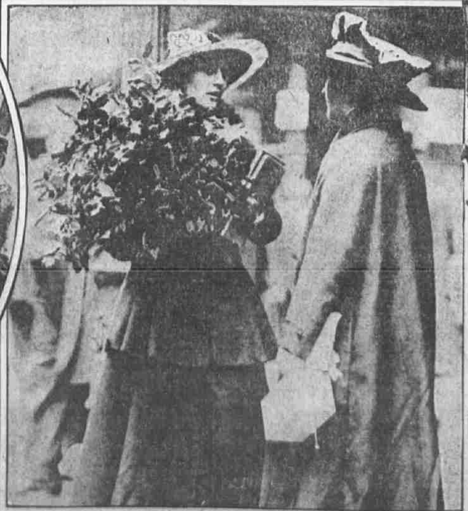
FIRST HOLLY OF THE SEASON Though Christmas is three weeks off, the holly cuttings have made their appearance on the street stands.