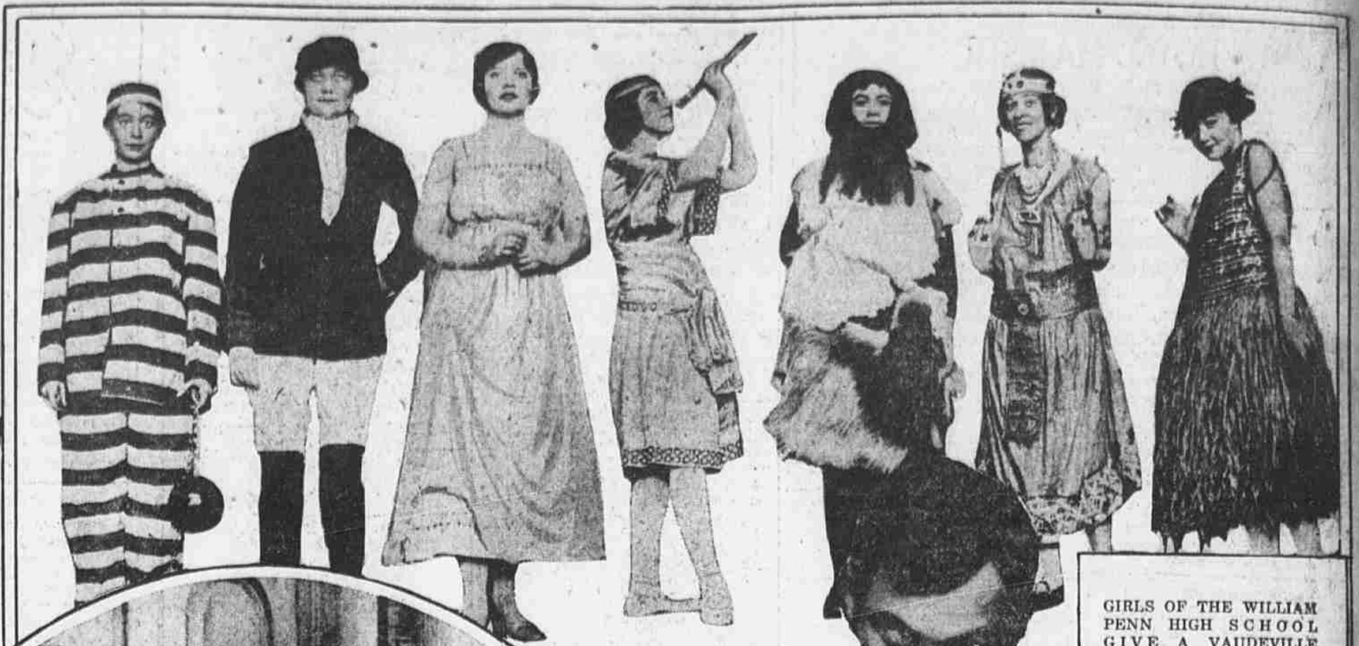
GIRLS OF THE WILLIAM PENN HIGH SCHOOL GIVE A VAUDEVILLE SHOW FOR ALUMNAE FUND.