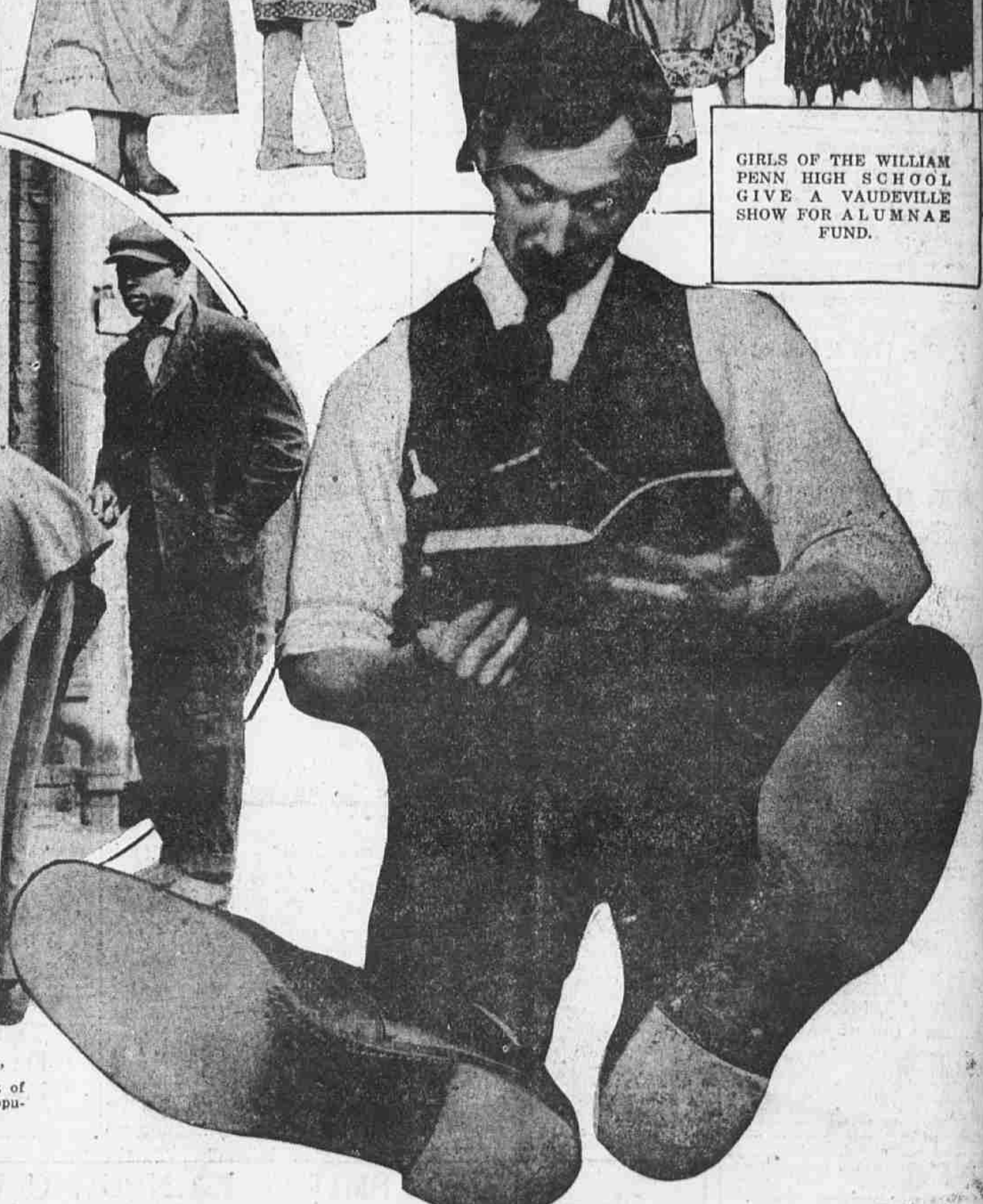
SISTER SUSIE TAKES PAPA'S PICTURE. An illustration of what happens when 'the amateur photographer' wants to make something unusually fine.