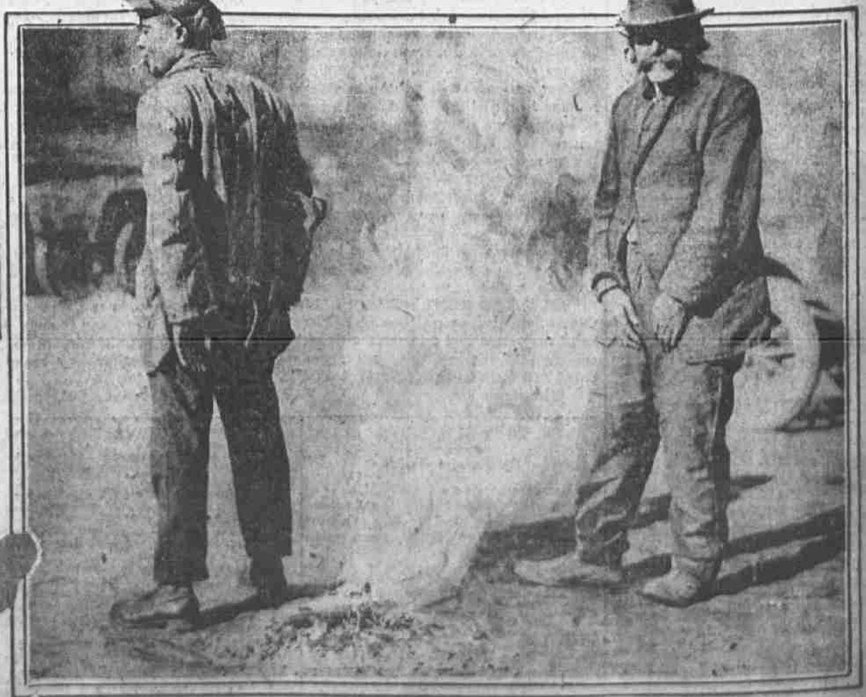
WINTER IS UPON US Consequently a few warm coats never go unappreciated, especially when one's clothes are gone too solid in texture.