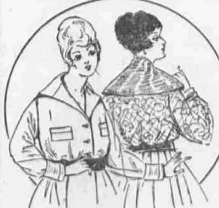
At $2, value $3.50 At $3.95, value $7.90

—Gimbels, Salons of Dress, Third floor, and some on Grand Aisle, First floor.