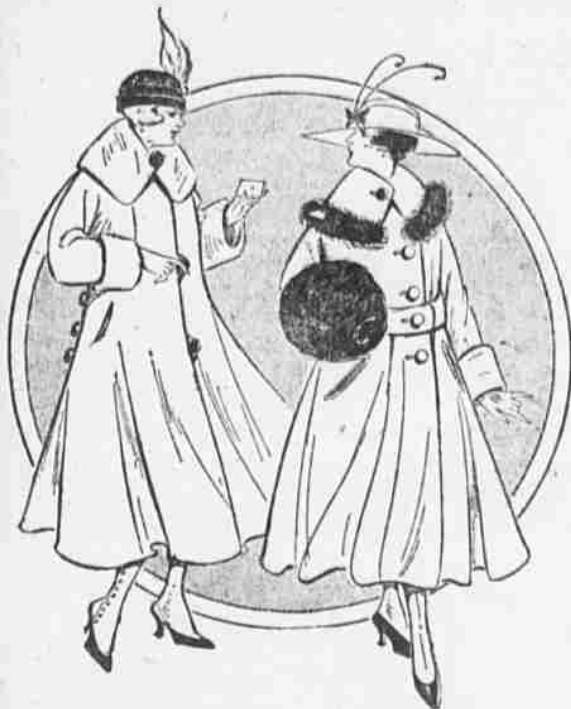
At $25; Value $35 At $16.75; Value $25

—Gimbels, The Thoroughfare, First floor.