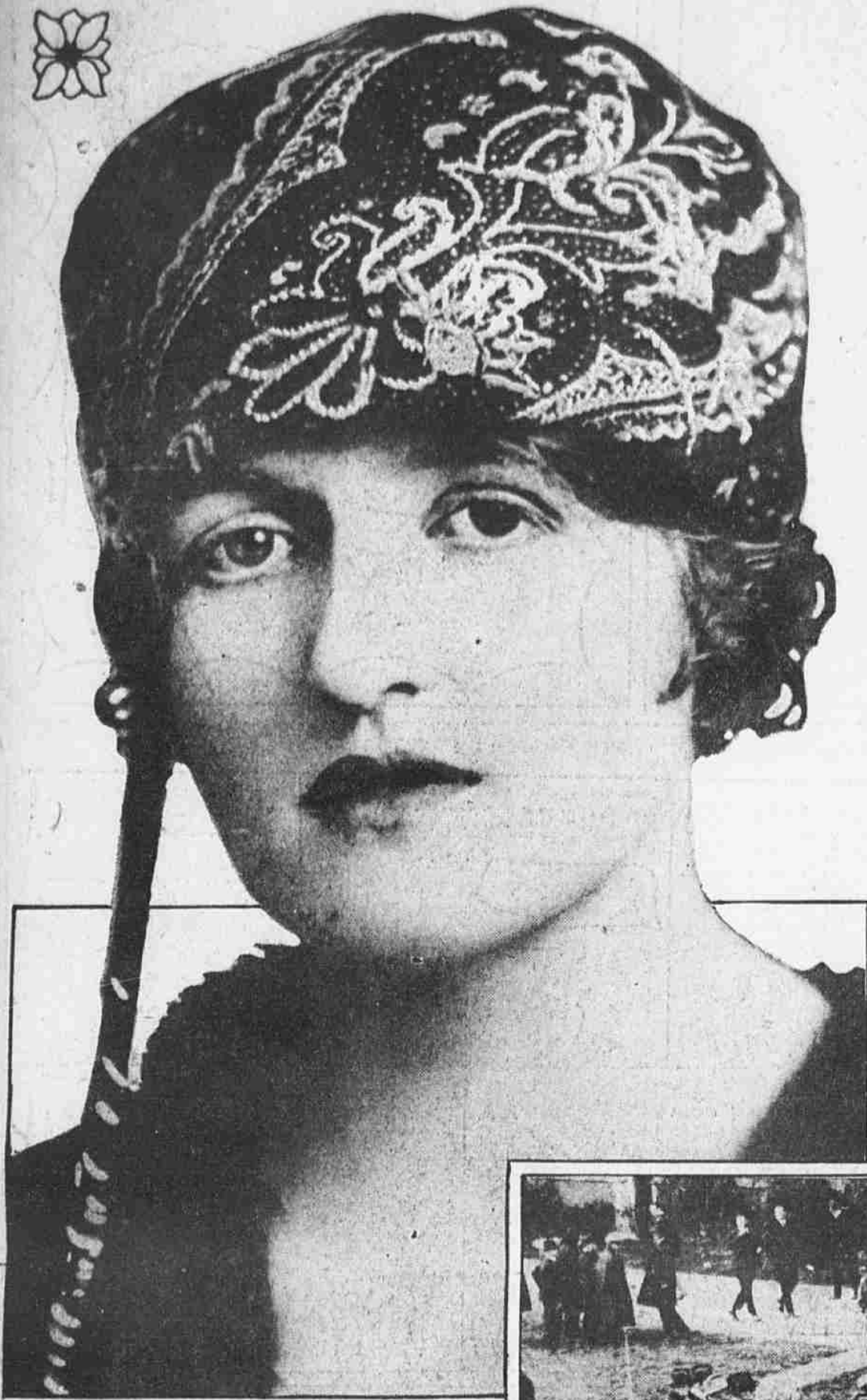
THE PAISLEY FAD SPREADS TO HATS A development in fall fashions has been a revival of the Paisley shawl, as worn by our grandmothers. Here is a tight-fitting cap, in which the scroll-like weave is used with striking effect.