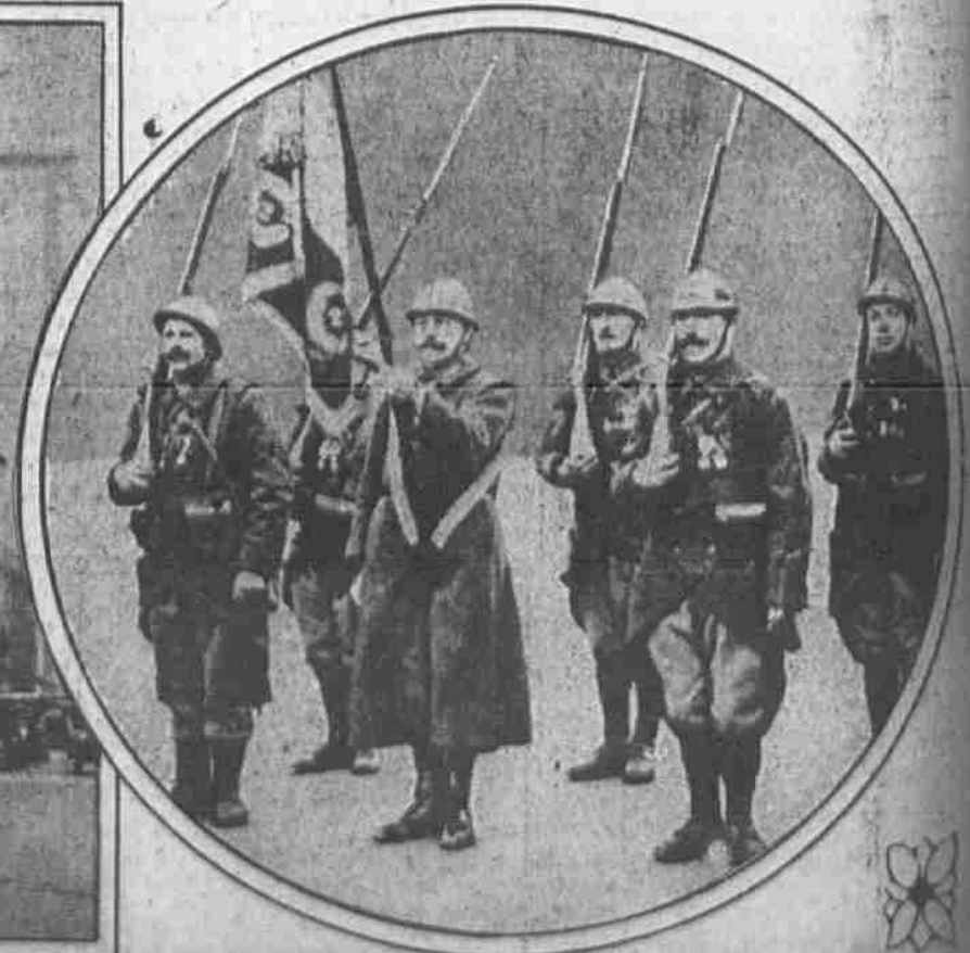
GUARD OF THE FAMOUS FRENCH FOREIGN LEGION, TO WHICH MANY AMERICANS BELONG