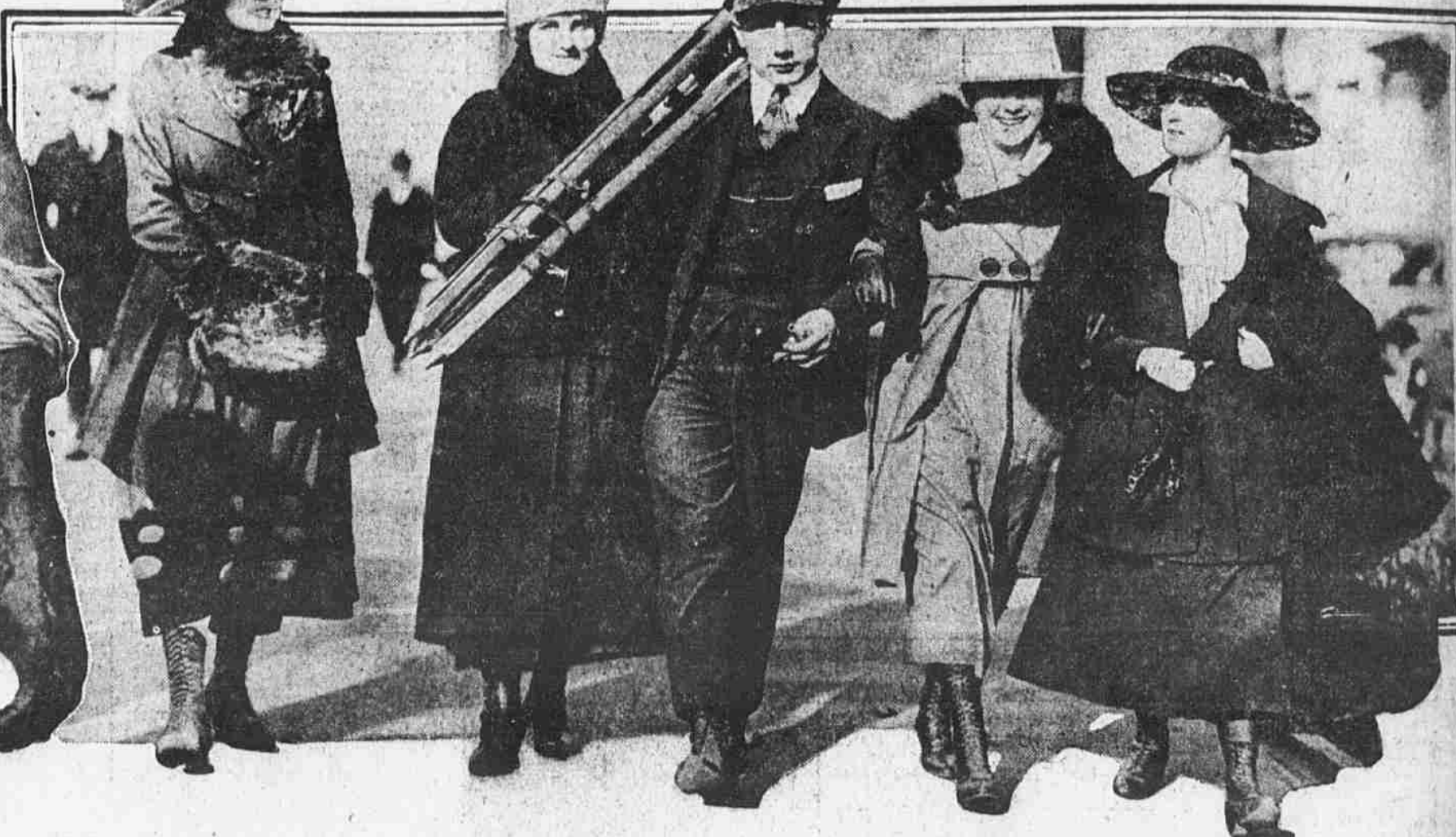
FILMING THE ALL-PHILADELPHIA PHOToplay IS FUN, BOTH FOR CAST AND CAMERAMAN Here are fair members of the cast of "Phil and Delphine" accompanying the movie cameraman about as he reels off the EVENING LEDGER's prize production.