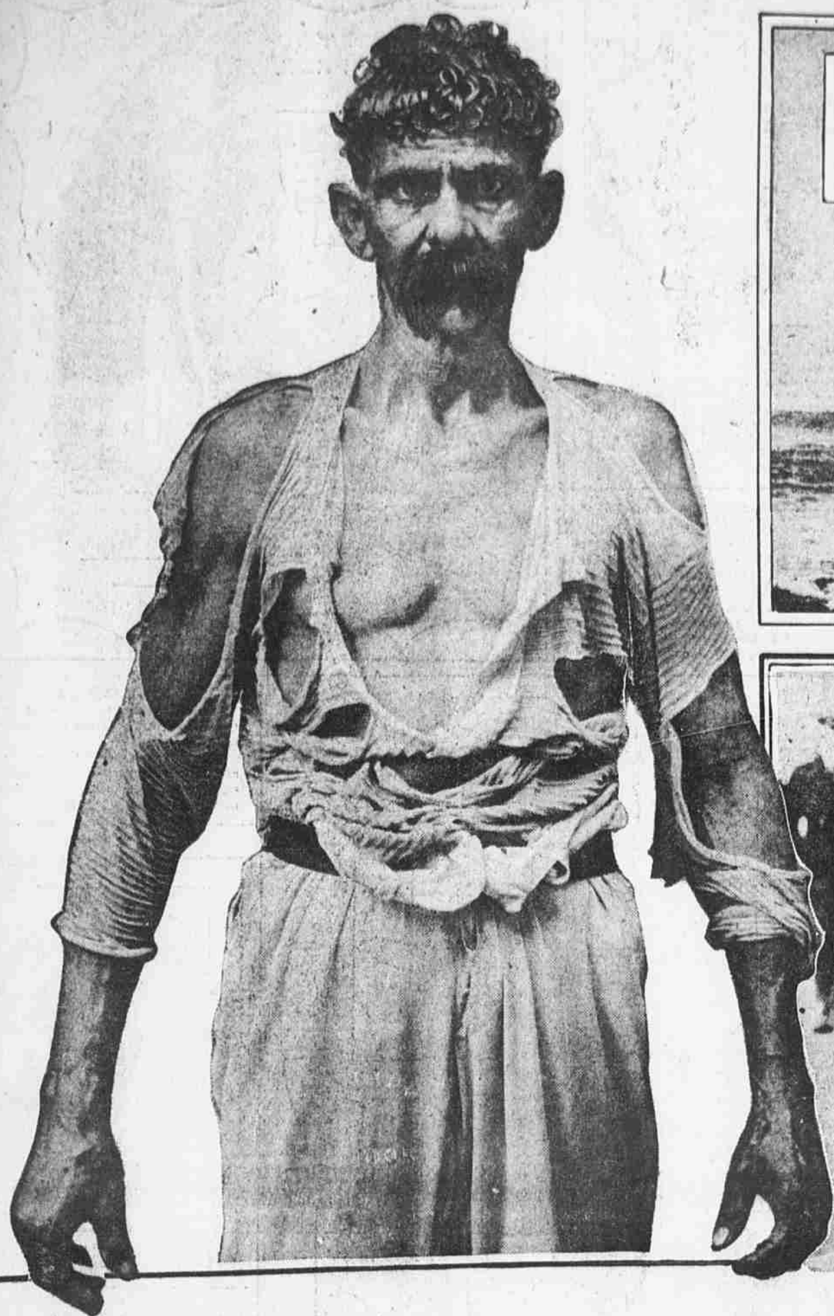
UNKNOWN HERO OF THE CRUISER MEMPHIS'S WRECK Survivors of the disaster of August 29, who reached here on the Prairie yesterday, brought this picture from San Domingo. He saved five American sailors, but in the excitement no one got his name.