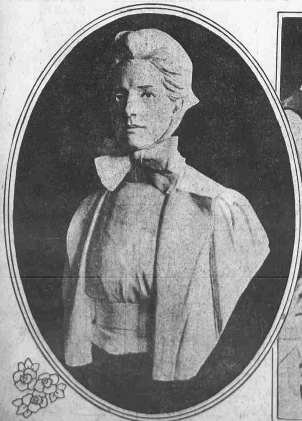
BUST IN THE EDITH CAVELL HOSPITAL IN PARIS This is said to be an excellent likeness of the English nurse who fell before a German firing squad. The hospital trains nurses for the various war fronts.