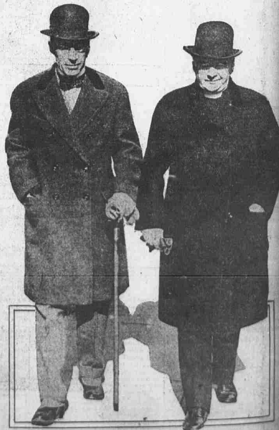
HELPING TO RAISE THE EPISCOPAL CHURCH'S $1,000,000 RETIREMENT FUND