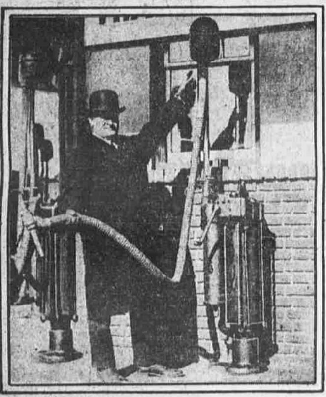
GETTING ALL THE "GAS" DUE YOU The better sort of pumps automatically drain the hose after each filling.