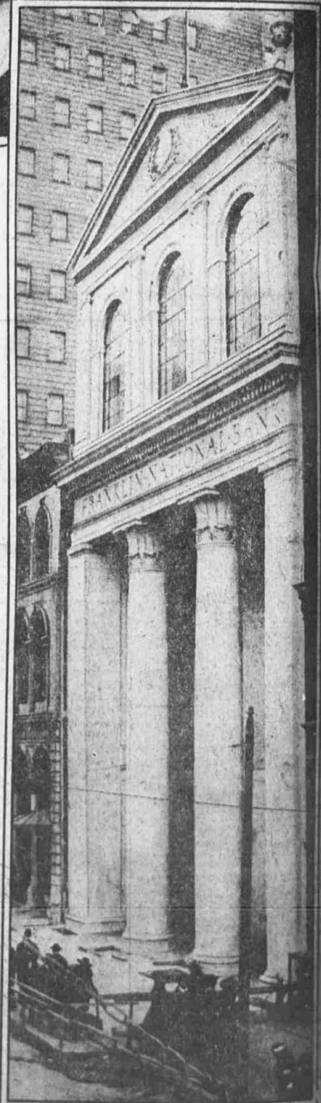
THE NEW FRANKLIN BANK BUILDING Its looming columns impart a new aspect to the south side of Chestnut street west of Broad.