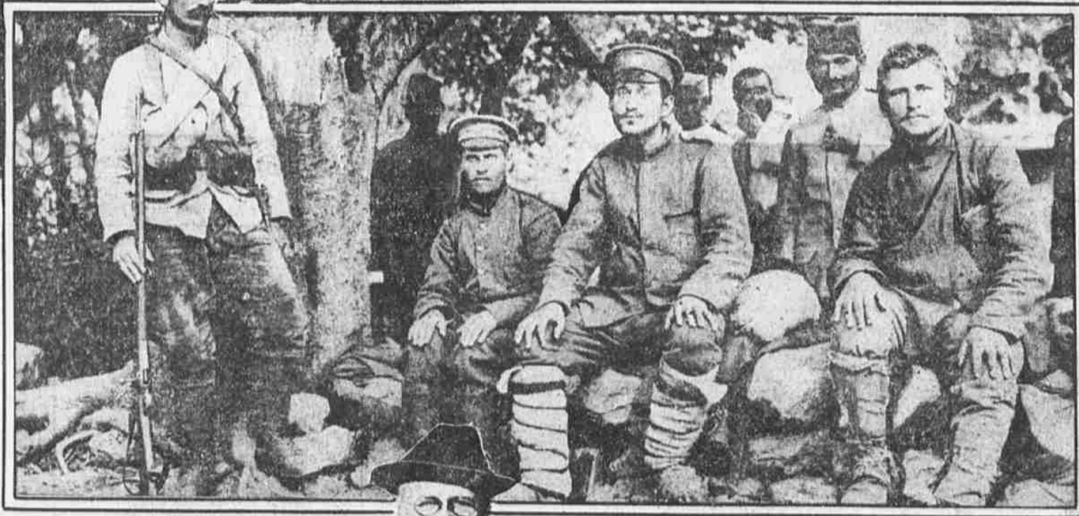
WAR IS A WEARING OCCUPATION Here are some Bulgarian soldiers, glad to rest after their capture by Serbs. They are wearing the tape-wound leggings characteristic of the Bulgar fighting man.