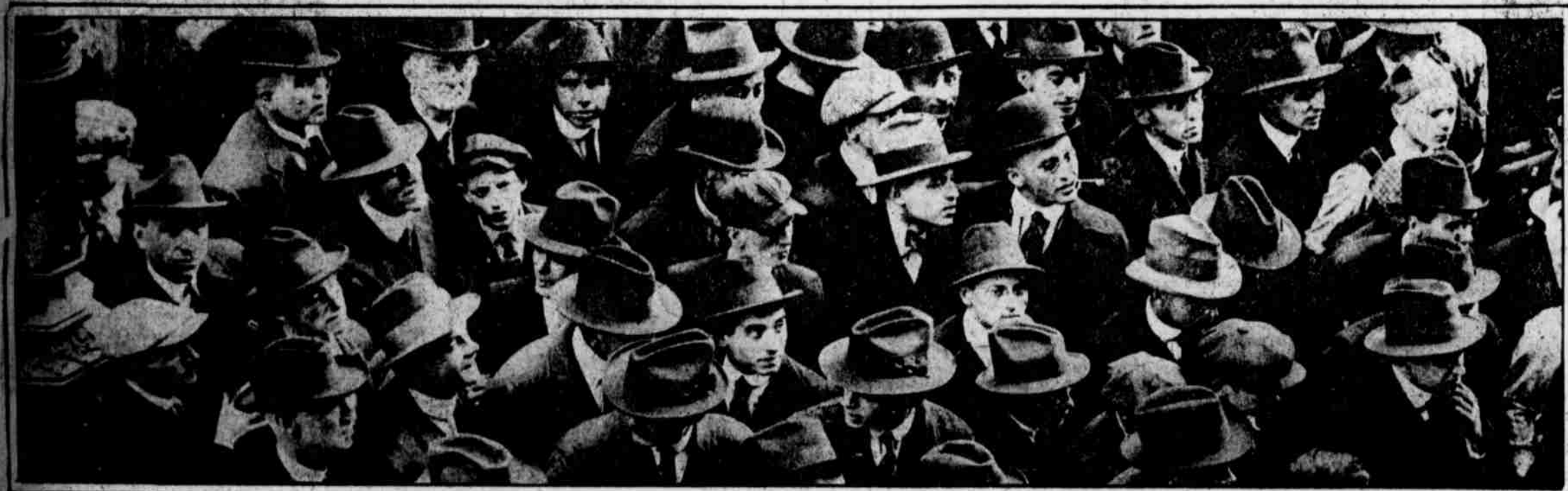
A STUDY IN BULLETIN-BOARD EXPRESSIONS AS THE DAY PASSED IN DOUBT.