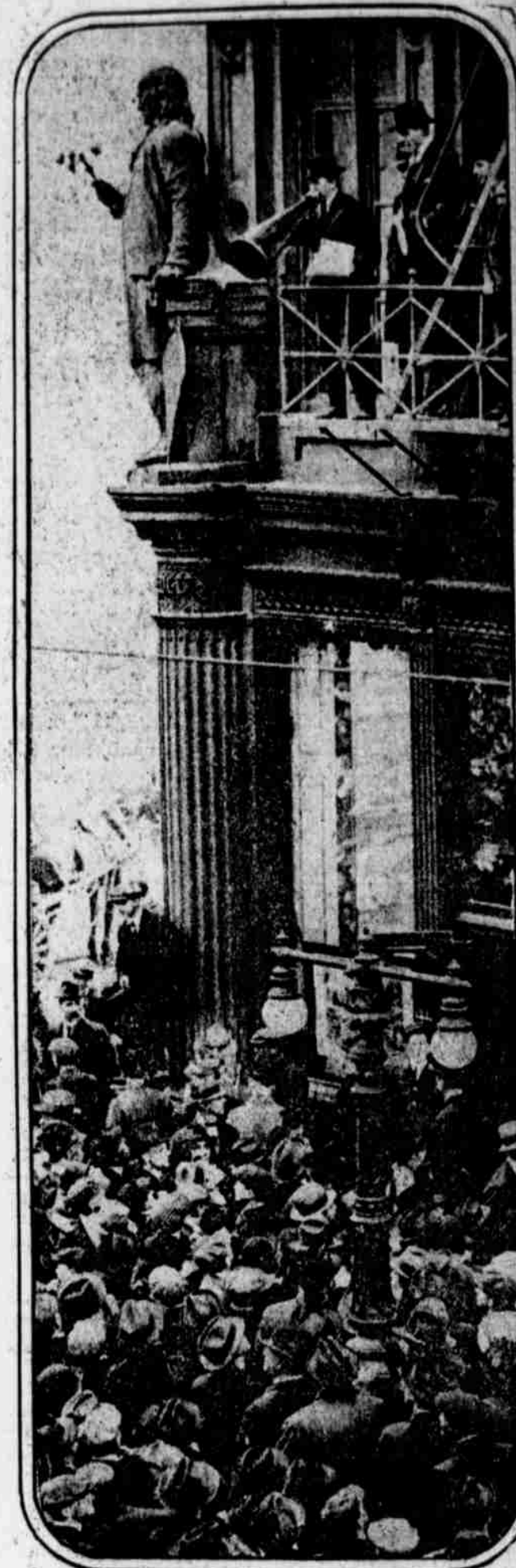
THOUSANDS STOOD FOR HOURS TO HEAR EVENING LEDGER BULLETINS MEGAPHONED.