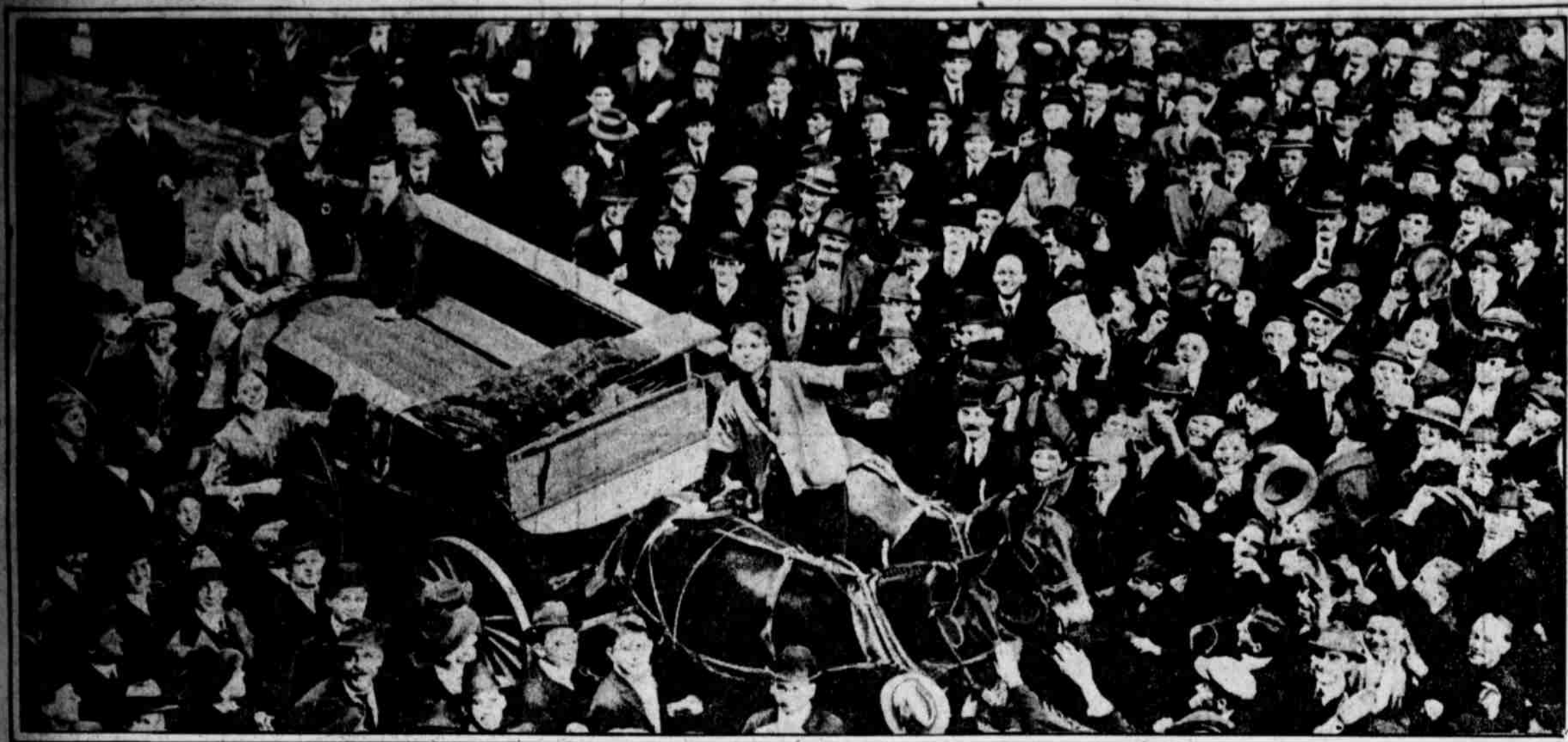
"THESE ARE DEMOCRATIC DONKEYS," ANNOUNCED THE DRIVER AS HE DROVE THROUGH THE CROWD.

EAGER CROWDS AWAITED NEWS ON ONE OF MOST EXTRAORDINARY OF AFTER-ELECTION DAYS