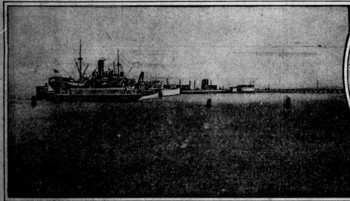
PREPARING FOR "NEXT SPRING'S DRIVE" ON THE DELAWARE A juicy morsel for any submarine would be this British powder ship, shown here taking on cargo at the du Pont pier at Carney's Point.