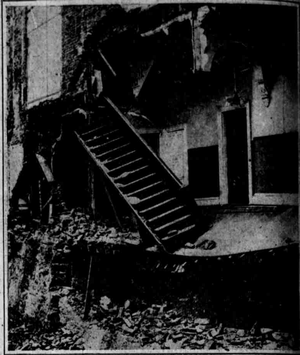
SLICE OF WALL FALLS OFF HOUSE Eight men, working on an adjoining building foundation at Broad street and Girard avenue, narrowly missed being buried today when the wall collapsed.