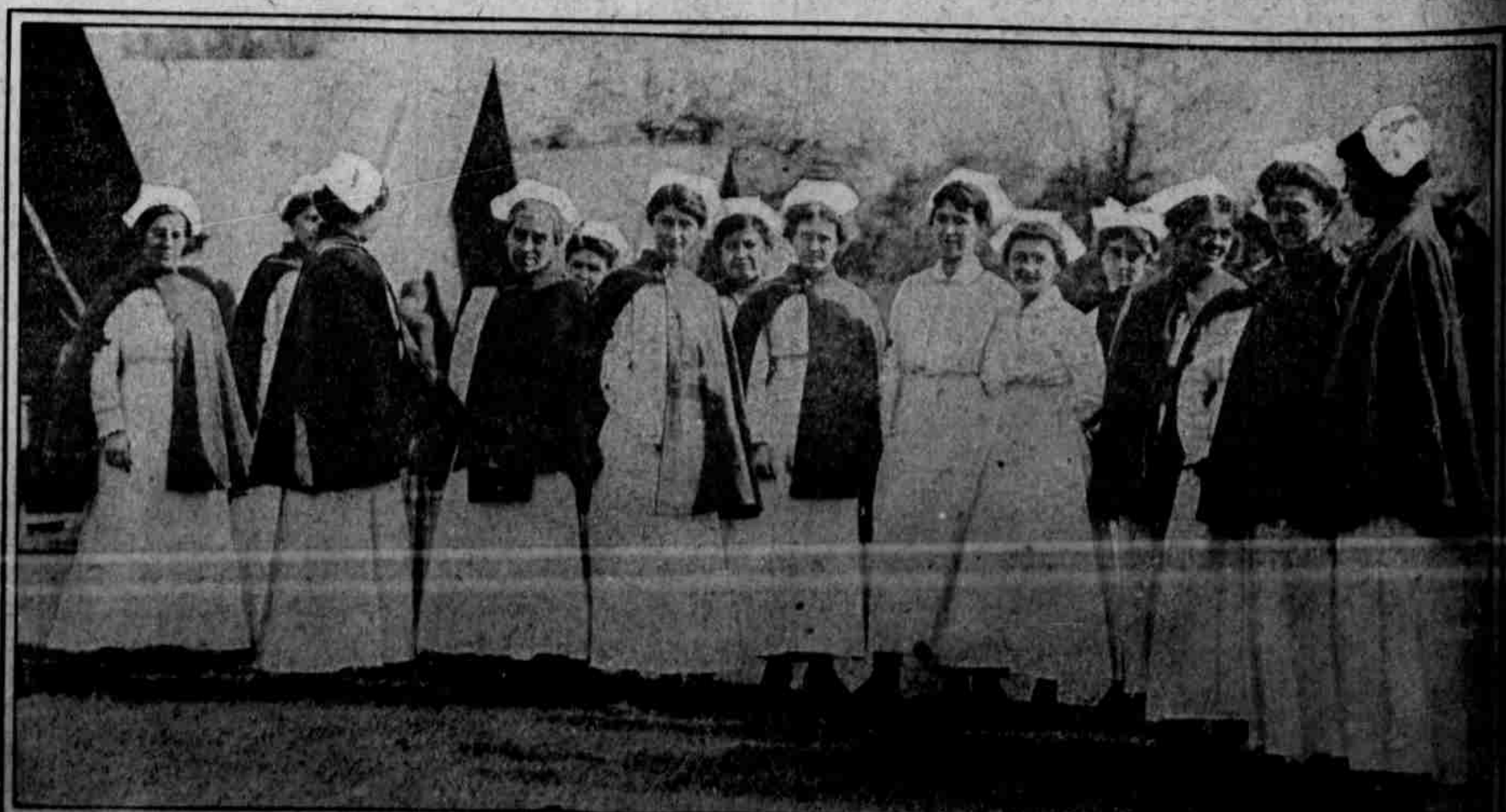
NURSES GATHER TO ATTEND BASE-HOSPITAL MOBILIZATION The first base-hospital in this country is monopolizing the attention of army officers and physicians at Fairmount Park today. This is just one of the corps of nurses who, with army surgeons, are performing upon imaginary soldiers brought by imaginary ambulances constantly traveling from the hospital base to an imaginary battlefield and back again.