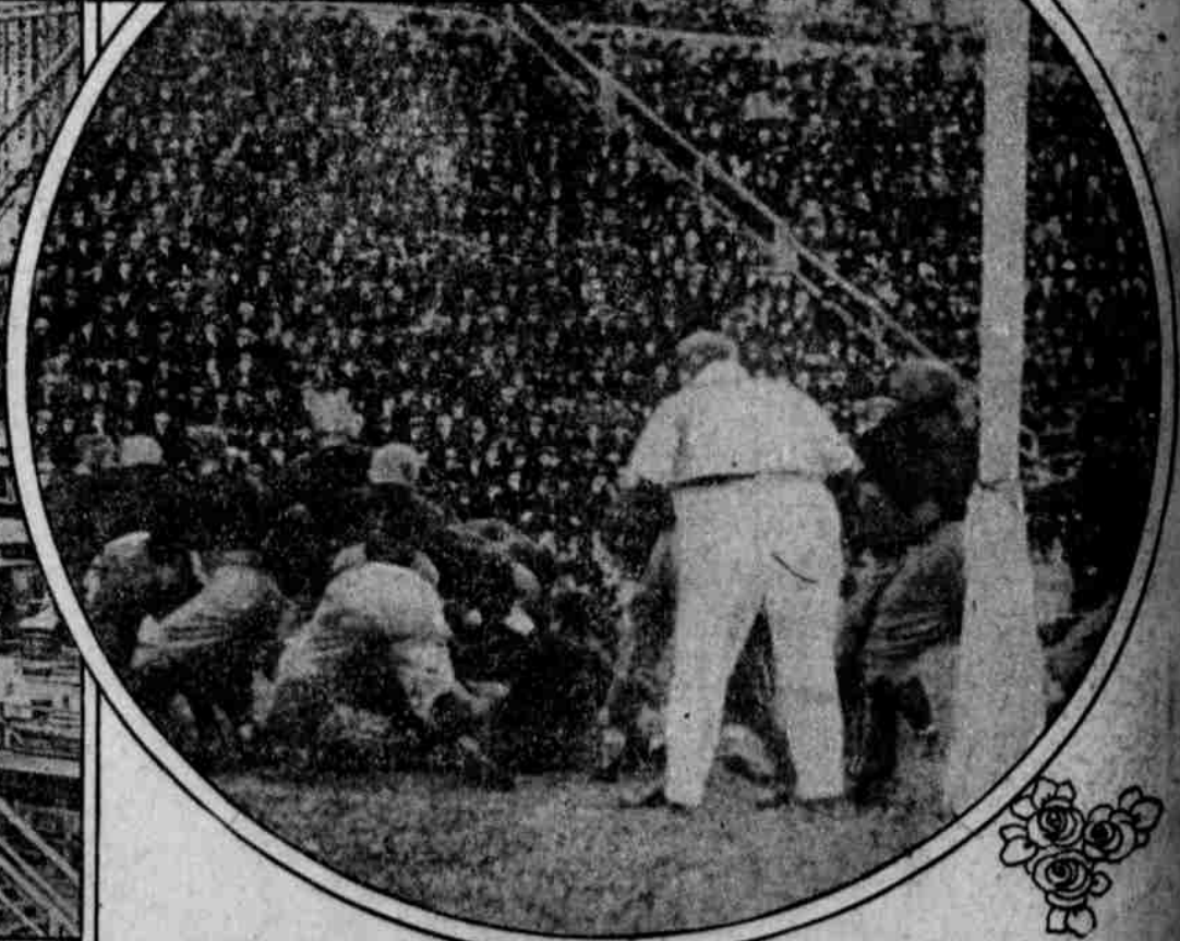
WEIGHT AND SCIENCE SCORED THIS TOUCHDOWN The University of Pittsburgh football team plowed through Syracuse last week for an easy victory. The photograph shows Pitt scoring a touchdown. Note the fine interference of the Pittsburghers.