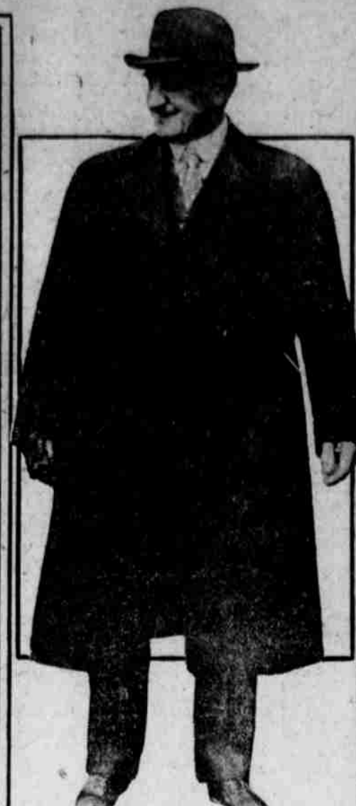
DR. C. H. MAYO One of America's foremost surgeons, attending the convention in this city, was "snapped" unawares by a staff photographer.