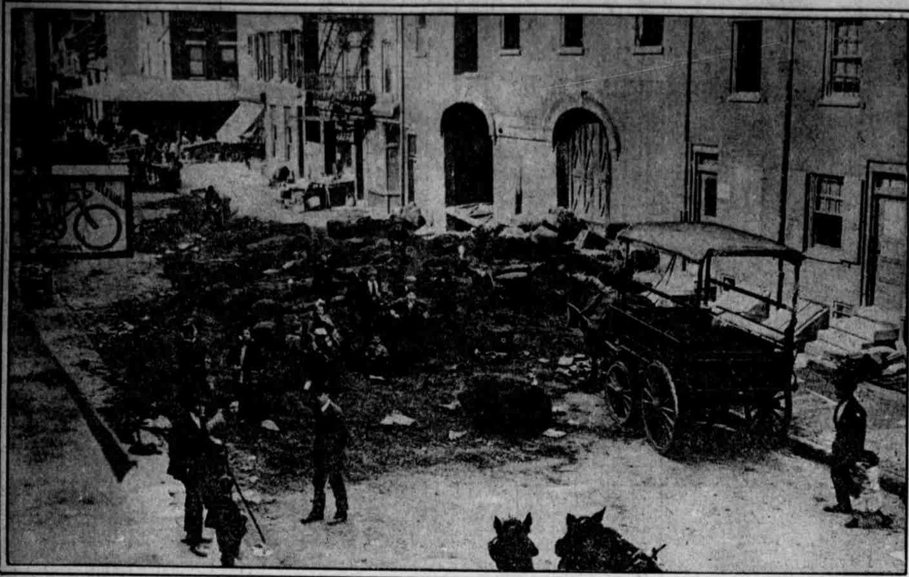
FOUL HAY RESCUED FROM FIRE A MONTH AGO ROTS IN STREET The remains of 800 bales of hay, rescued from a fire in a livery stable, make the block on Fitzwater street between Third and Fourth streets smell worse than a barnyard. The entire block is littered with the half-burned, water-soaked, rotting remains thrown there on September 26.