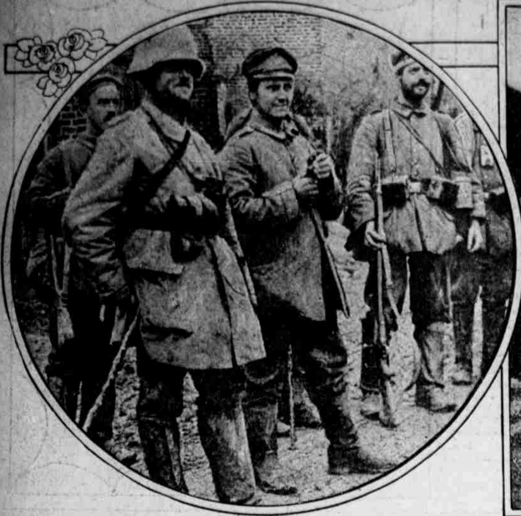
GERMANS DON NEW STYLE OF HELMET The Germans on the Somme have been forced to follow the example of the other belligerents in adopting a headpiece to guard against shrapnel.