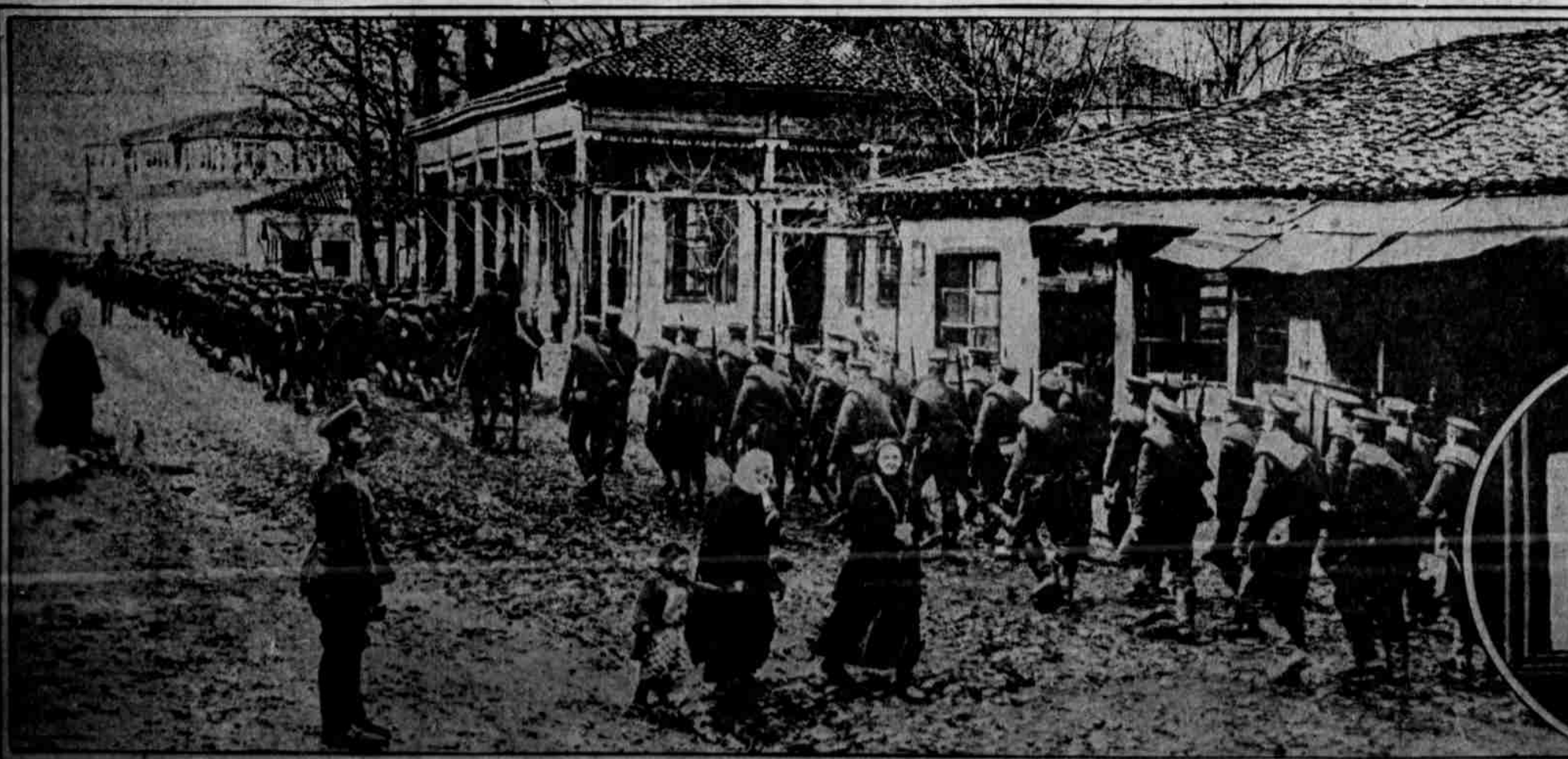
BULGARIAN ARMY HAS BEEN NEWLY EQUIPPED AND OUTFITTED Since the armies of Czar Ferdinand have come under the direction of the Germans, they have discarded the woolen-wrapped leggings and padded moccasins which formerly were a distinguishing feature.