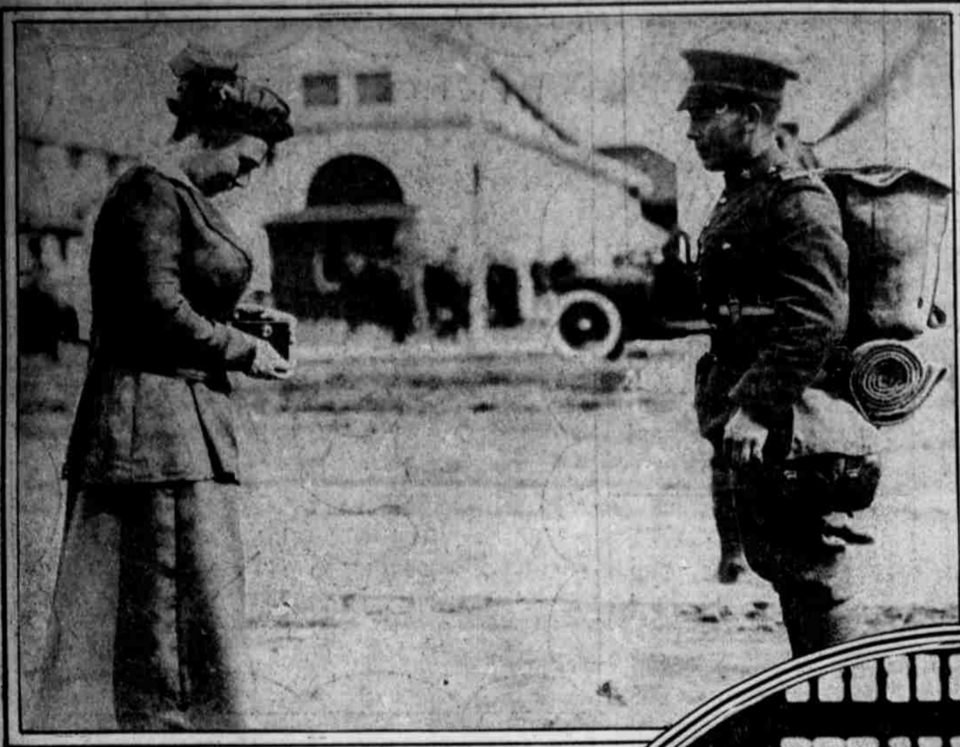
CANADA'S "BANTAM" REGIMENT OF LITTLE FELLOWS STARTS FOR FRANCE