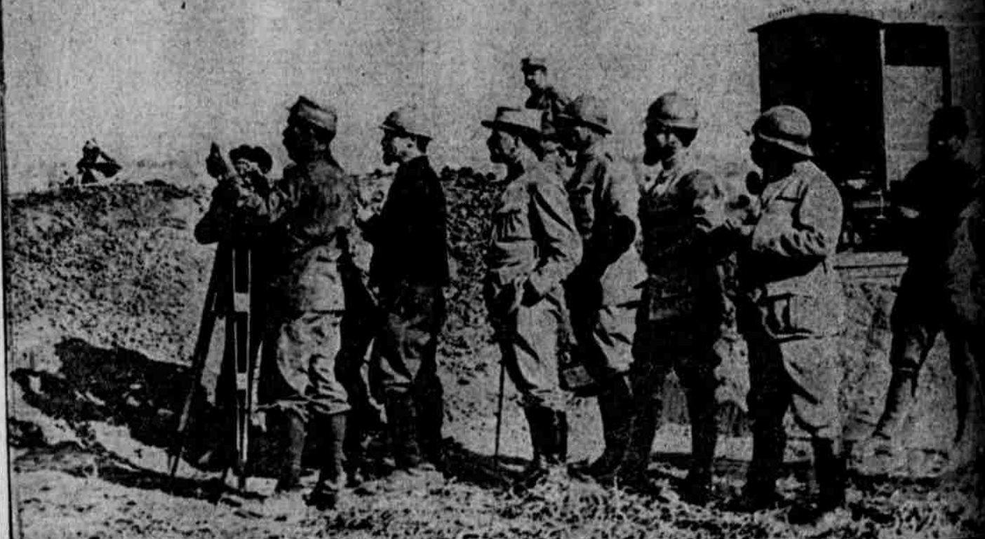
FRENCH AEROLOGICAL CORPS AT WORK

Engineers connected with a 320-mm. battery along the Somme are sending up a small balloon to gauge the direction and velocity of the wind.