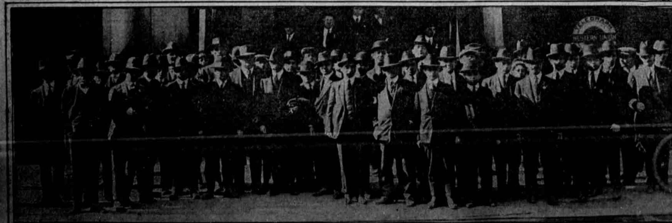
DELEGATES FROM ENTIRE COUNTRY MEET IN IMPORTANT CONVENTION OF GARMENT MAKERS The thirteenth biennial convention of the International Ladies' Garment Workers' Union is now in session at Scottish Rite Hall, Broad and Race streets. This is one of the strongest organized unions and has won several important victories for the workers. The strikes in New York and this city during the early part of the year were the most important.

Engineers connected with a 320-mm. battery along the Somme are sending up a small balloon to gauge the direction and velocity of the wind.