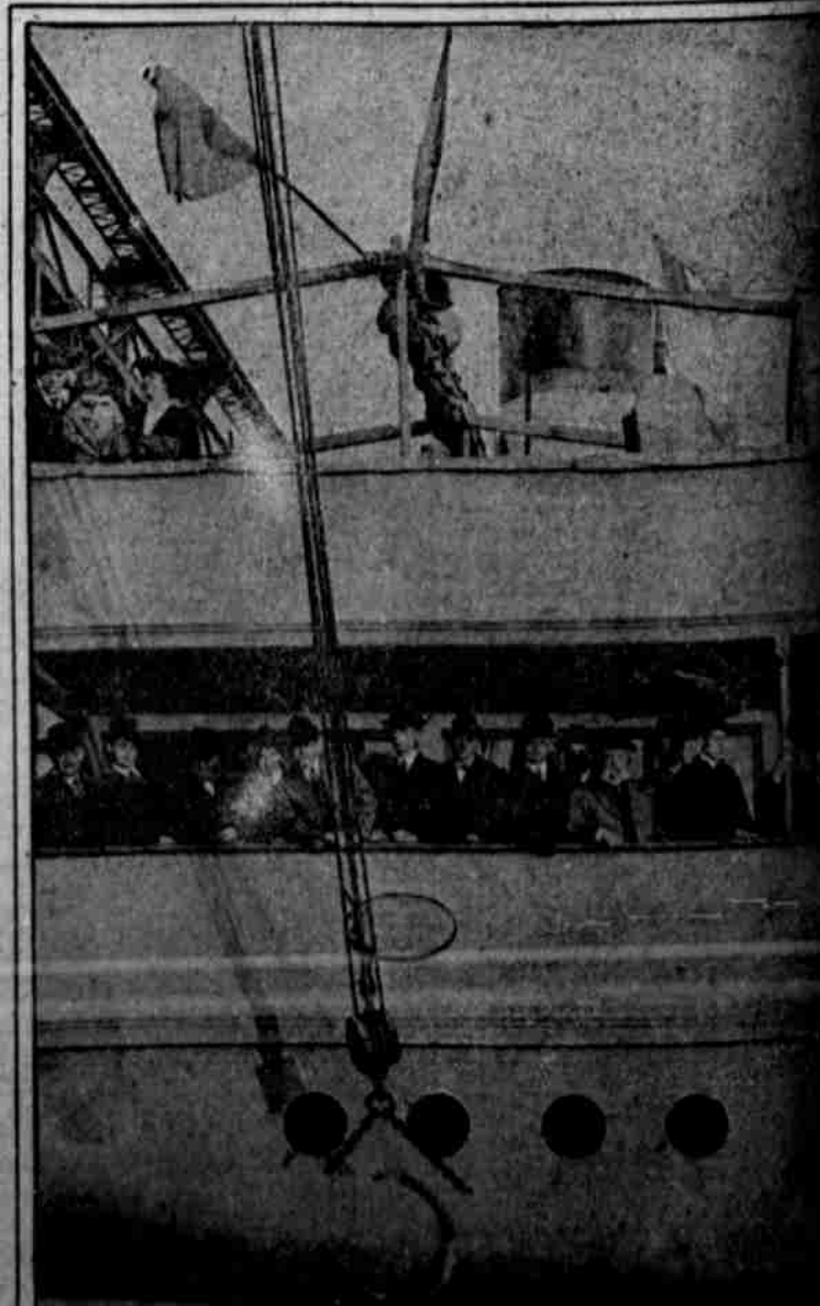
TRADE OPENS BETWEEN PHILADELPHIA AND LATIN AMERICA City officials and others prominent in commercial circles watch steamship Carlyn's start for South America.