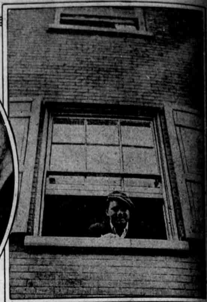
THIS VOTER IS NO PHANTOM. SECURE IN HIS PHYSICAL WELL-BEING, HE SMILES, CYNICALLY, UPON THE QUESTIONING POLICEMEN FROM HIS THIRD-STORY WINDOW.