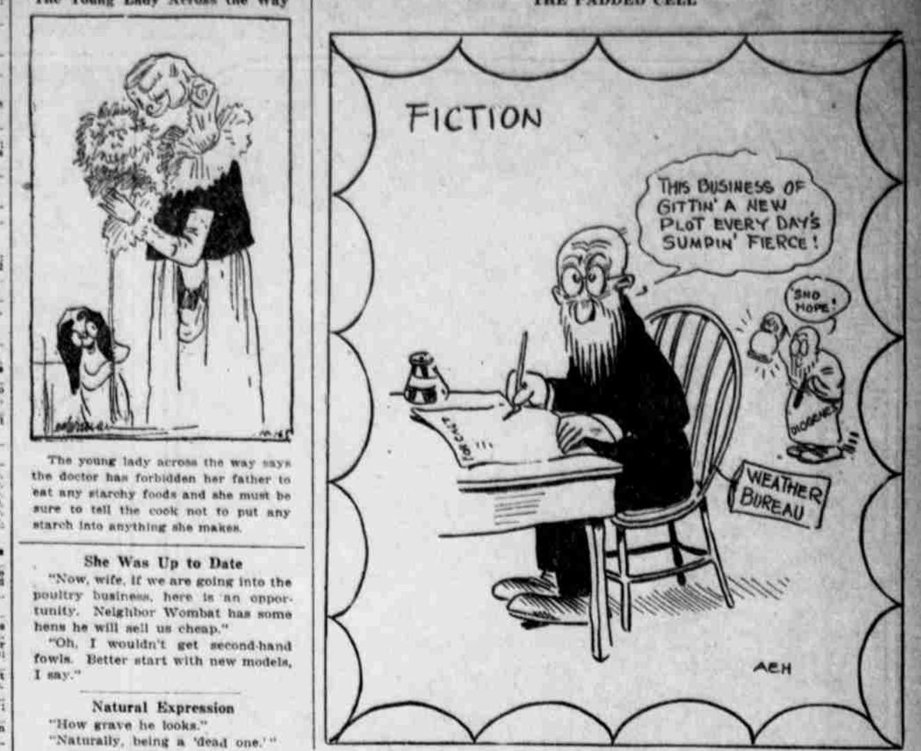
The young lady across the way says the doctor has forbidden her father to eat any starchy foods...