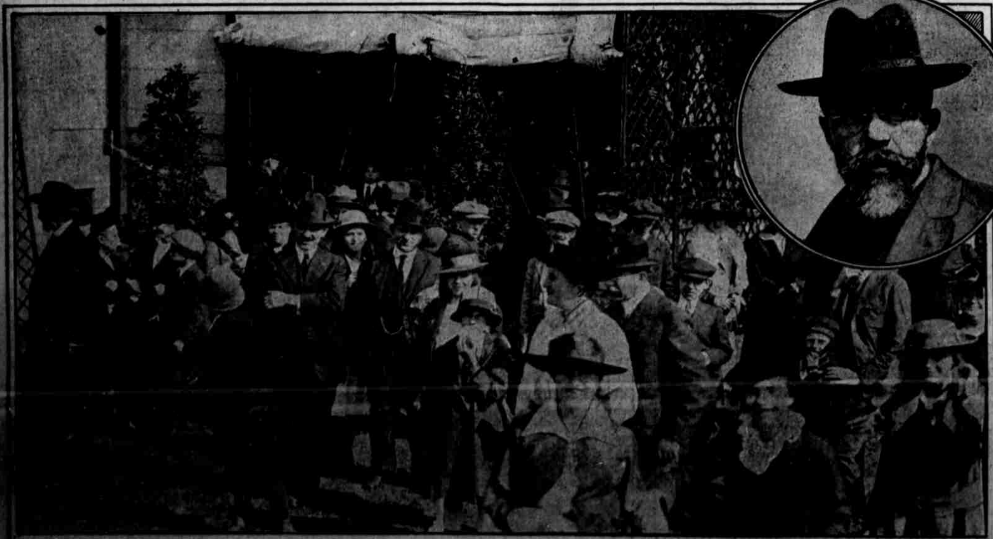
JEWES OF PHILADELPHIA CELEBRATE SUCCOTH, "THE FEAST OF BOOTHS" The photograph shows only one of the many vine-covered, fruit-filled booths to be found in the yards of the orthodox synagogues during the feast. The photograph was taken at Mickve Israel Synagogue, Broad and York streets. The insert shows Rabbi Eldenah, head of the congregation.