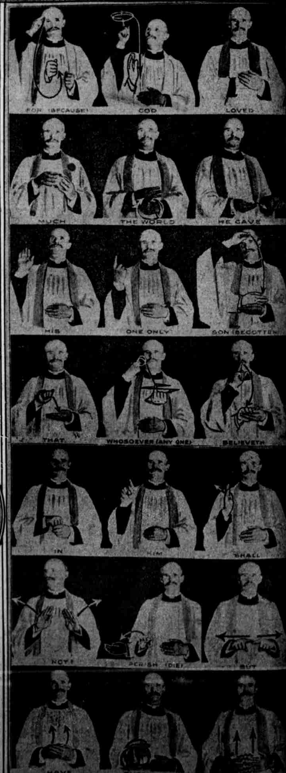
ILLUSTRATING A QUESTION WHICH MAY COME BEFORE EPISCOPAL CONVENTION A problem which may be discussed by the forty-fourth triennial in St. Louis is the ordination of deaf mutes, which is opposed by some churchmen. This series of pictures shows a test communicated by a clergyman in sign language.