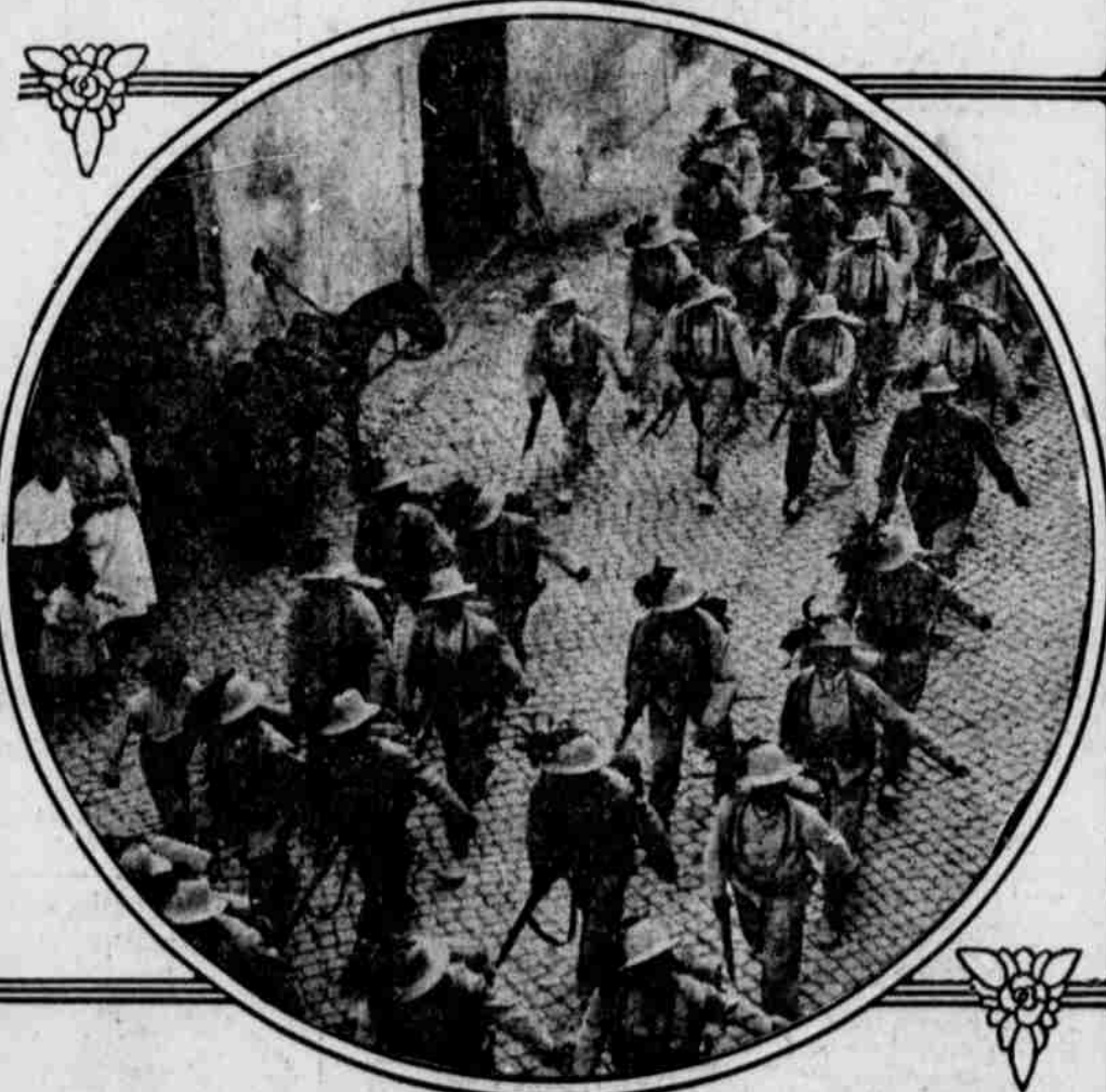
ITALY'S "FOOT CAVALRY" ENTERING CAPTURED CITY The Bersaglieri are playing a prominent part in Italy's present advance. They are seen taking possession of a captured Austrian town.