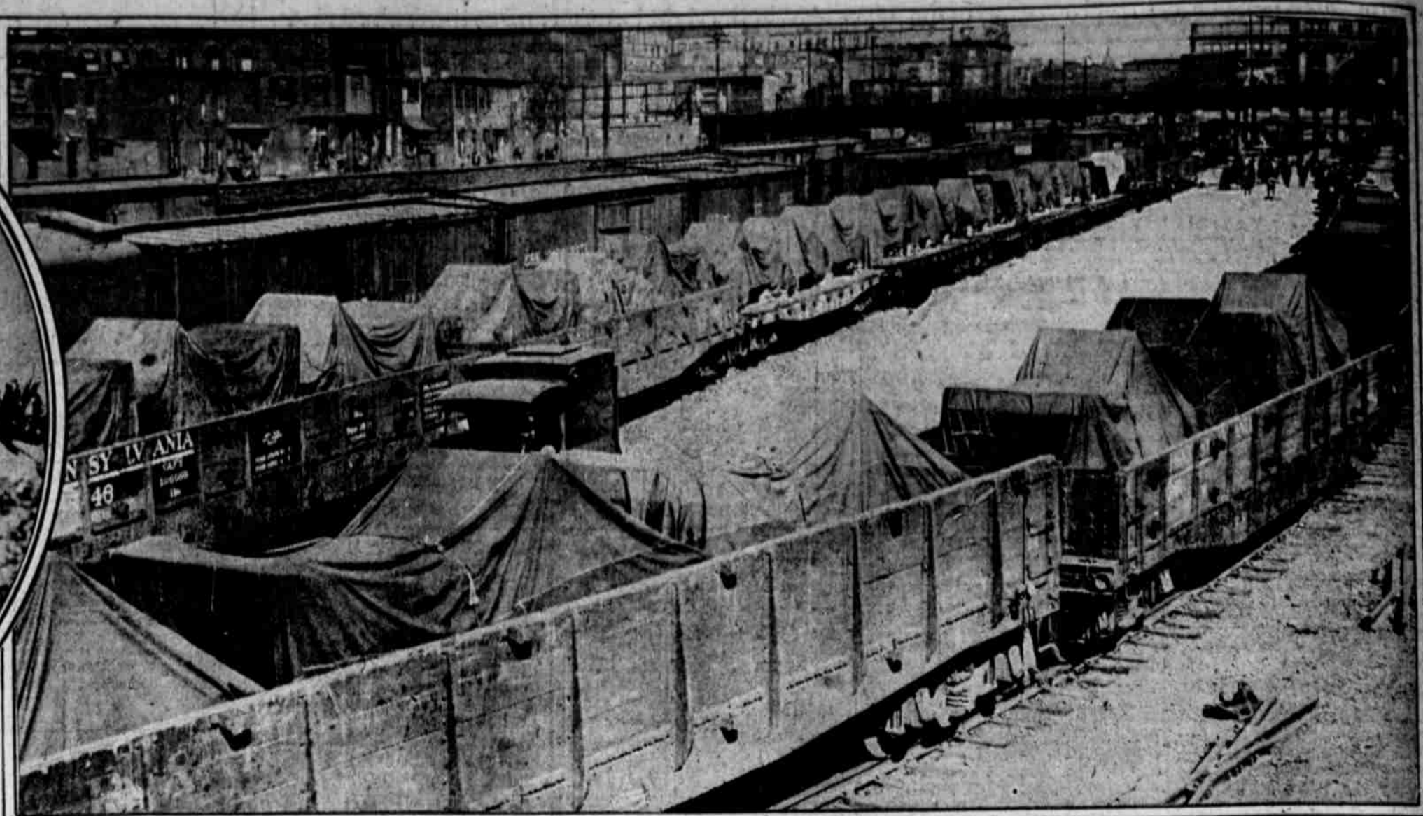
TWO TRAINLOADS SHOW THAT PHILADELPHIA IS STILL BUYING AUTOMOBILES Ninety flat cars, loaded with Buick automobiles from the Flint, Mich., factories, have arrived at the Thirty-third and Walnut streets yards of the Pennsylvania Railroad. The procession from the yards to the Buick garage gave the appearance of an automobile invasion of the city.