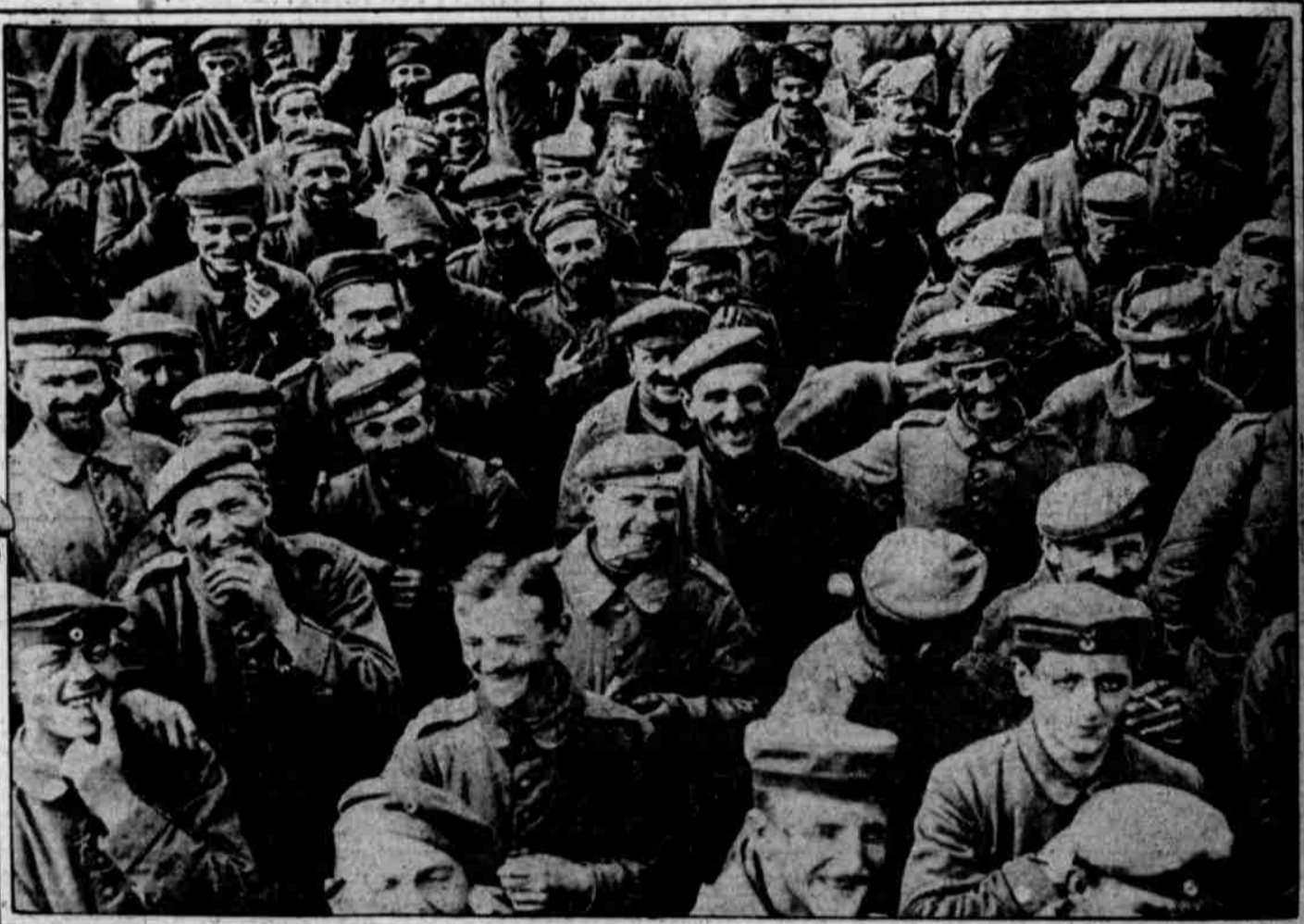
WHO WOULDN'T SMILE AFTER BEING FREED FROM TRENCHES! German soldiers captured at Ginchy were as happy as a crowd of school children, according to reports. The photograph would seem to prove the statements correct.