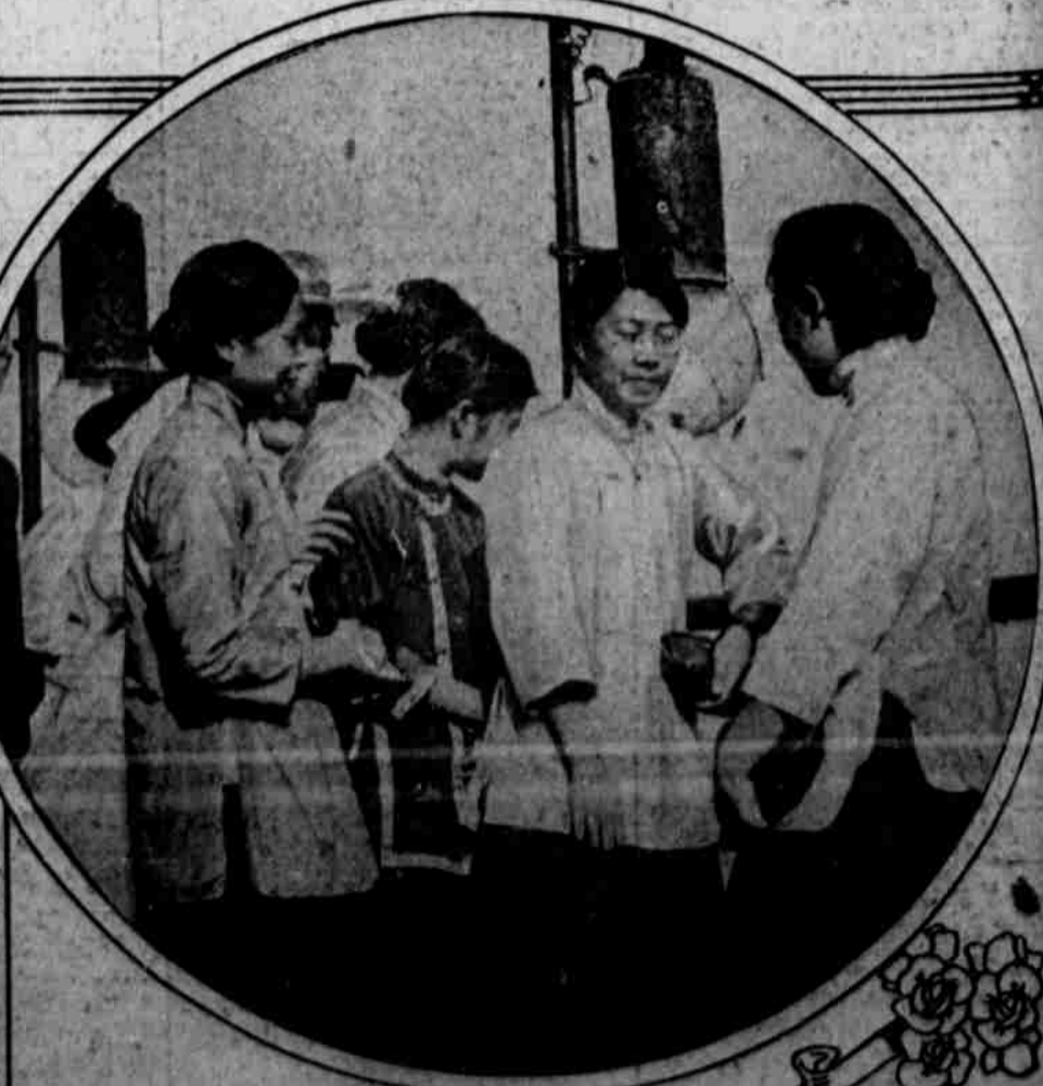
CHINESE WOMEN AS WILLIAM PENN'S GUESTS Seven women, recently arrived for a tour of this country, were taken to the top of the City Hall tower, where they viewed the city.