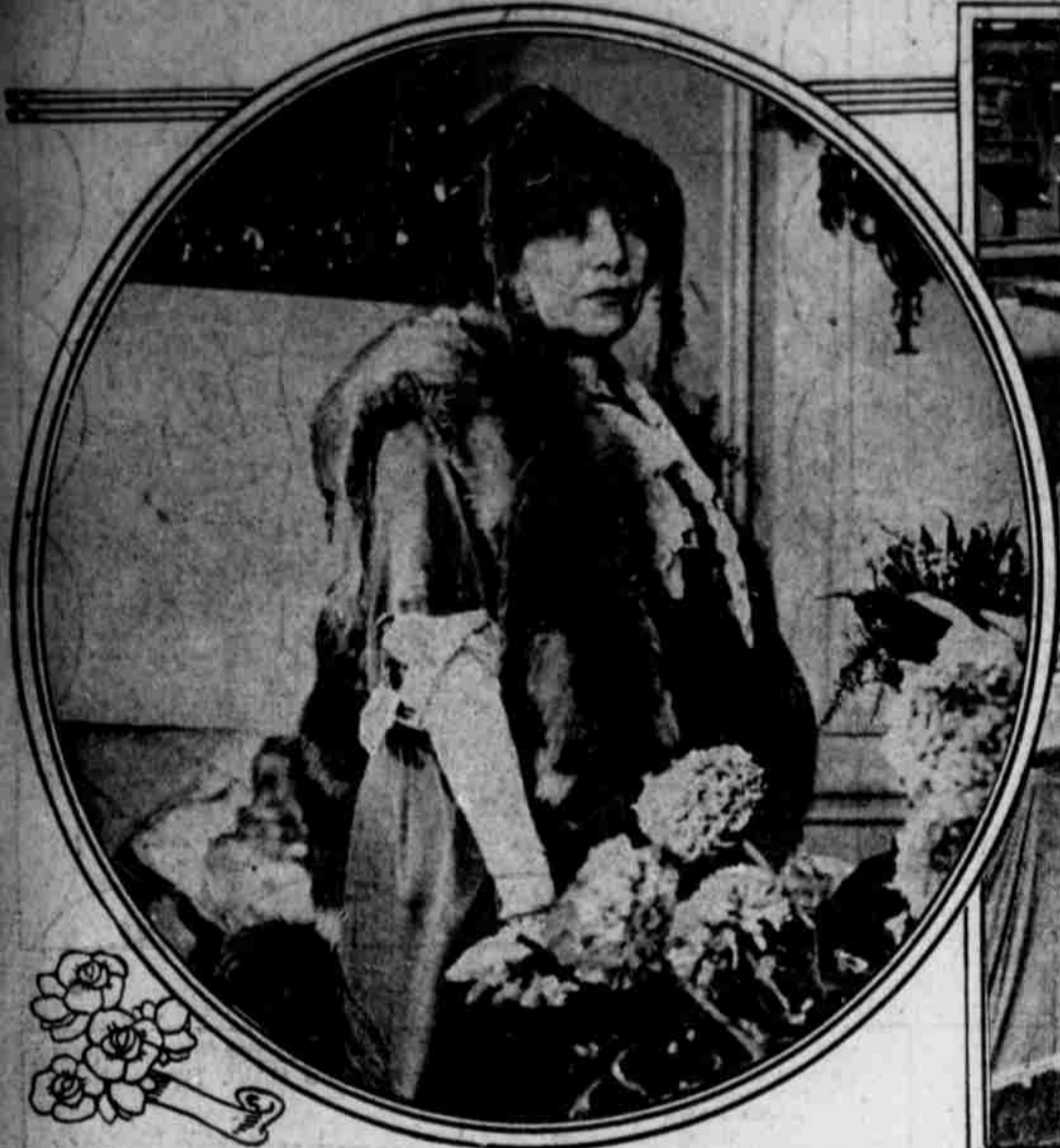
MME. BERNHARDT AS SHE APPEARS TODAY The French actress has returned to the United States for another farewell tour. The photograph, taken at her apartment in a New York hotel, gives no indication that she is suffering from the loss of her leg.