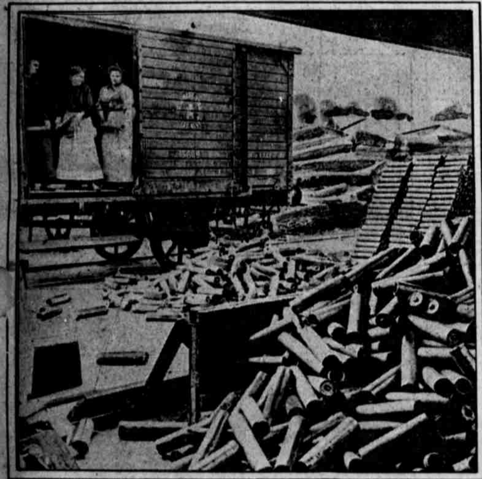
FRENCH WOMEN DO THEIR SHARE OF WAR'S WORK Any one who has tried to lift unloaded cannon shells knows that it is no easy task. Nevertheless, these women of France are only a few of their sex who are engaged in the strenuous work of moving the steel missiles from place to place.