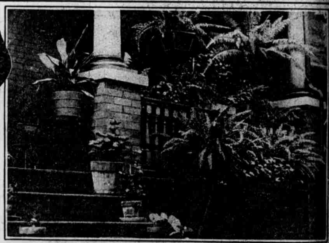
ATTRACTIVE TREATMENT OF AN OTHERWISE BARE PORCH Home of H. F. Lehnen, 1632 South Yewdall street, where vines and potted plants have been combined to rescue the front of the house from monotony.