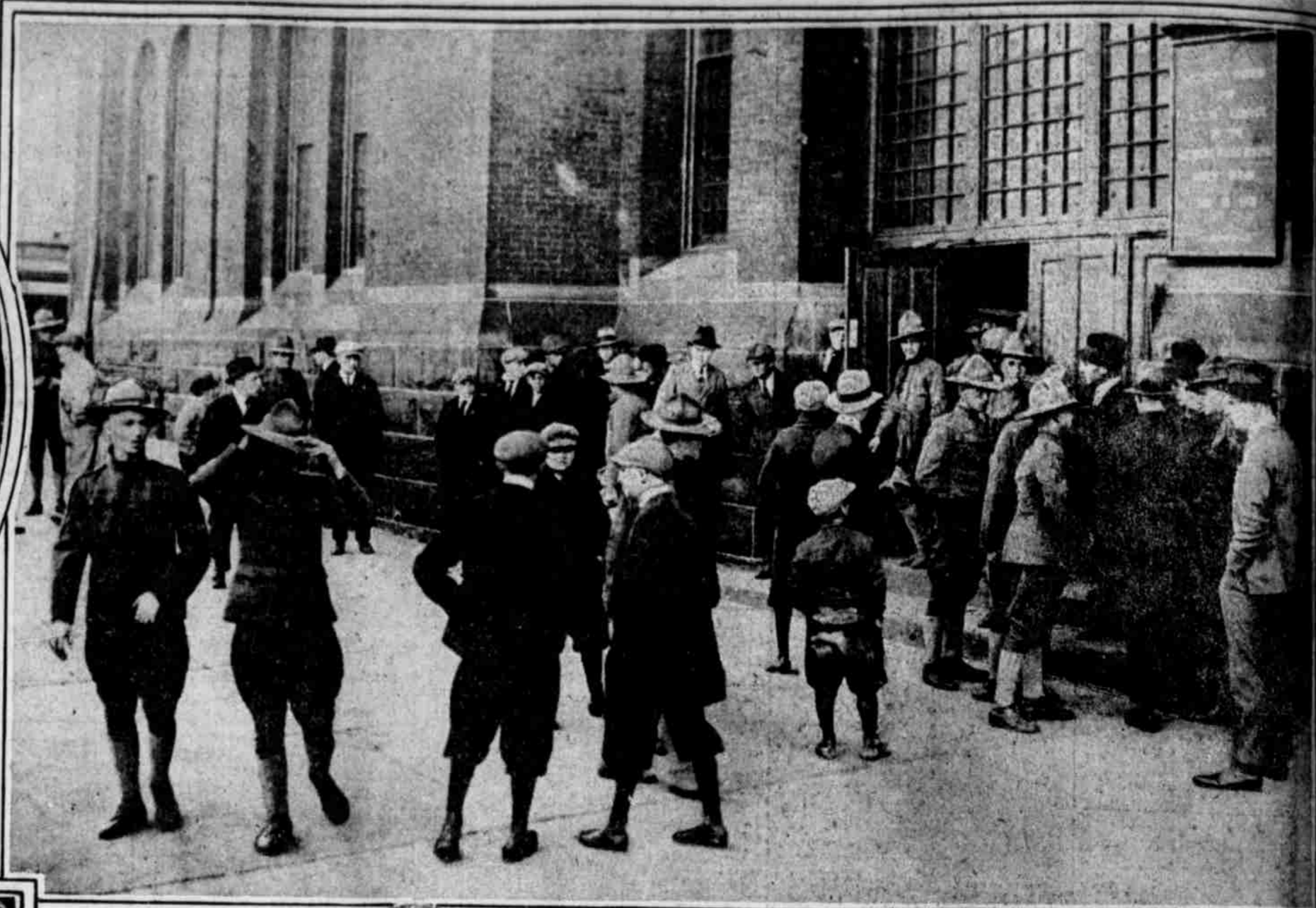
RETURNED GUARDMEN STILL IN UNIFORM, THOUGH RELIEVED OF DUTY Though they have received their official welcome home, regiment members are required to report at the armory every morning till they are mustered out, probably two weeks hence. Outside the armory door is a good place to fight battles o'er again.