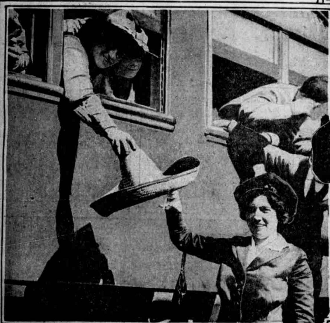
A SOMBRERO MAKES A GOOD SOUVENIR One of the numerous varieties of border products brought home by thoughtful Third Infantrymen.