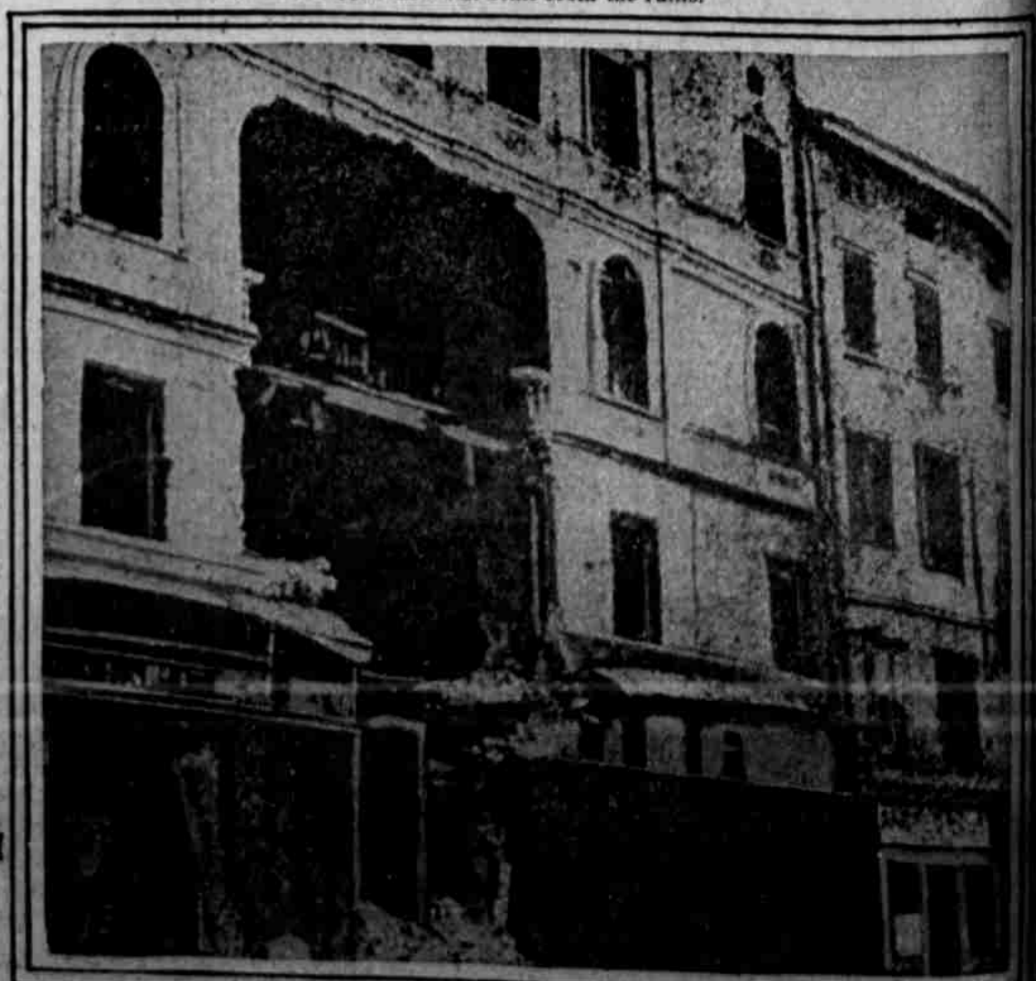
AUSTRIAN COMMANDER HAS NARROW ESCAPE The photograph shows what an Italian shell did to the house in which the Austria commander at Gorizia had established headquarters. It was only by the narrowest of margins that he escaped death.