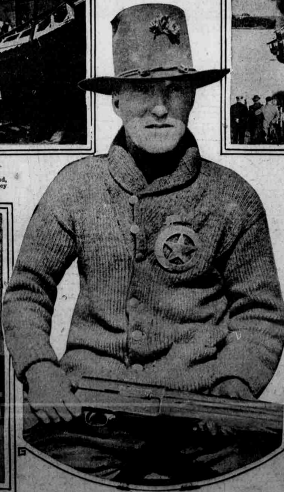
GEORGE HEERSCHAFT, MAYOR OF TAR DITCH, THE BOAT-HOUSE VILLAGE ON THE SCHUYLKILL, OUT GUNNING FOR LAWBREAKERS