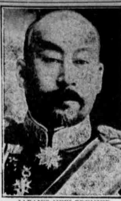
JAPAN'S NEW PREMIER Count Terauchi is head of the militarist party in Japan and is credited with a belief in a strong policy toward the United States in connection with the Japanese immigration question.