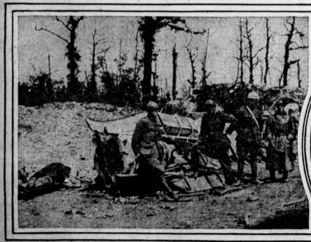
AMBULANCE AND ITS WOUNDED OCCUPANTS DESTROYED BY SHELL