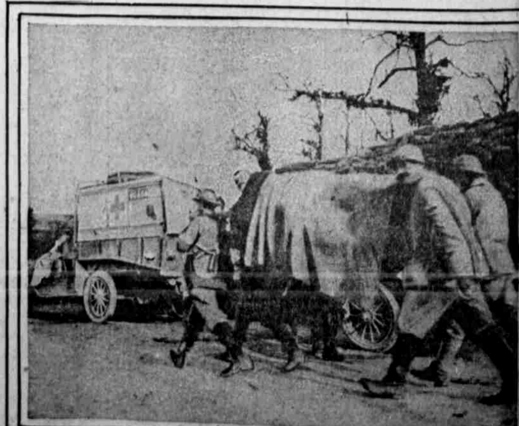
FRENCH WOUNDED BEING BROUGHT TO AMERICAN AMBULANCE