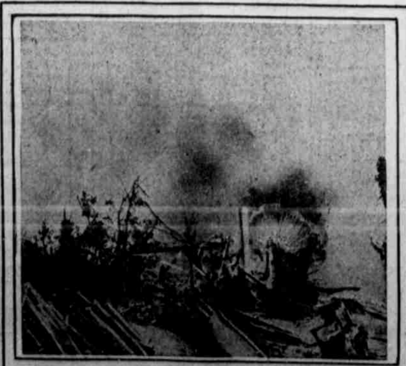
GERMAN SHELL BURSTING ON LINES AT FORT SCUVILLE