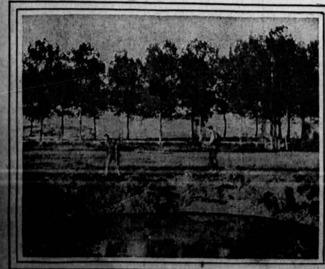
GIANT CRATER OPENED BY 16-INCH SHELL