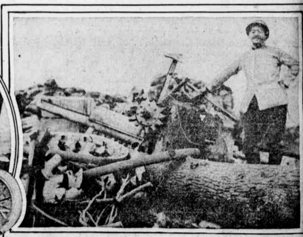
WHAT A GERMAN SHELL DID TO A FRENCH GUN