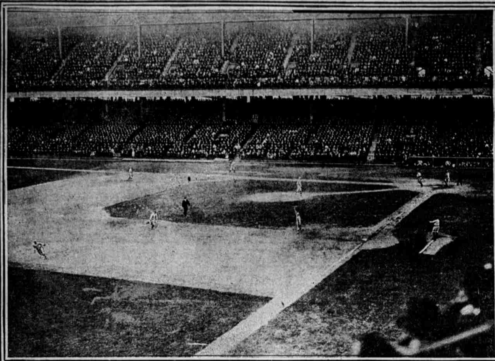
PANORAMA OF THE BROOKLYN THROG WHICH CROWDED THE STANDS AT THE OPENING PHILLY GAME YESTERDAY

EXCLUSIVE PICTURES OF OPENING OF PHILLY-BROOKLYN SERIES ARE PHOTOGRAPHIC FEATURES