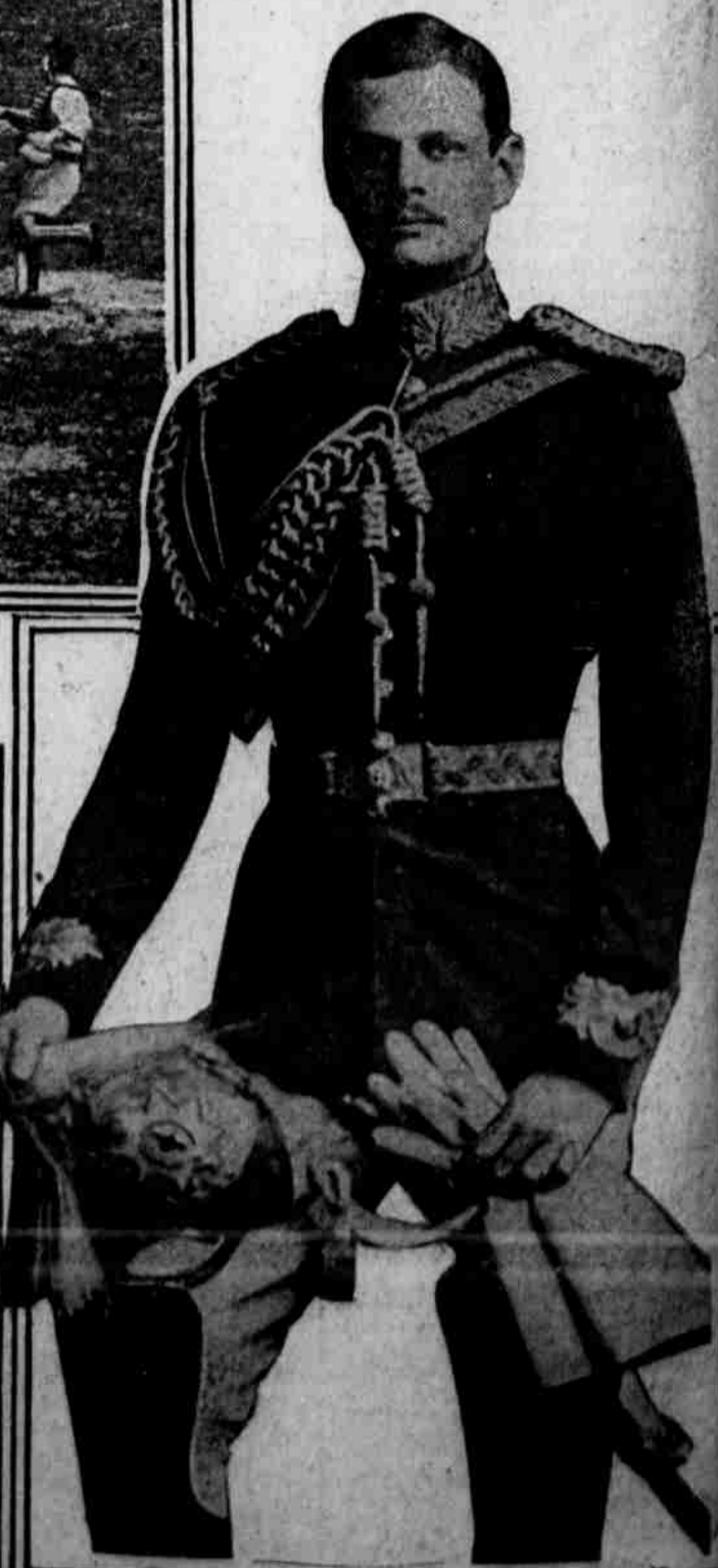
CAPTAIN JOHN JACOB ASTOR FIGHTING IN THE TRENCHES The son of Baron Astor is back again at the front after his recent marriage to Lady Nairns.