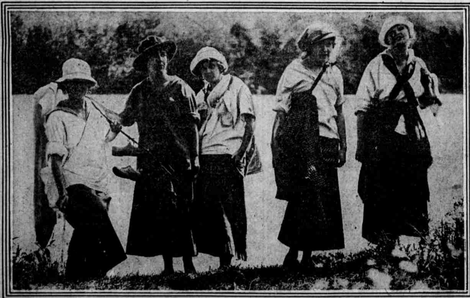
DAUGHTERS OF WEALTHY FAMILIES DO A 100-MILE "HEALTH HIKE" Barefoot, they walked from South Woodstock, Conn., to Sharon, Mass., in four days as a "back to nature" experiment, which they found rough on the feet. They are pupils of a school of outdoor dancing.