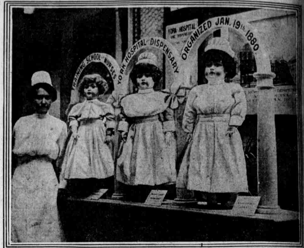
YORK HOSPITAL PROUDLY EXHIBITS ITS UNIFORMS FOR NURSES At the Bellevue-Stratford Hotel, where the convention of the American Hospital Association is in progress, these dainty dolls are exhibited by the York (Pa.) Hospital, Dispensary and Training School, dressed in the uniforms of its three grades of nurses.