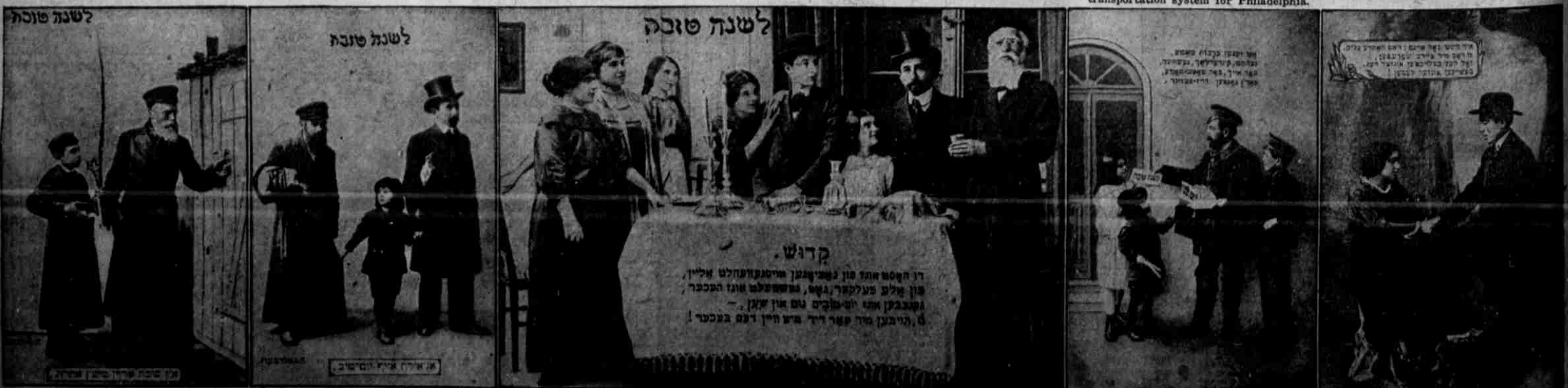
PICTURES FROM THE "OLD COUNTRY" ILLUSTRATE THE BEGINNING OF ROSH HASHANA, THE JEWISH NEW YEAR, WHICH WILL BE CELEBRATED TONIGHT A grandfather and grandson at the entrance of a Susha, which comes immediately after the Day of Atonement. A father and son bringing home a stranger for the holidays, in accordance with an ancient Jewish custom. A family assembled around the table before the holiday meal. The grandfather is about to say the prayer of Kiddush, holiday grace. A father and son, in the uniform of Russian postmen, bringing New Year's greetings to the children. A young man speaking to his fiancée, expressing a wish for their mutual happiness and good luck in the future.