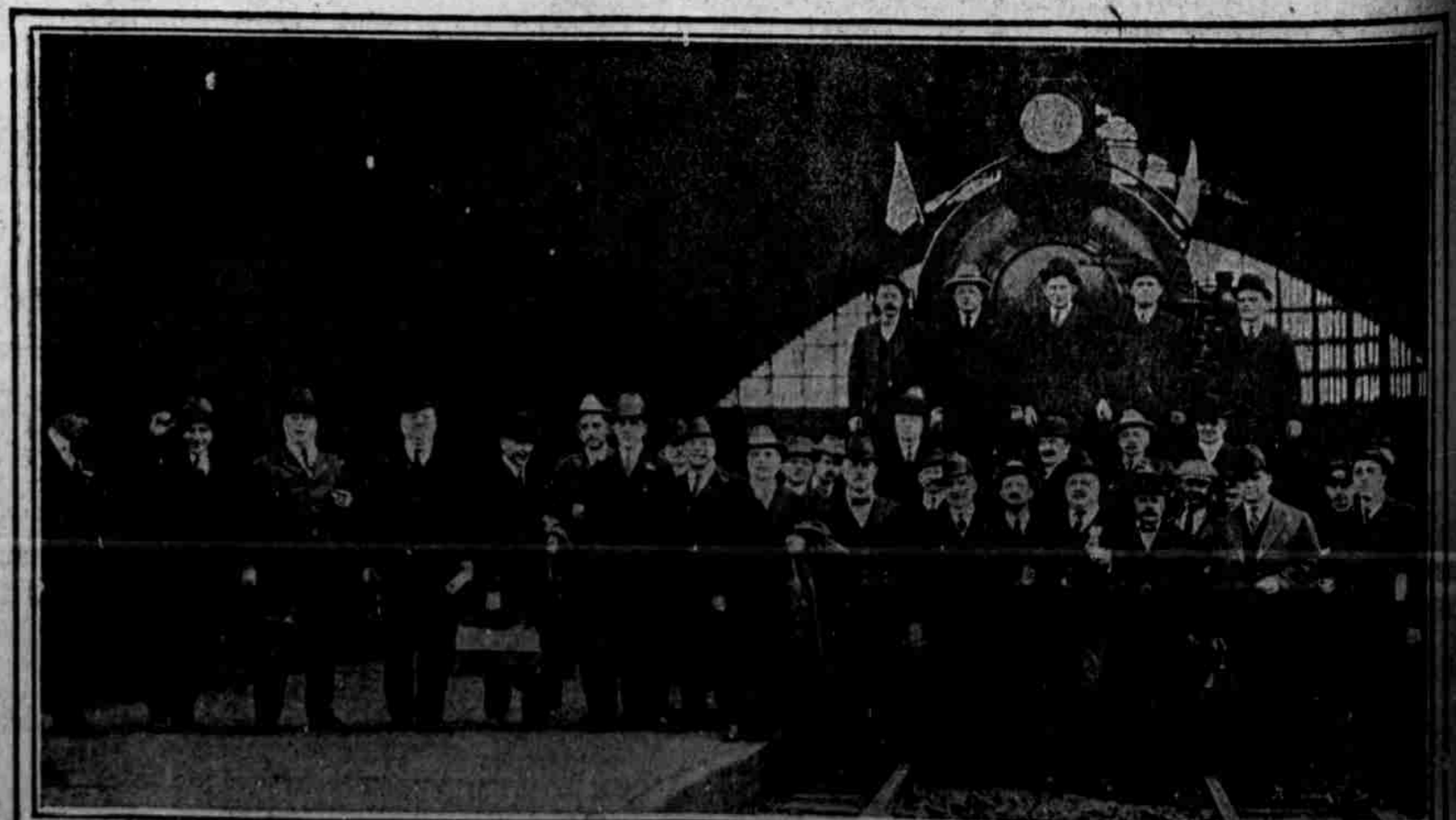
VARE MEN OFF TO CLUB CONVENTION IN YORK