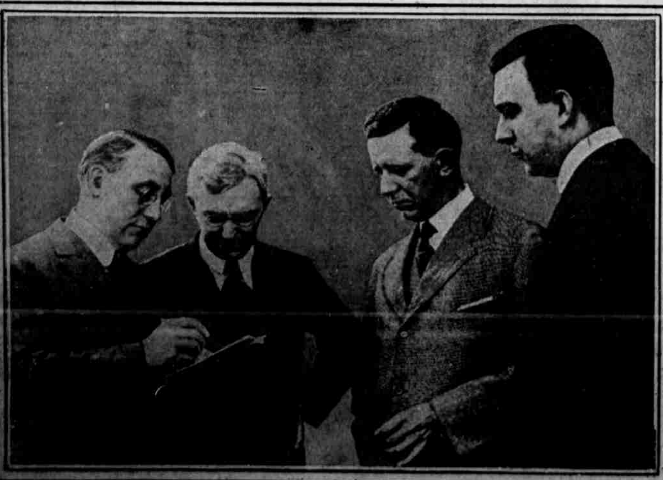
AMERICAN HOSPITAL ASSOCIATION IN CONVENTION HERE