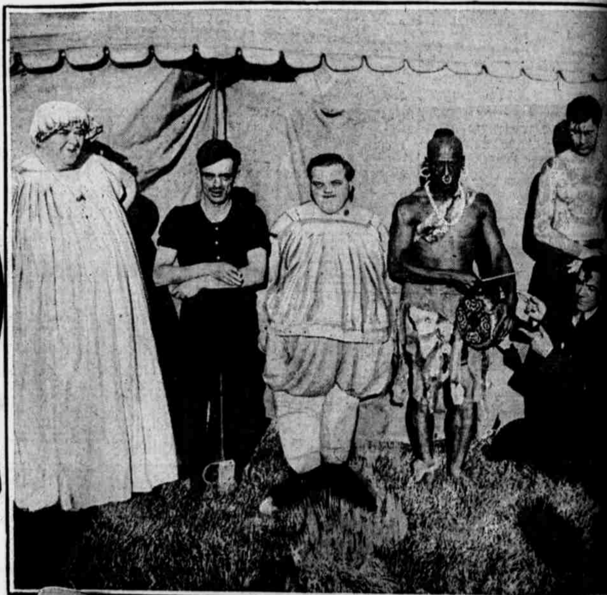
THE CAST OF CHARACTERS AT THE ALLENTOWN FAIR Here are the principals in the sideshow entertainment at the State Fair, which opened in Allentown yesterday. From left to right are the fat lady, the sword swallower, the fat boy, the Congo man and the tattooed man. Kneeling, in front, is the Barker.