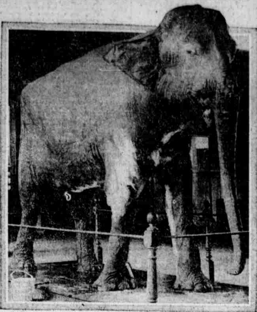
Famous elephant at Academy of Natural Sciences gets doctor's care.