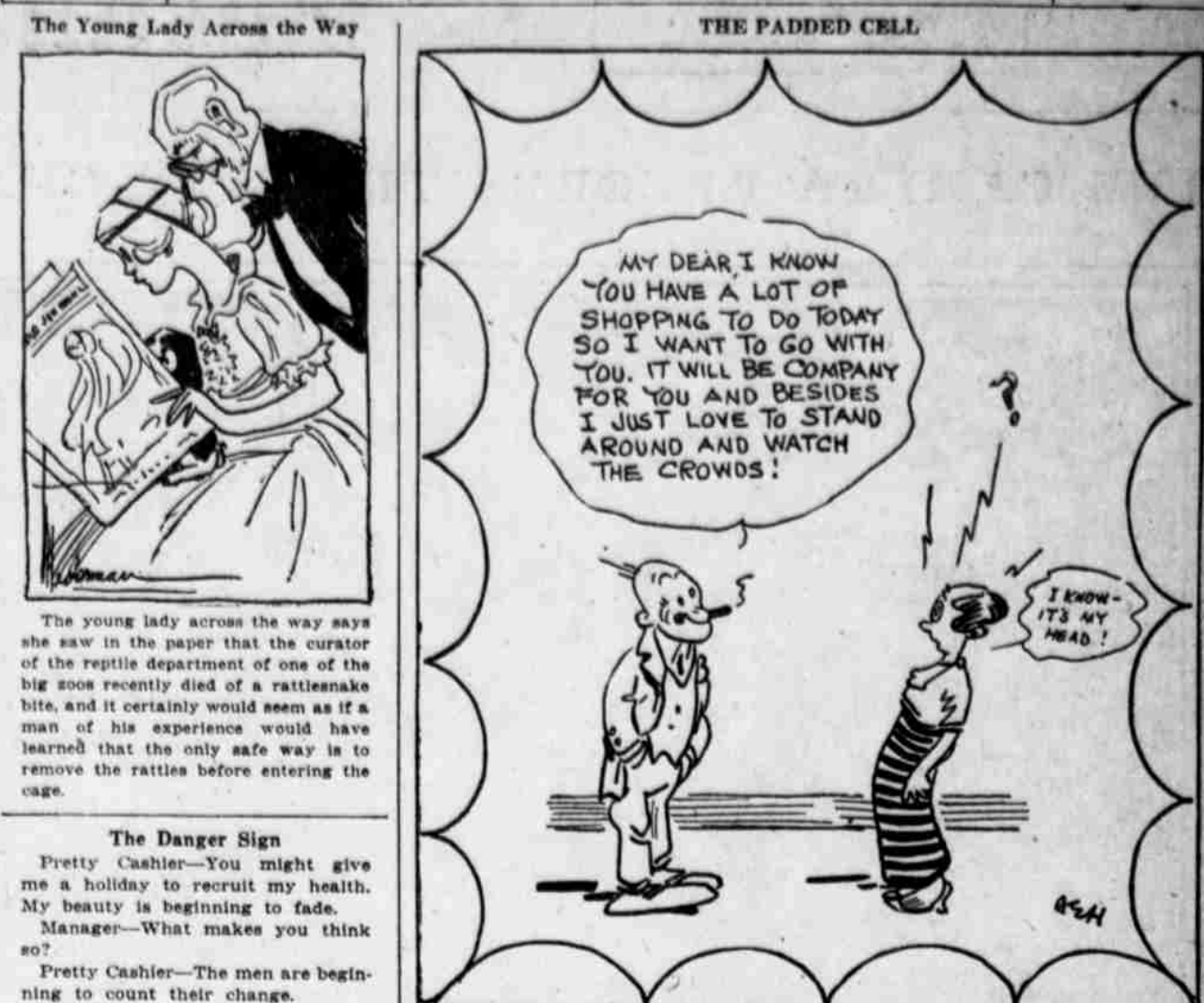
The young lady across the way says she saw in the paper that the curator of the reptile department of one of the big zoos recently died of a rattlesnake bite, and it certainly would seem as if a man of his experience would have learned that the only safe way is to remove the rattles before entering the cage.