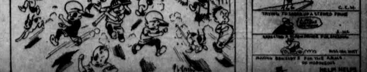
THE VISITING TEAM TRIED TO COLLECT TRAVELING EXPENSES.