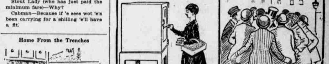
Cabman (with exaggerated politeness)—Would you mind walking the other way and not passing the horse? Stout Lady (who has just paid the minimum fare)—Why? Cabman—Because if 's' sees wot 'e's been carrying for a shilling 'e'll have a fit.