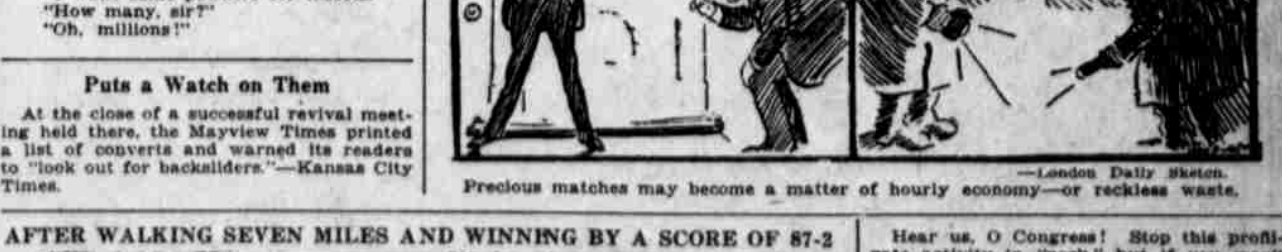
At the close of a successful revival meeting held there, the Mayview Times printed a list of converts and warned its readers to "look out for backsliders."—Kansas City Times. Precious matches may become a matter of hourly economy—or reckless waste.