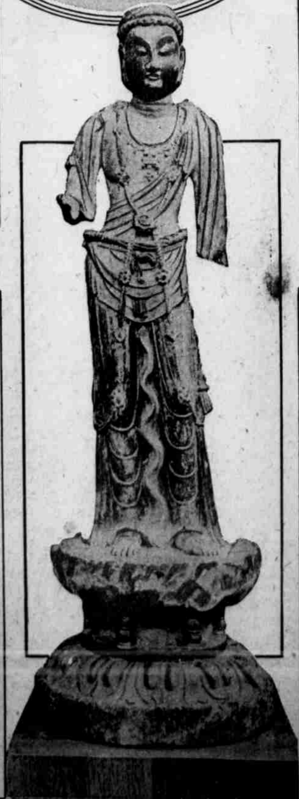
CHINESE VENUS DE MILO NOW IN PHILADELPHIA The University of Pennsylvania Museum has acquired this life-size statue, which is remarkably similar in some respects to the Greek goddess, particularly its broken arms. It is believed to be more than 700 years old.