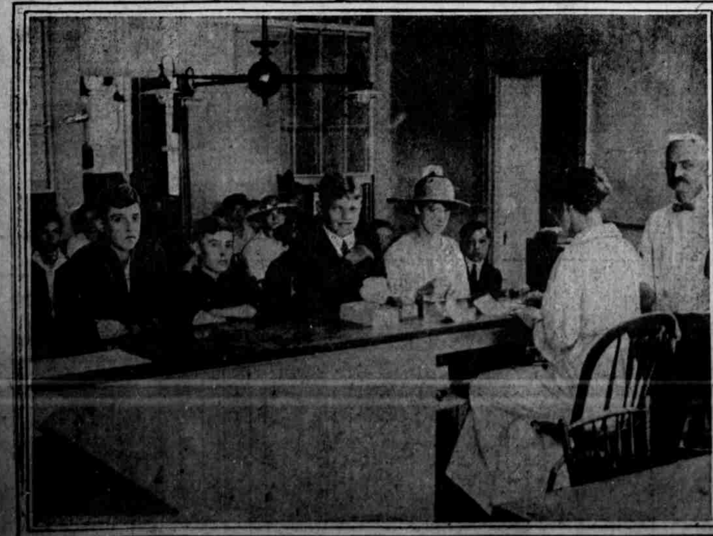
SCHOOLS CLOSED, THEY CHOOSE WORK The infantile paralysis quarantine is the cause of a great increase in the daily line of applicants for employment certificates, as this glimpse of the office of the Compulsory Education Bureau reveals.