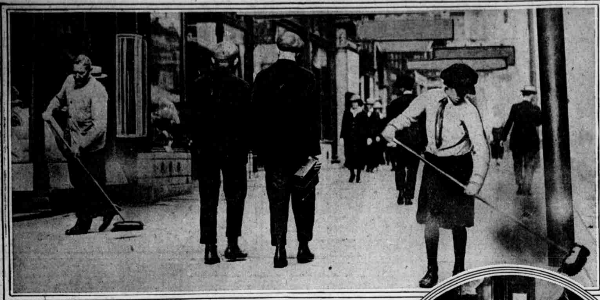
STIRRING UP THE OTHERWISE QUIET GERMS ON CHESTNUT STREET After all the agitation and the publicity given to the fact that the sweeping of unsprinkled dust across the pavements is a menace to health, here are two new pictures, above and at the right below, which reveal that the practice continues.

THE CAMERA RECORDS THE EVER-CHANGING EVENTS IN THE VARIED NEWS OF THE DAY