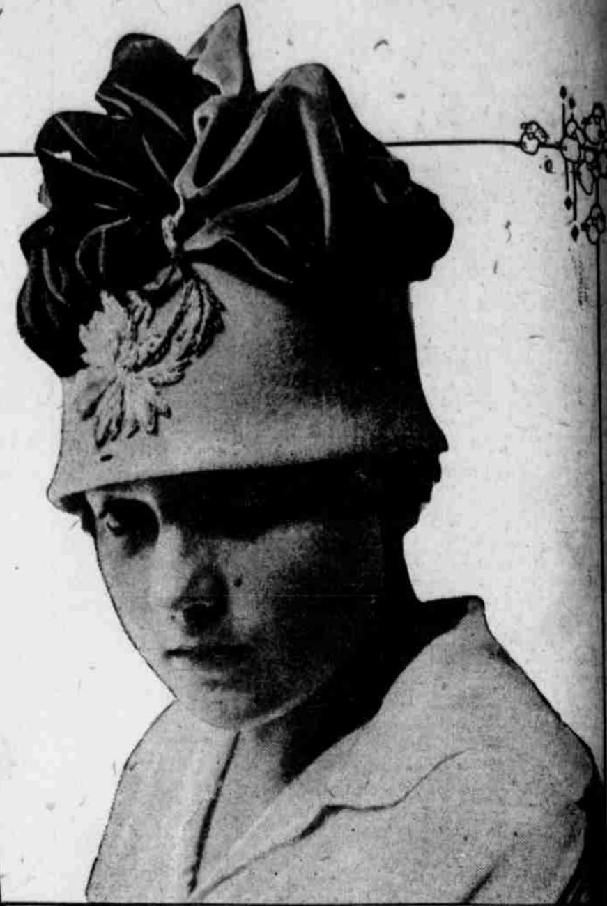
MADE IN PHILADELPHIA New autumn bonnet on the high turban model, carrying hand embroidery below a velvet crown, showing that residents need not go to other cities for smartness in style.