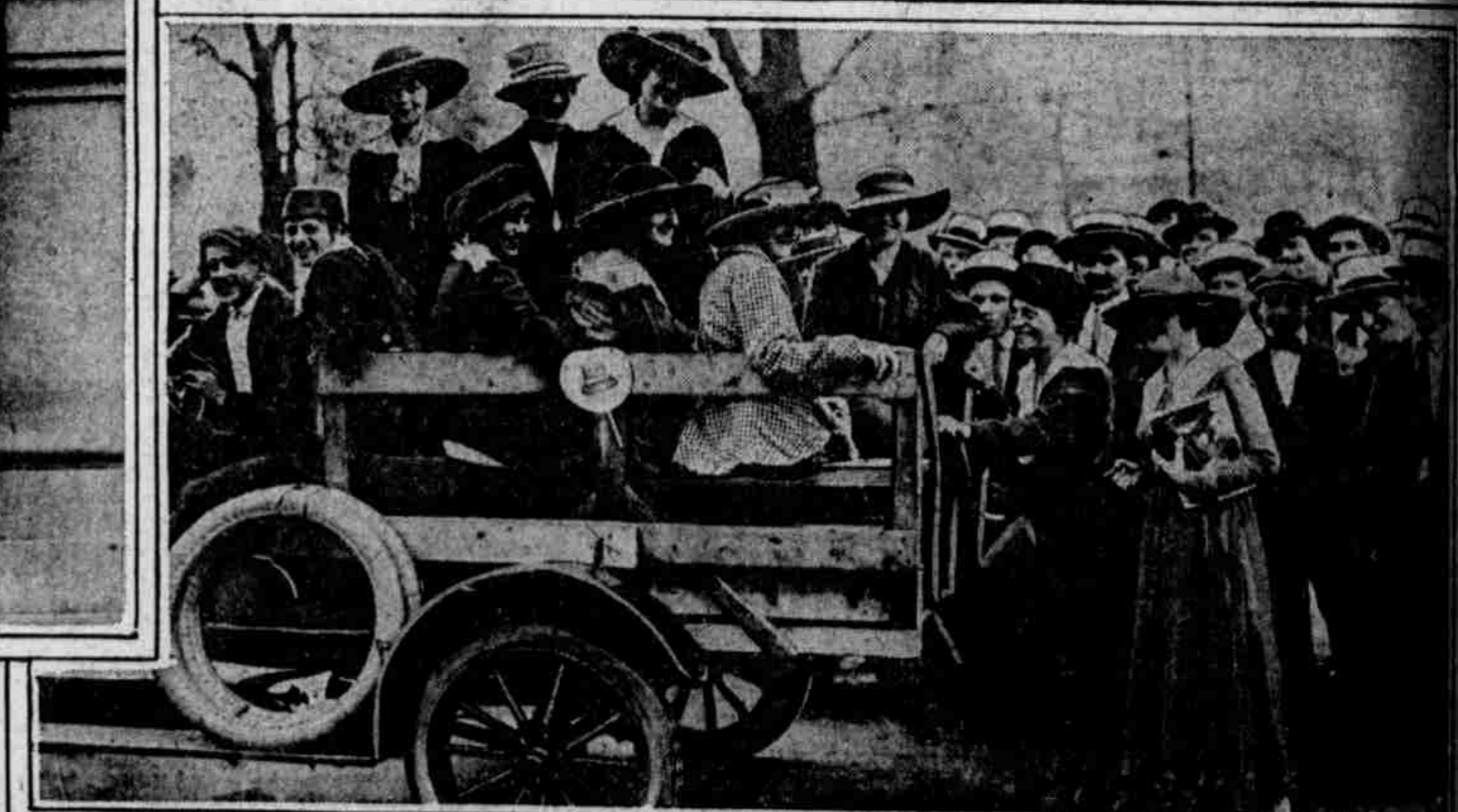
THE JITNEY DOES THE WORK WHILE THE NEW YORK TRANSIT STRIKE IS ON The telephone company brings its girls from widely separated sections of the city on improvised buses, which are welcomed as a relief from crowded cars.