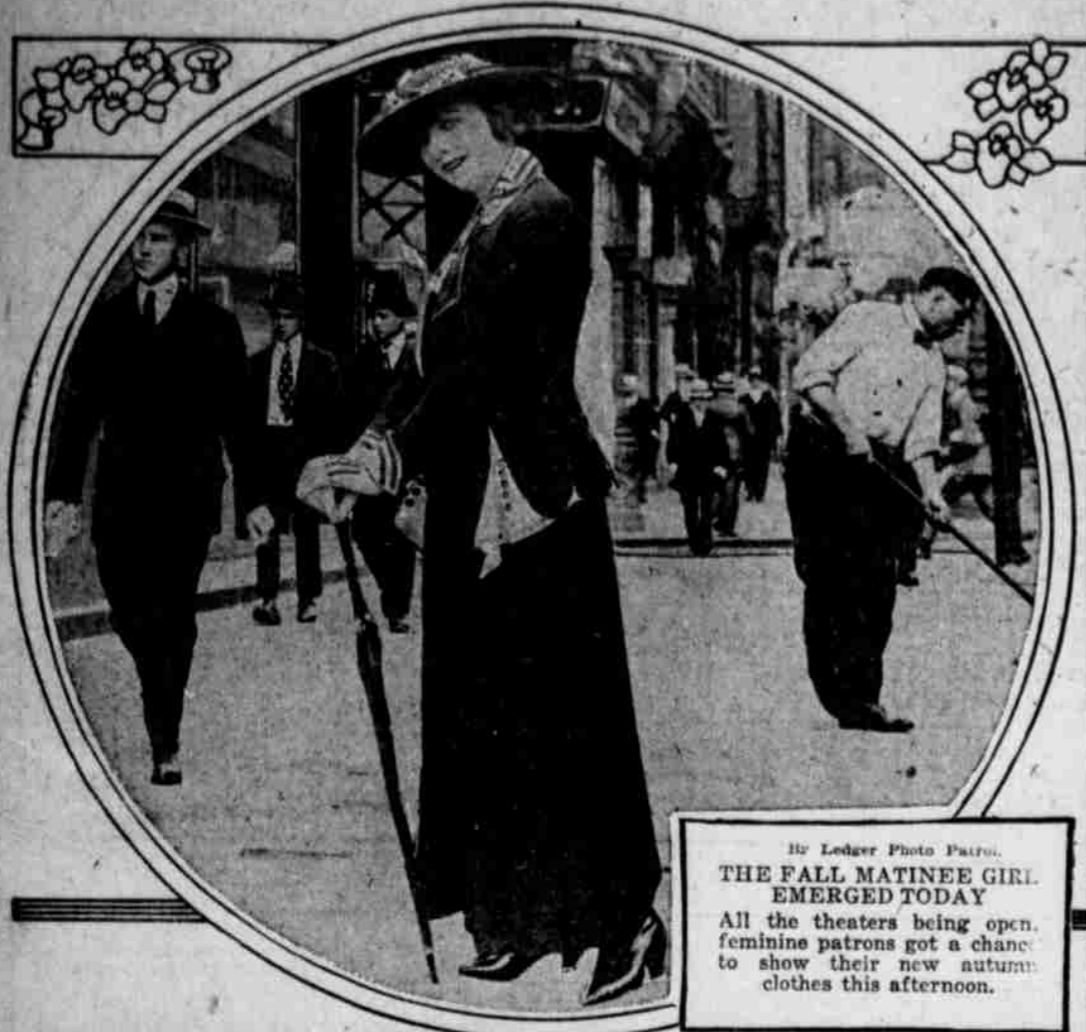
THE FALL MATINEE GIRL EMERGED TODAY All the theaters being open, feminine patrons got a chance to show their new autumn clothes this afternoon.

PICTURESQUE HAPPENINGS IN THE NEWS OF THE DAY PORTRAYED BY THE CAMERA MAN