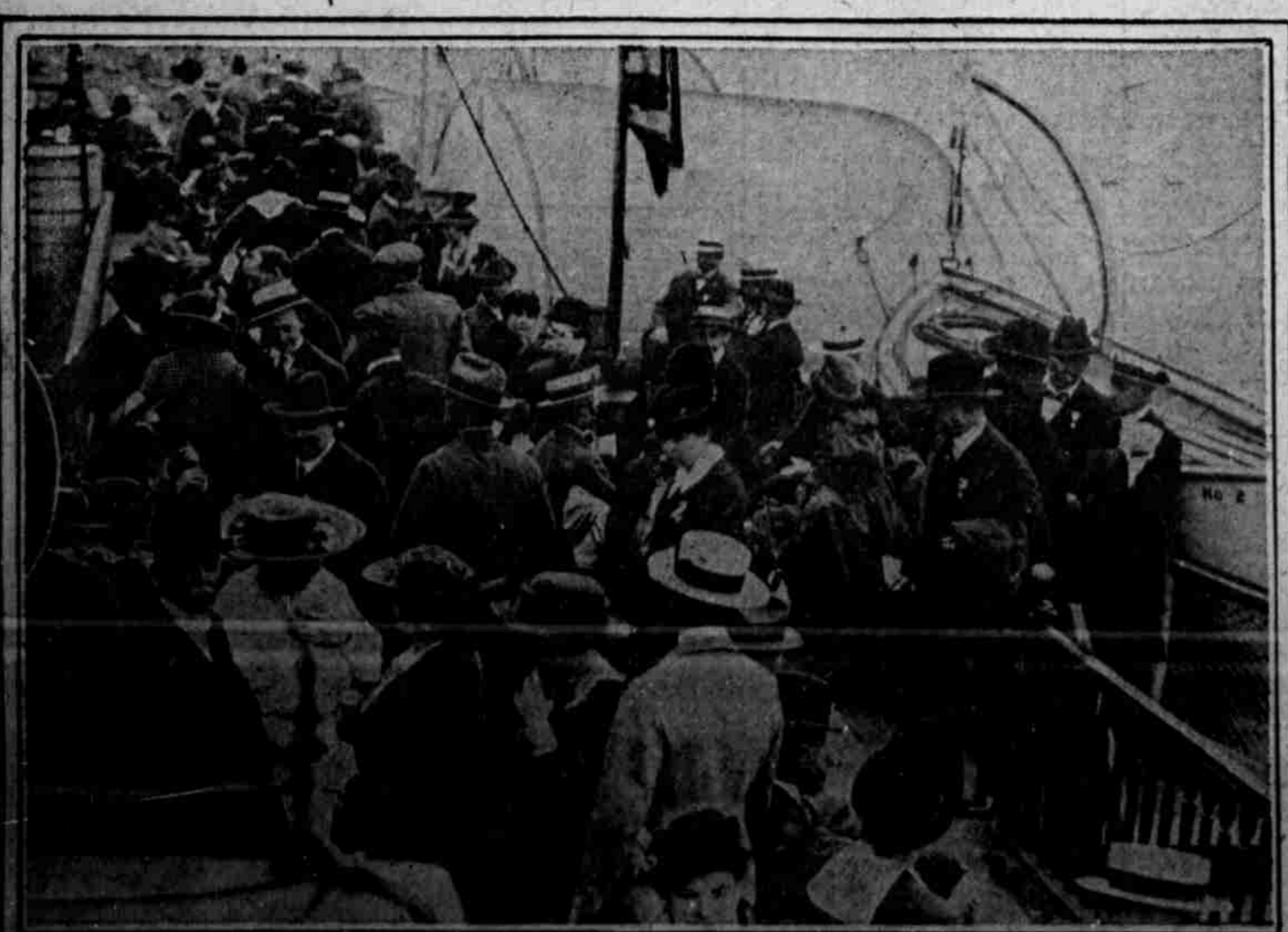
WATERWAYS DELEGATES EMBARK FOR RIVER TRIP TO TRENTON Here is a scene on the deck of the Queen Anne, showing the deeper waterways advocates and their womenfolk starting for the Jersey capital, where they will be extensively entertained and spoken to.