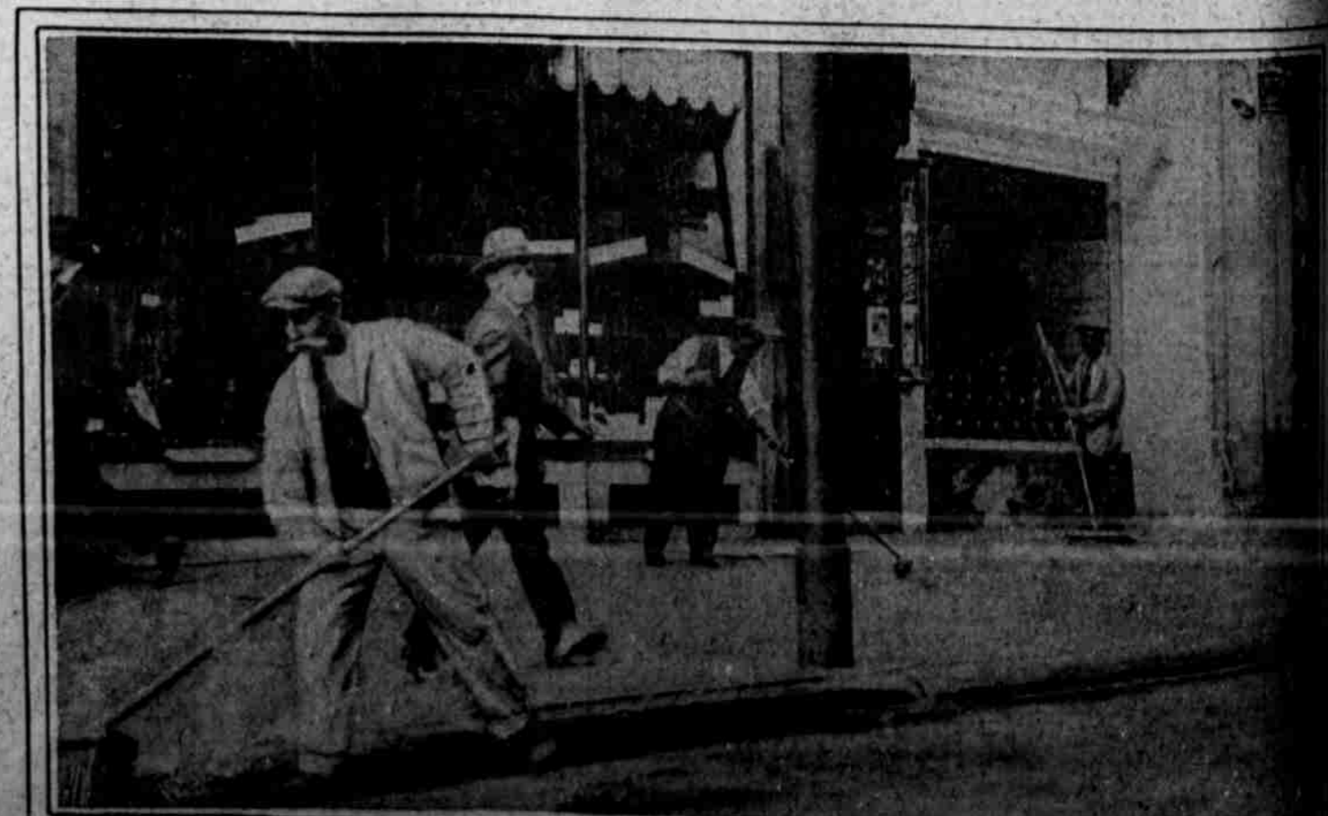
IF ONE MUST SWEEP DUST ACROSS THE STREETS, WHY NOT SPRINKLE IT? Showing how, despite many appeals and repeated warnings, business houses still permit their employes to sweep the floor debris from their stores directly across the pavements, to be inhaled by all passing pedestrians.