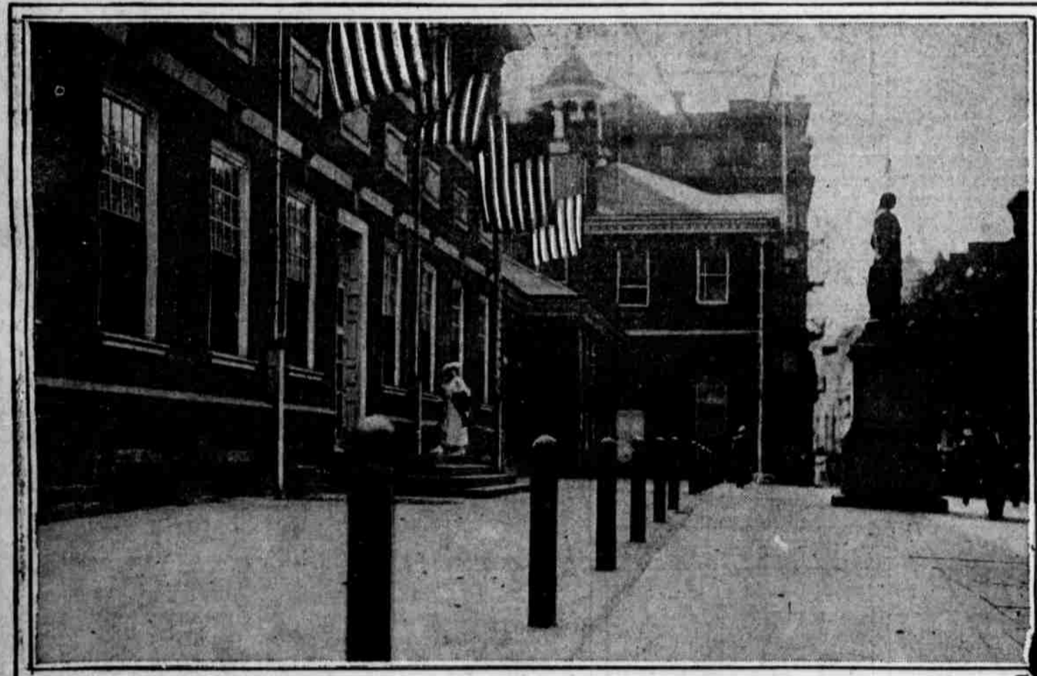
OLD STATE HOUSE RESUMES ITS ORIGINAL APPEARANCE The row of wooden posts placed along the front of Independence Hall is an exact replica of the hitching posts used in colonial days, when members of the Continental Congress used to drive to the State House and tie their horses outside of the now historic building. This addition was the last step in restoring the hall to its original appearance of more than a century ago.