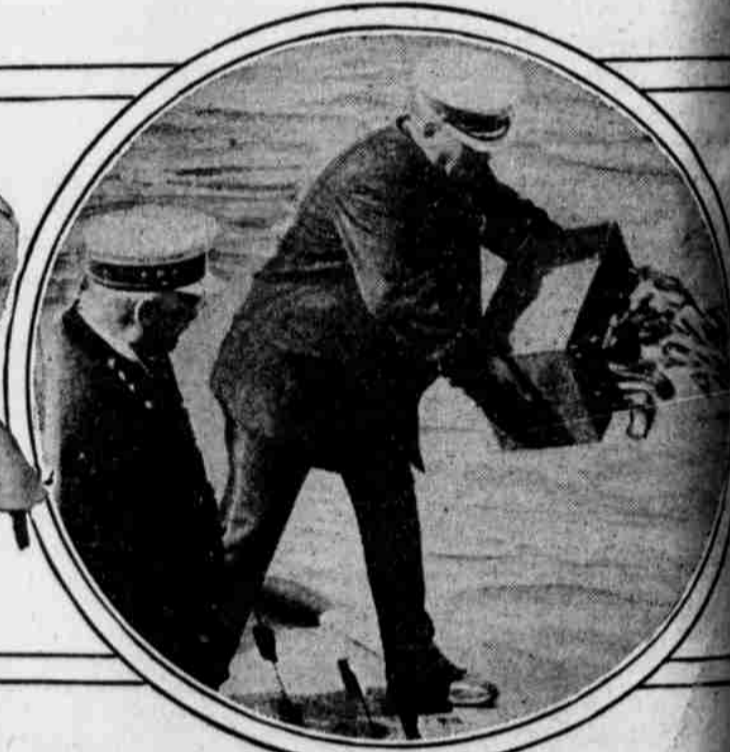
GIVING FIREARMS A FIT BURIAL Chicago police are seen dumping the year's collection of weapons taken from convicted criminals into Lake Michigan.