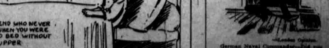
Friends We Never Forget NOW TAKE THIS AN DON'T YOU BE BAD NO MOR, HONEY