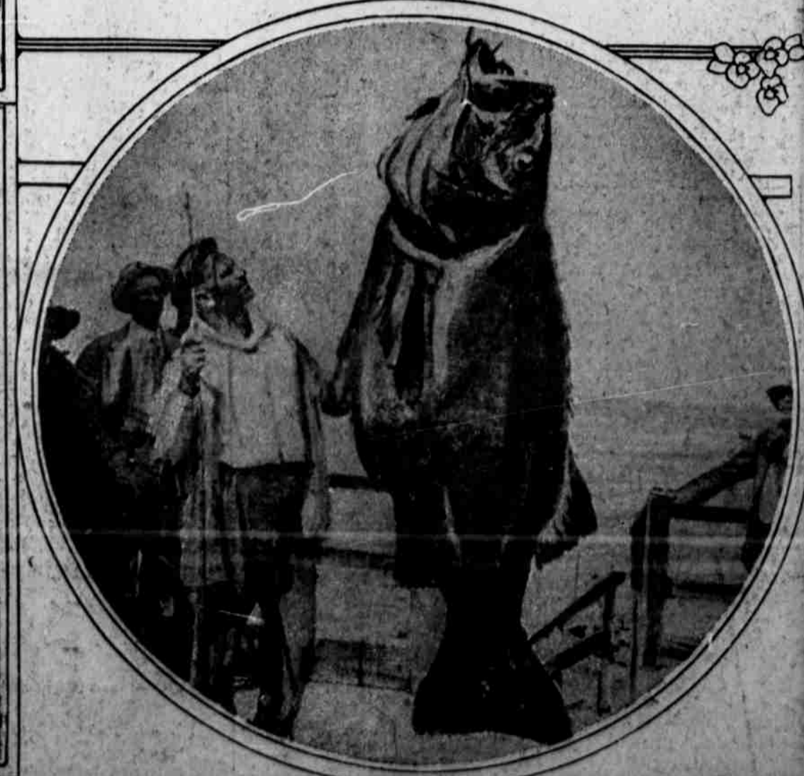
ENVY OF PHILADELPHIA ANGLERS It's a 515-pound sea bass, the largest catch of 1916, and was made off Catalina Island, California.