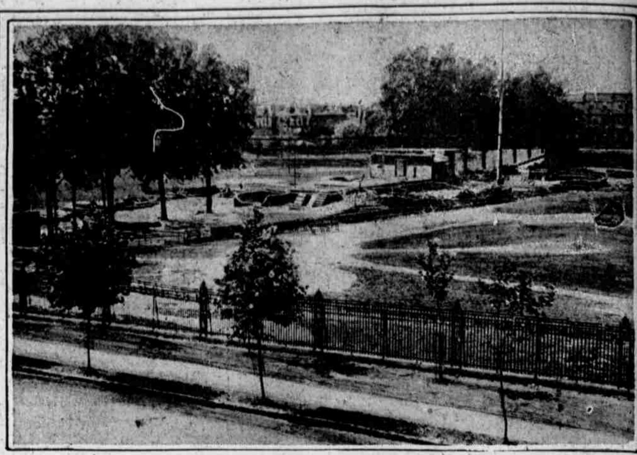
TODAY'S PLAYERS TAKE YESTERDAY'S PLAYGROUND The Belmont Cricket Club headquarters, at Forty-ninth street and Kingsessing avenue, once the home of champions of the flat bat and the leveled crease, is being razed that the children of the neighborhood may use the site as a recreation center.