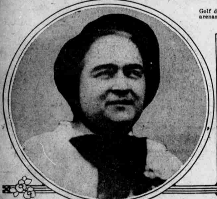
A QUAKER SUFFRAGIST