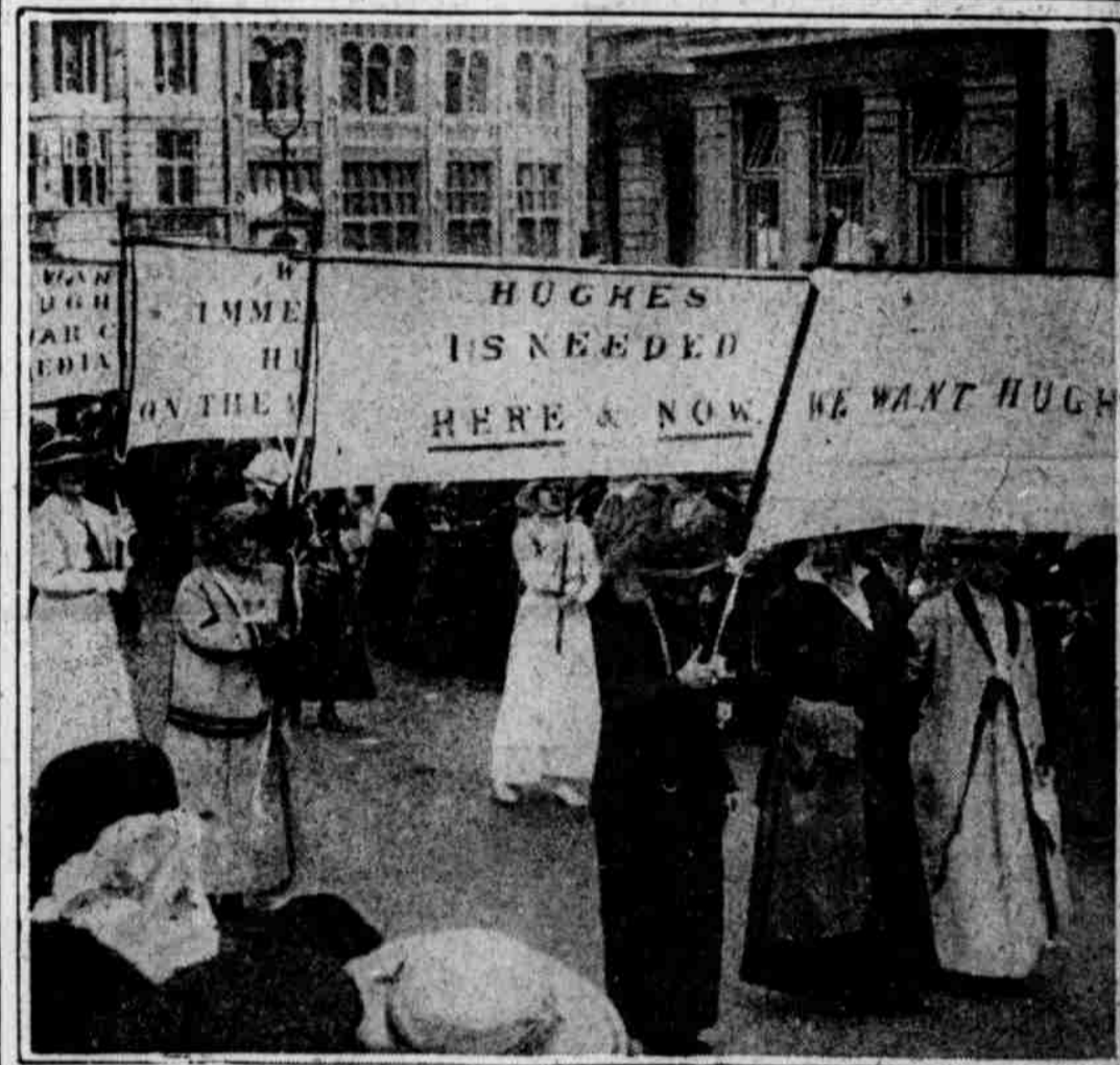
"WE NEED YOU, HUGHES!" THEY SAY But they mean Colonel Sam, for they are Canadian women, not suffragists of Republican proclivities.