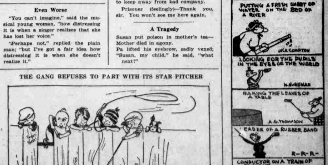
The Retort Unconscious Magistrate (discharging prisoner)—Now, then, I would advise you to keep away from bad company. Prisoner (feeling)—Thank you, sir. You won't see me here again.