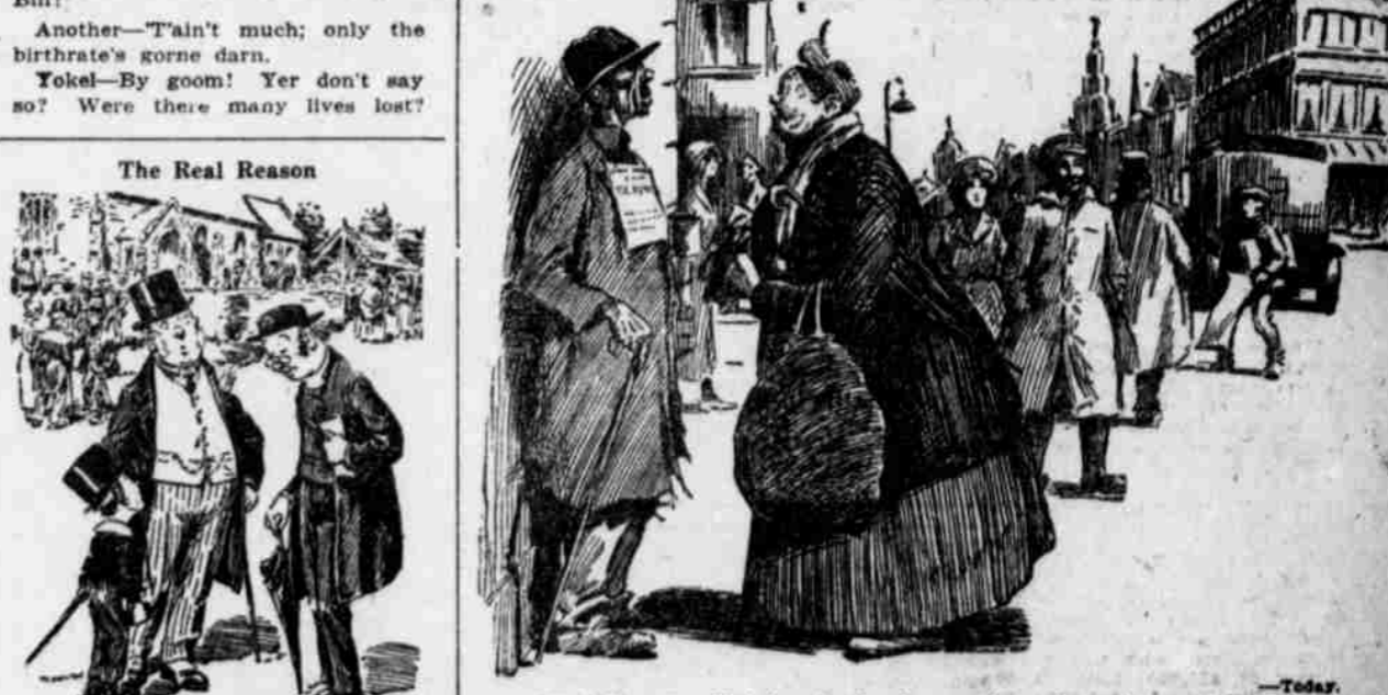
Was it Mined? Yoke!—What's t' war noos terday, Bill? Another 'Tain't much; only the birther's gone darn. Yoke!—By gomm! Yer don't say so? Were there many lives lost?