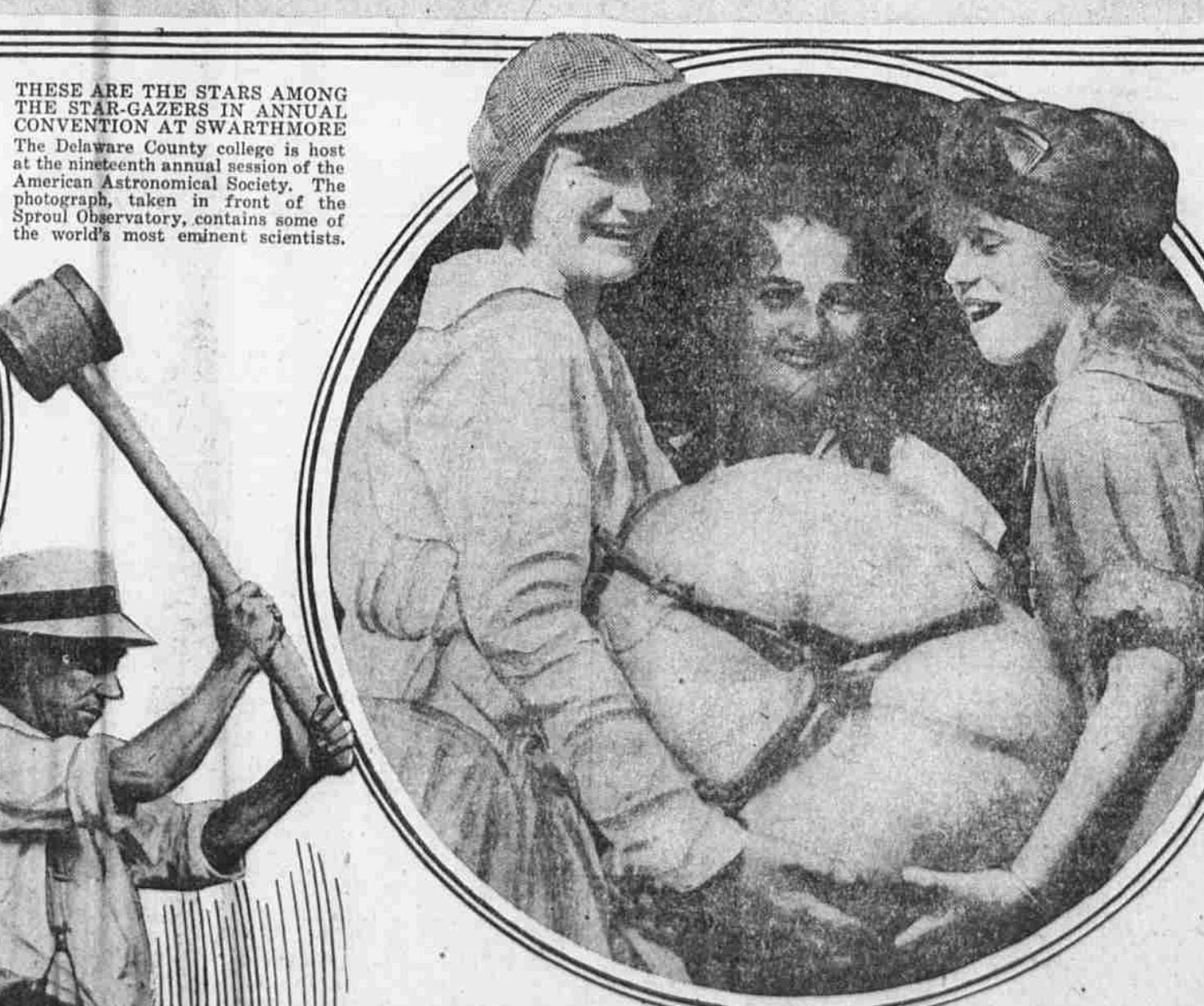
"SOME PUN'KIN" ON EXHIBIT AT THE BYBERRY FAIR The three girls had their hands full holding this huge specimen, which weighs 150 pounds.