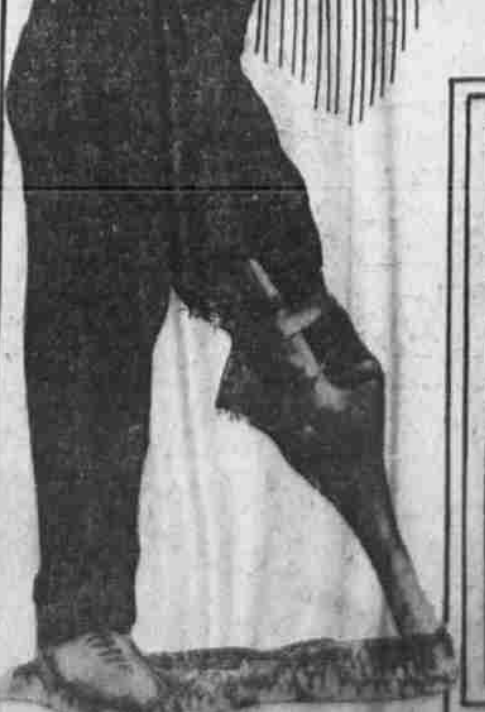
HE'S MINUS A LEG, BUT-He made the bell ring with every swing of his powerful error.